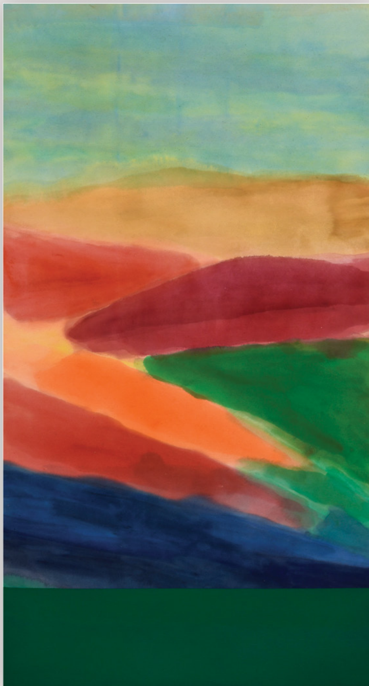
Vermont Memory II acrylic on canvas 67 x 36 in. FG© 140983