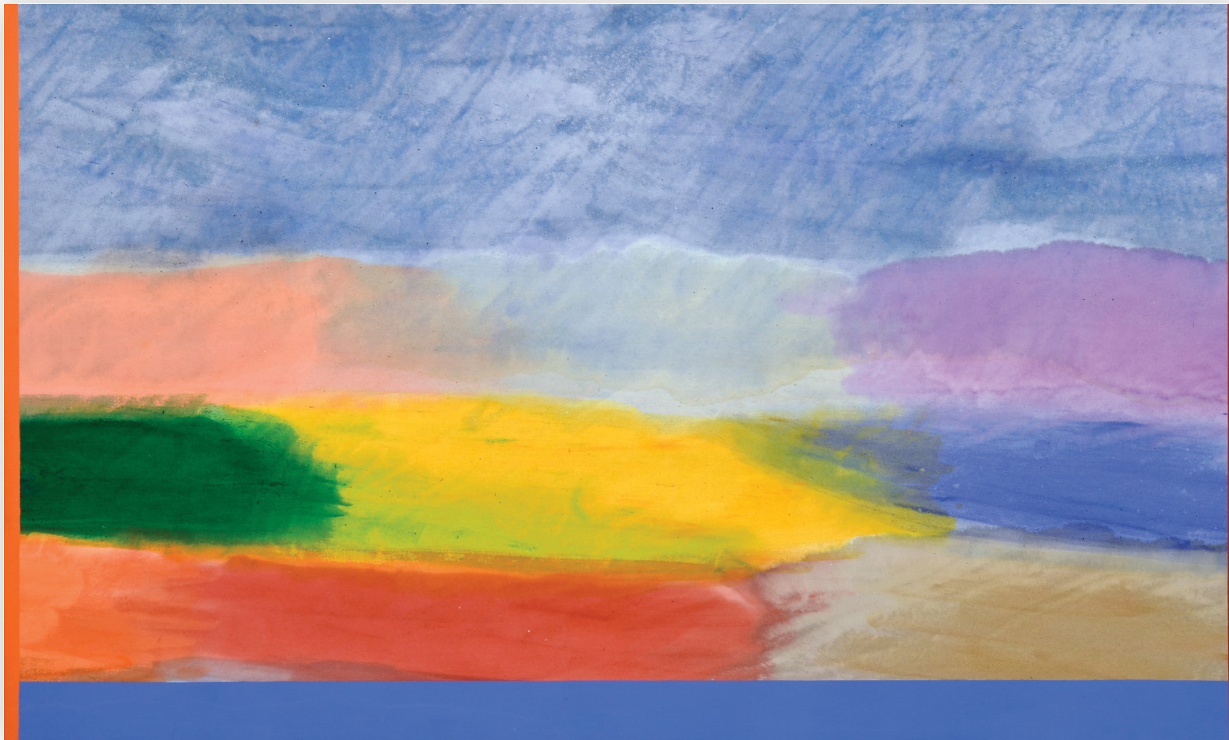
Time Beyond acrylic on canvas 45 x 75 in. FG© 140981