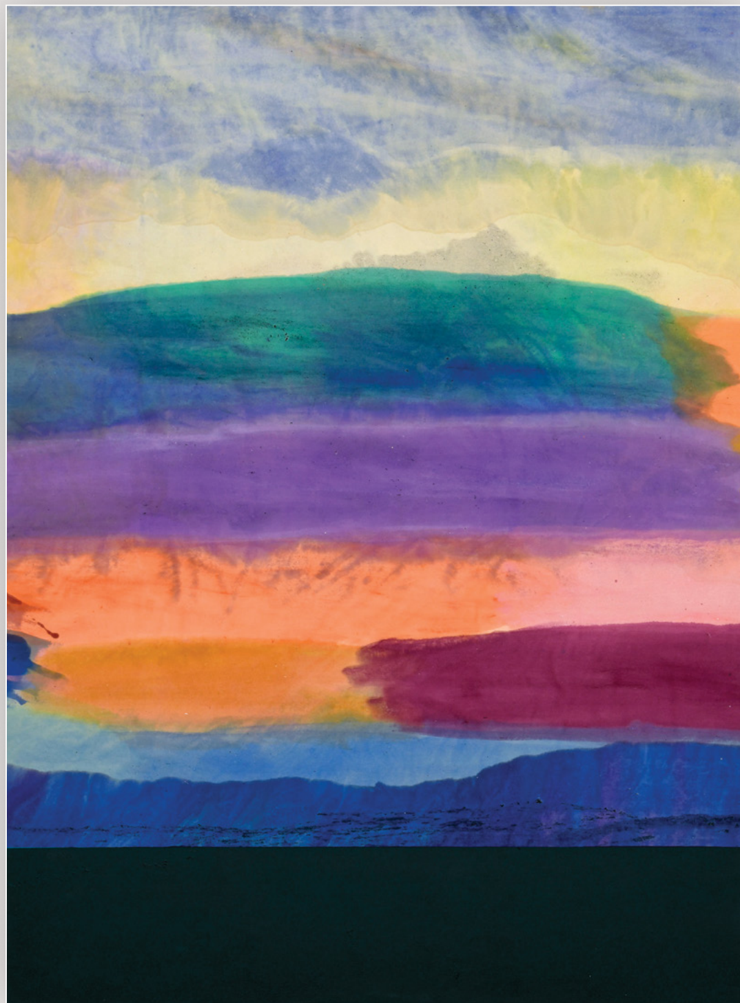
Starting Free acrylic on canvas 89 x 66 in. FG© 140979