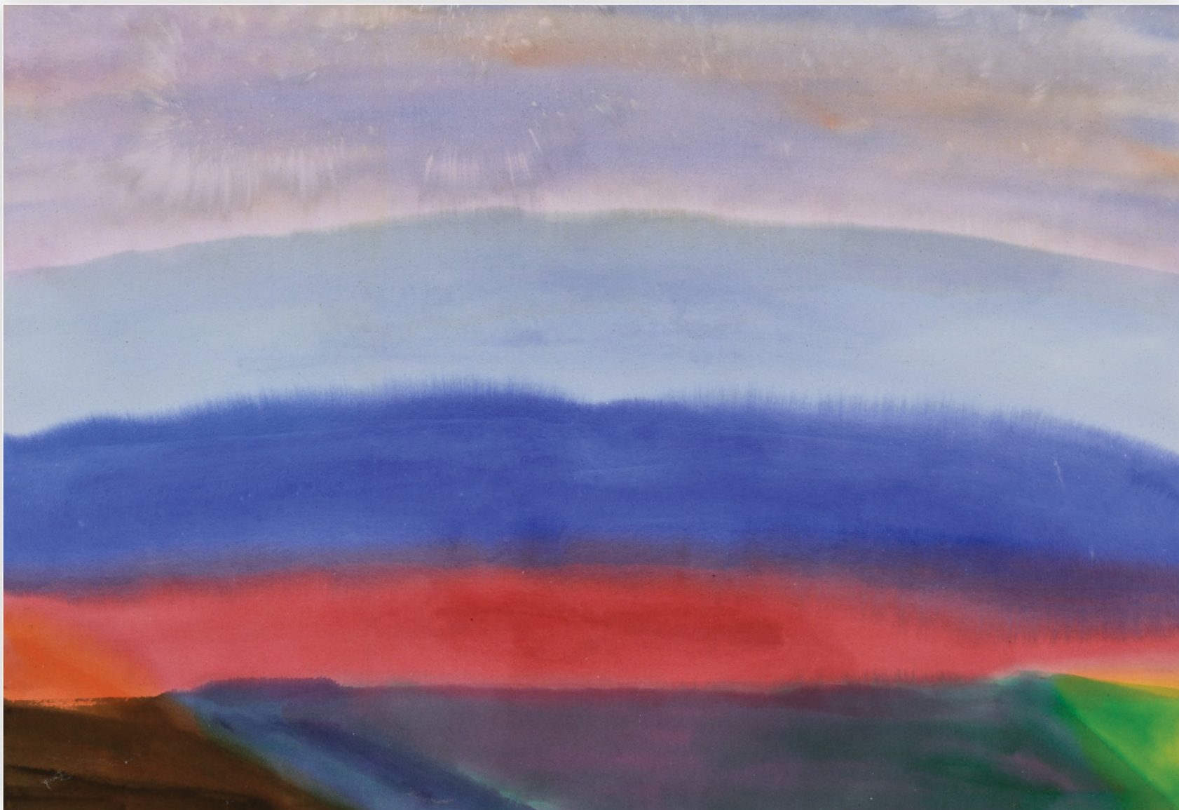
(cover) Early Horizon II | acrylic on canvas | 35 x 51 in. | FG© 140975