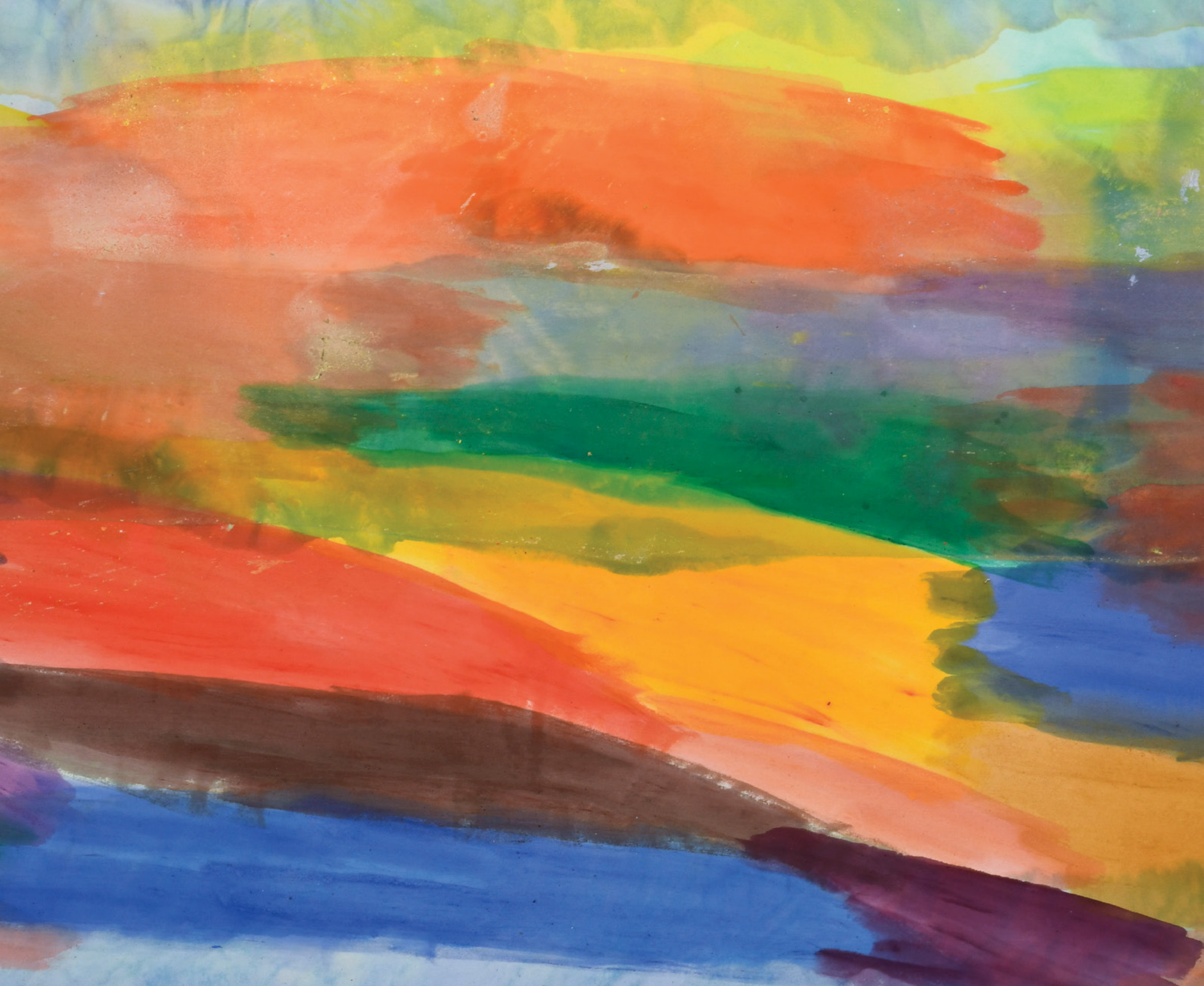
Rising Wind acrylic on canvas 91 x 66 in. FG© 140830