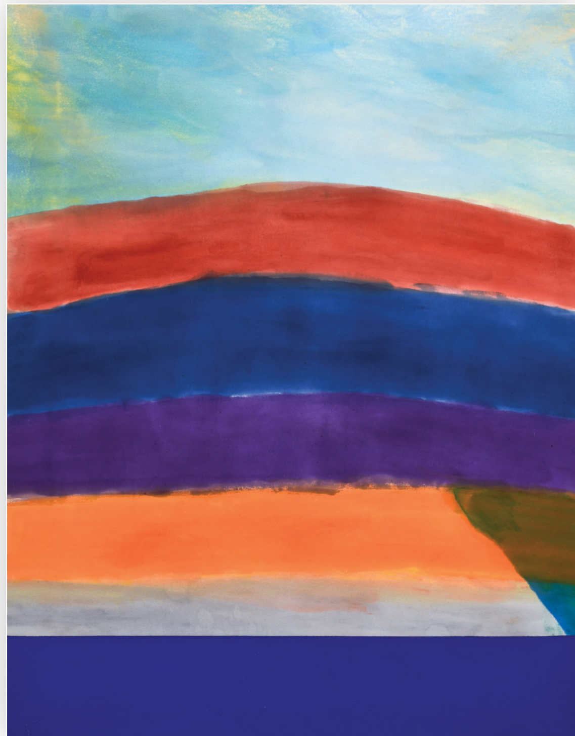
To the North acrylic on canvas 70 x 54 in. FG© 140982