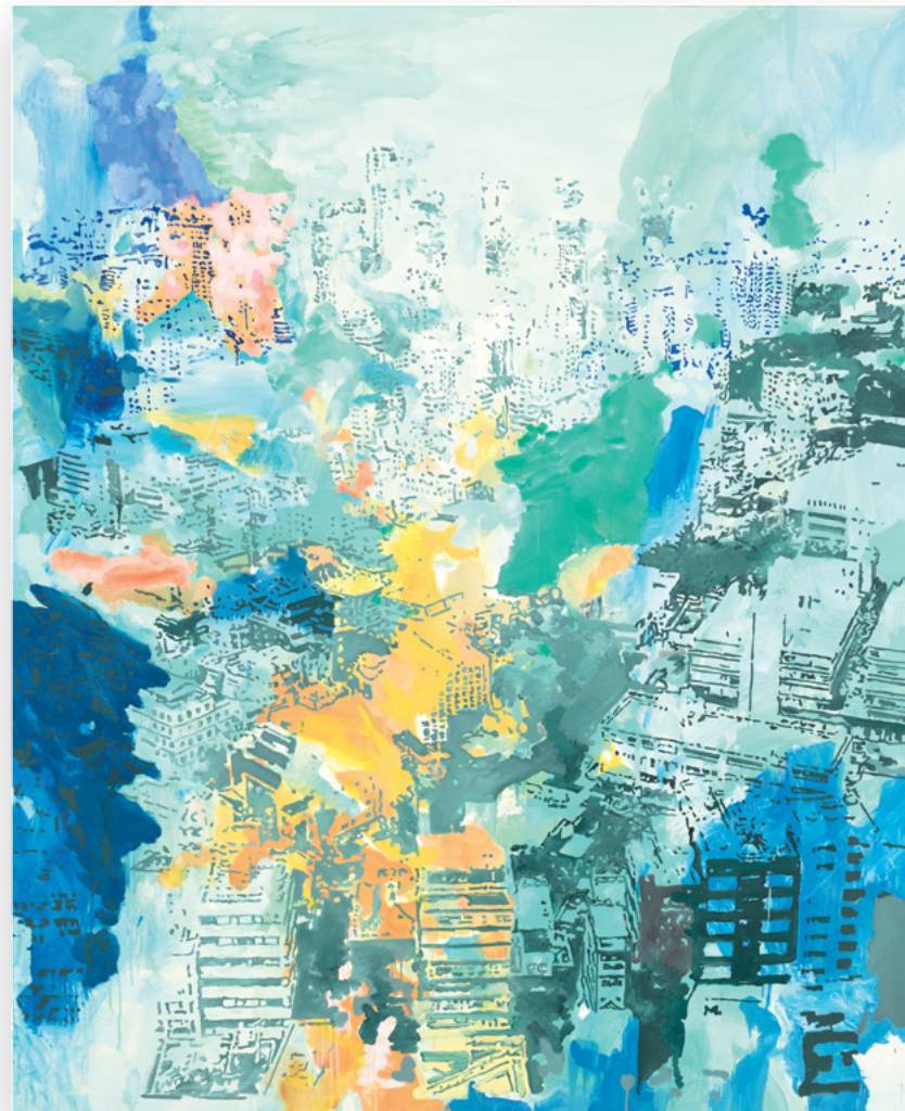
Vertical City | oil on canvas | 84 x 66 in. | FG© 140486