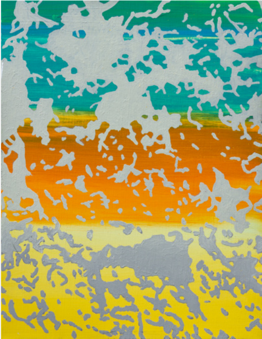
Green, Orange, Yellow | oil on linen | 18 x 14 in. | FG© 140513

“Noah Landfield’s compositions are defined by the tension that arises between colorful, discreet shapes, and the abbreviated marks and notations culled from digital photography that create the aerial views of Japanese cities glimpsed obscurely through abstracted clouds. These landscape-inspired works are not fully abstract; they encourage a representational interpretation of the narrative that plays out between the shapes, the colors, and the notational marks employed by the artist. The artist’s intention to base the themes in his compositions on the universal forces of creation, and destruction, is communicated obliquely by the discreet abstract shapes that define the surfaces of the paintings via their warm and cool hues. These forms make for the prevailing impact of the works while the notations play a subordinate role in the format.” – Mary Hrbacek , M Magazine