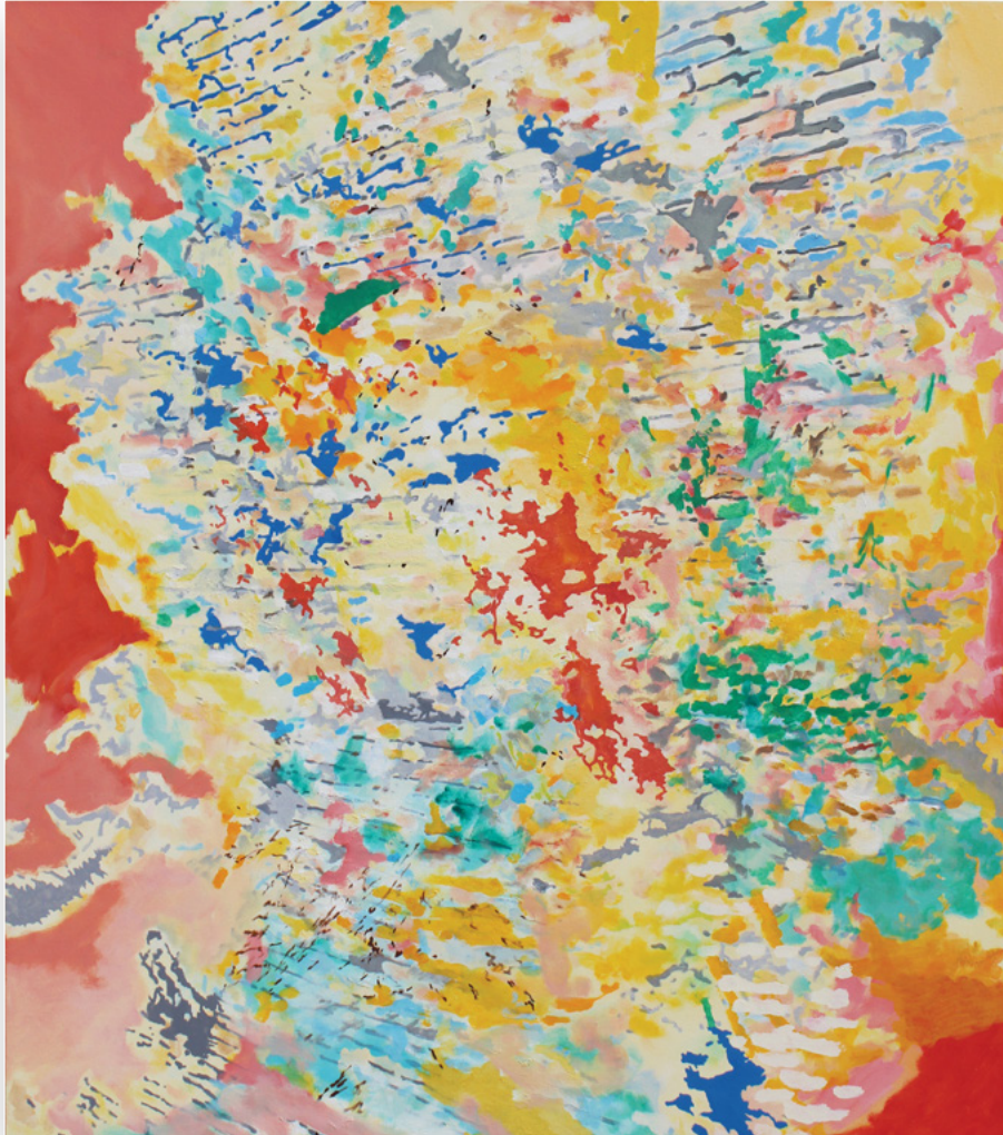
Walls in the Wind | oil on canvas | 68 x 60 in. | FG© 139317