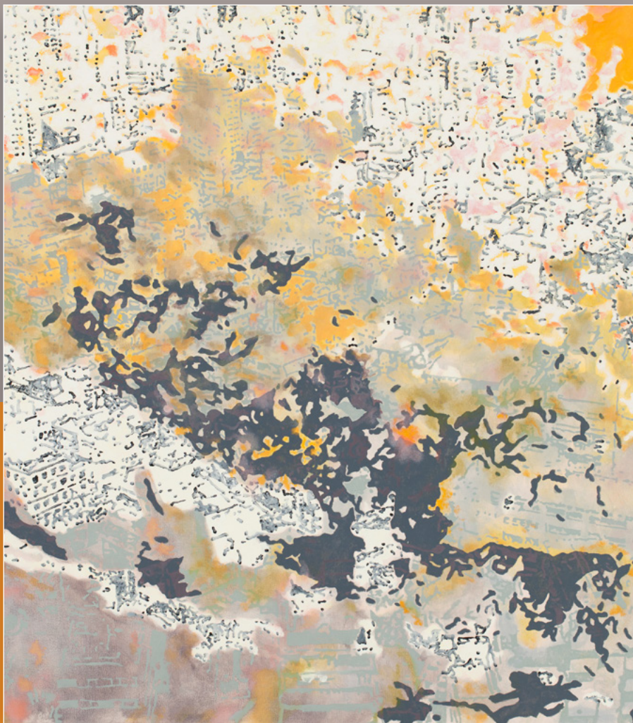
Untitled (Number 11) | oil and acrylic on canvas | 45 x 42 in. | FG© 137802