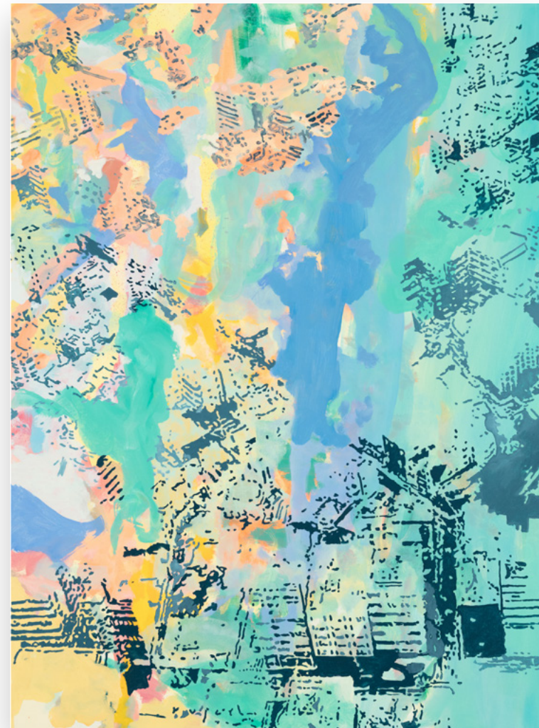
Viewfinder | oil on canvas | 54 x 40 in. | FG© 140494