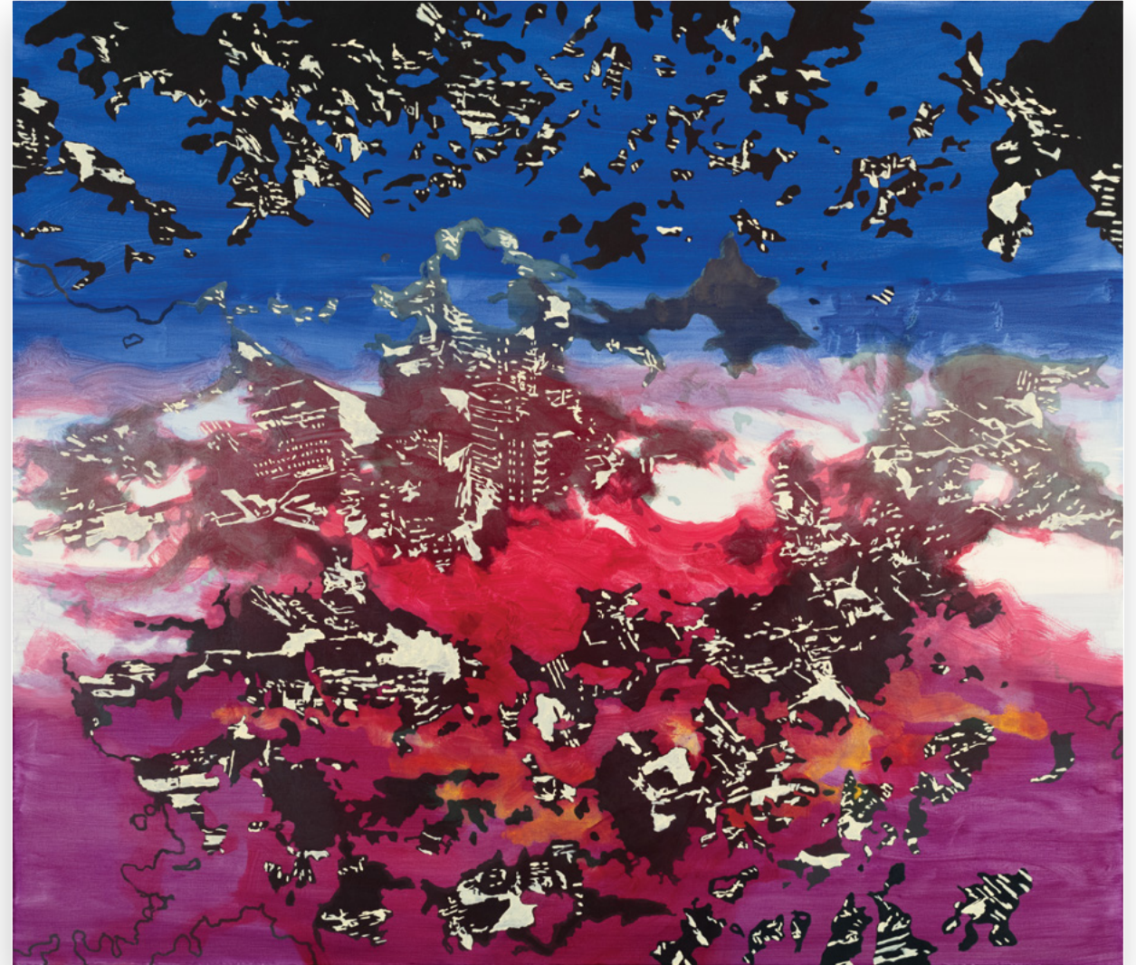
Intensity oil on canvas 52 x 60 in. FG© 140502