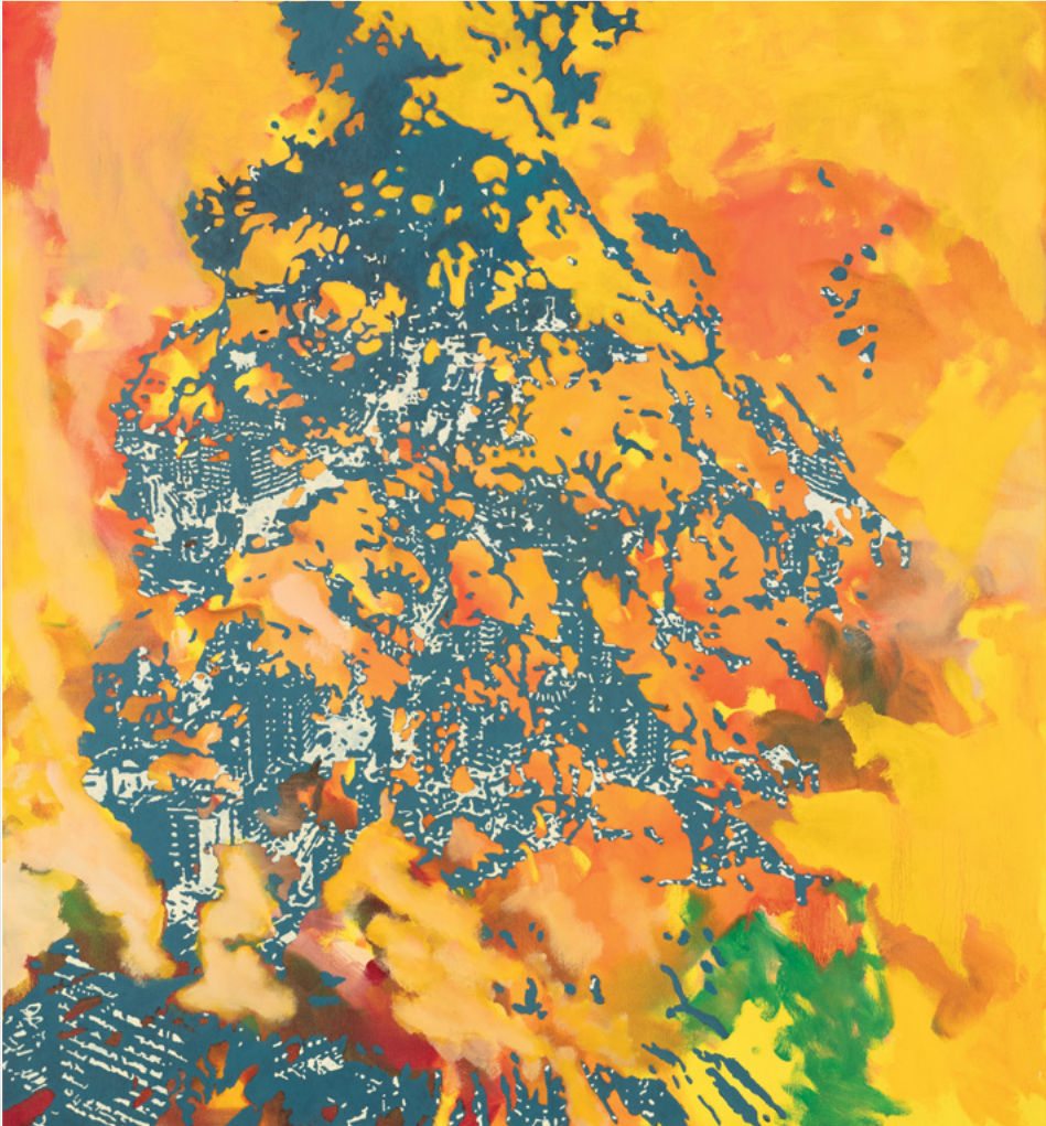
Night Radiance | oil on canvas | 45 x 42 in. | FG© 140504