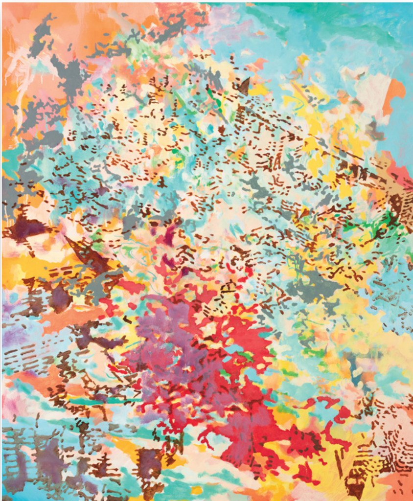
Searching | oil on canvas | 45 x 37 in. | FG© 140507