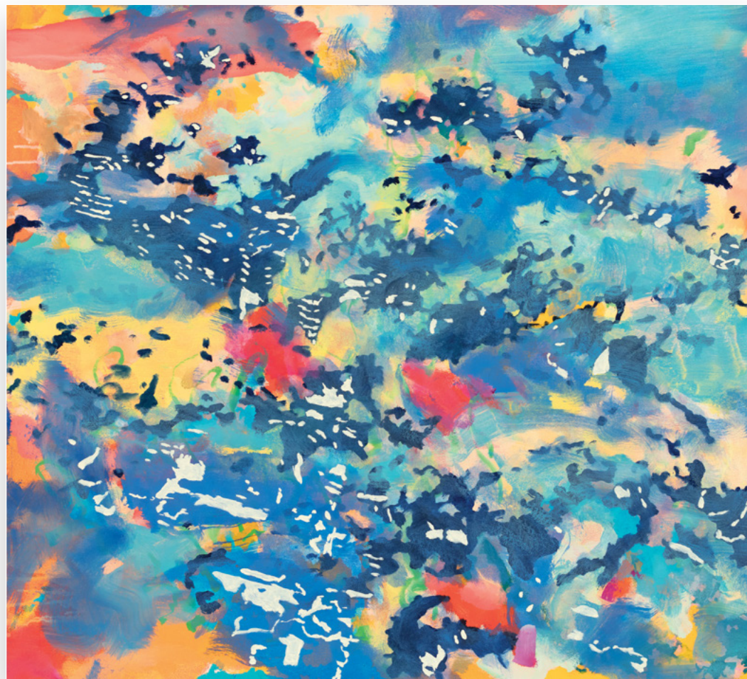
Blue Radiance | oil on canvas | 27 x 30 in. | FG© 140509