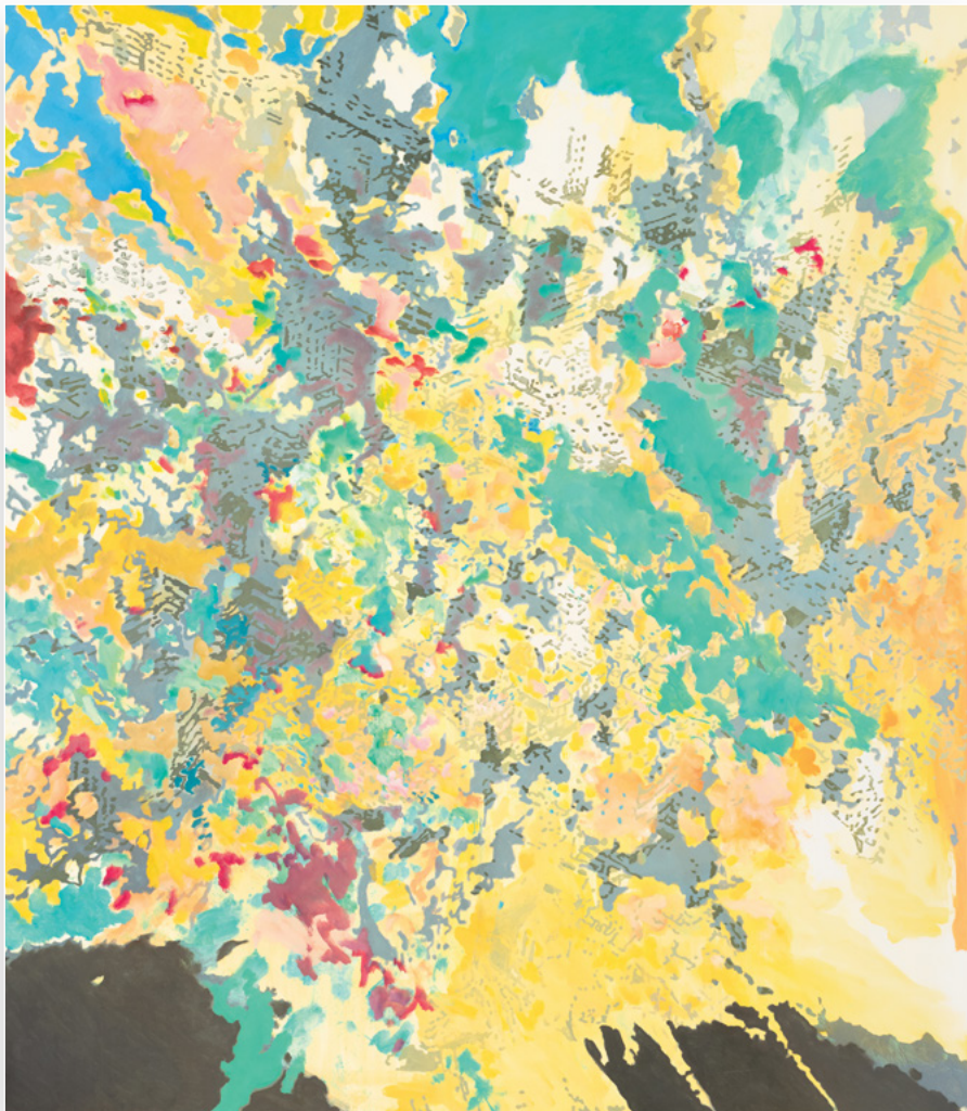
Second Opening | oil on canvas | 78 x 68 in. | FG© 140491