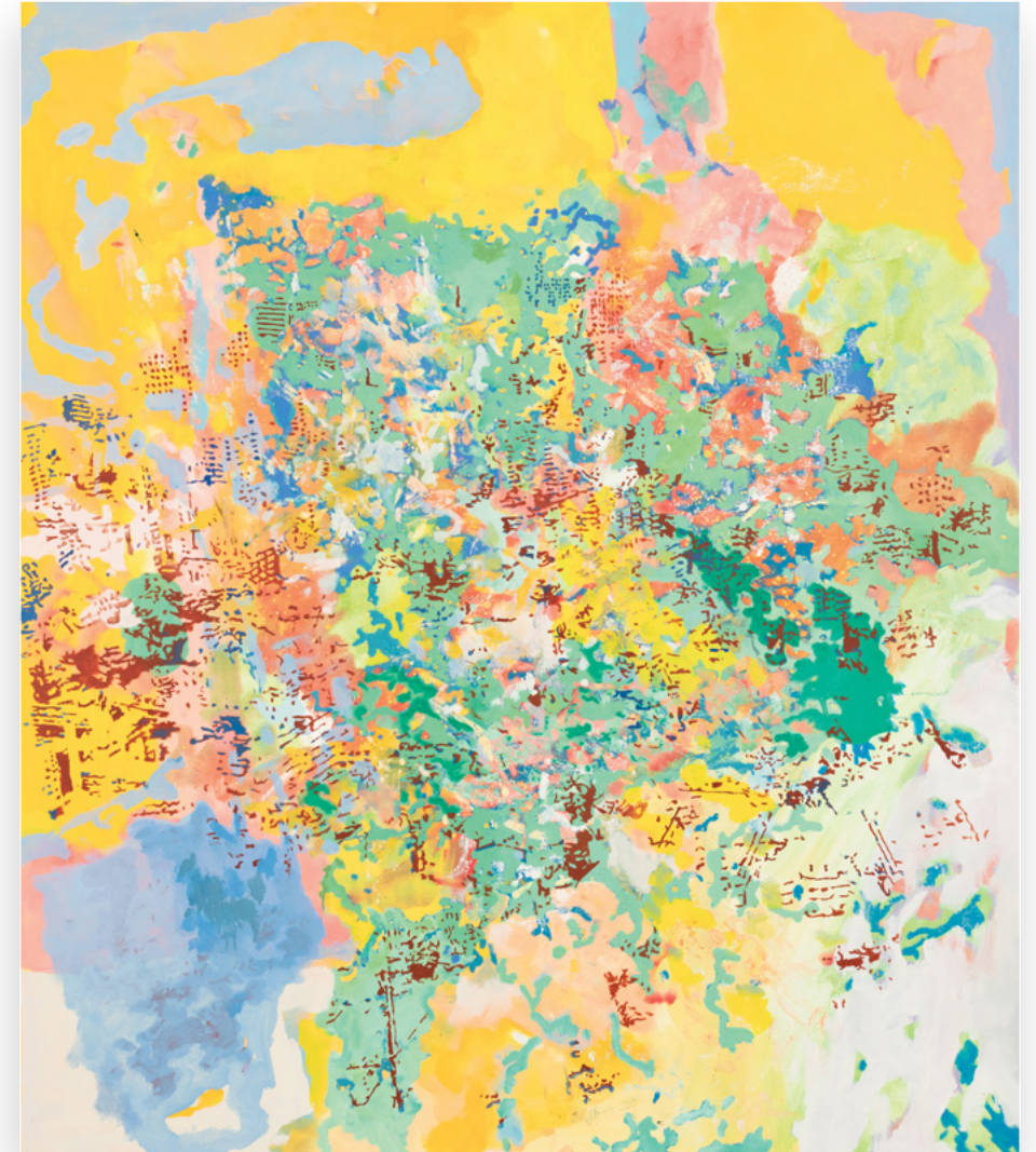
Winding Path (for Bonnard) | oil on canvas | 60 x 52 in. | FG© 140497

Findlay Galleries is honored to present Noah Landfield's recent works in the exhibition Ephemeral Cities at our Palm Beach location.