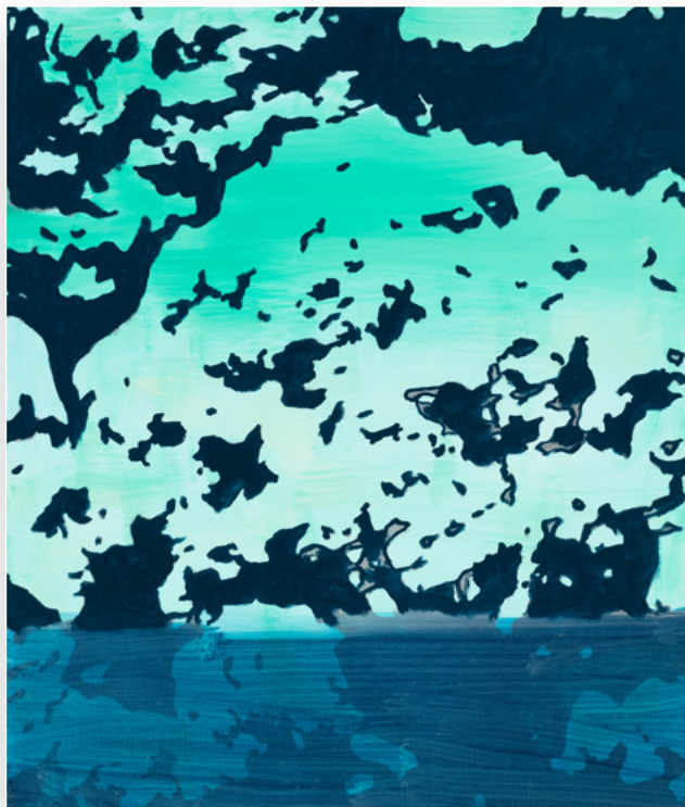
Suspension | oil on linen | 20 1/4 x 17 1/8 in. | FG© 140514