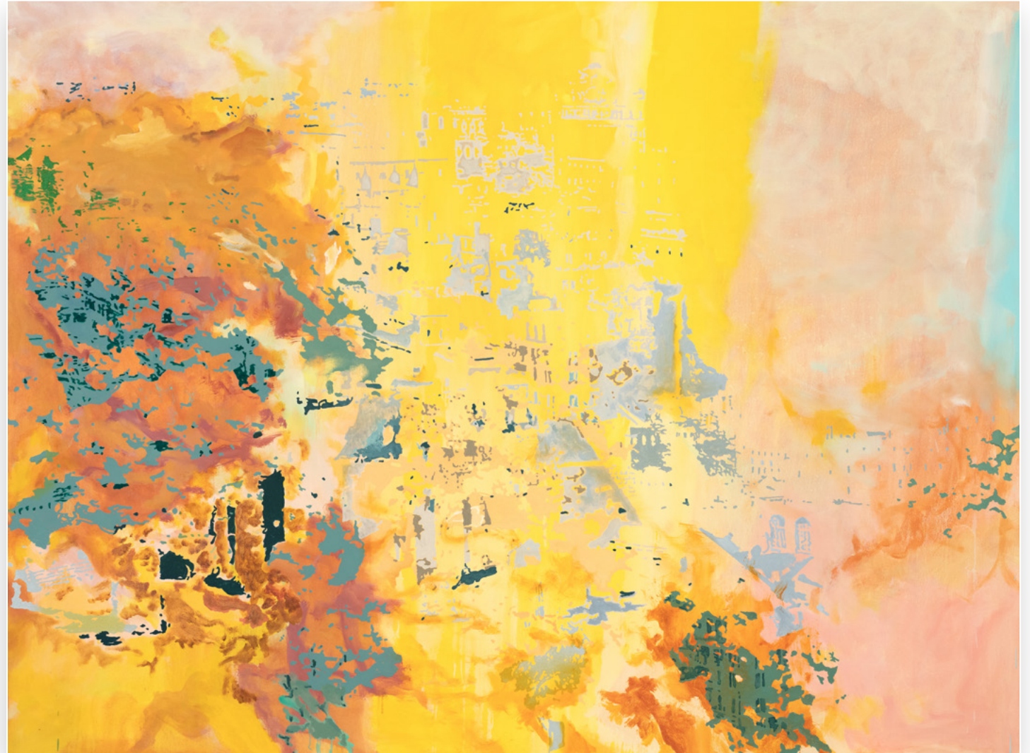
Excavated Light oil on canvas 67 x 90 in. FG© 140485