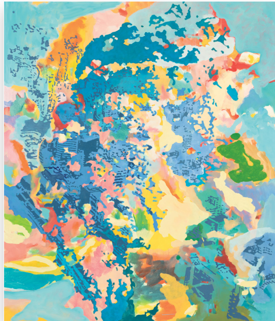
City and the Sea | oil on canvas | 60 x 52 in. | FG© 140498