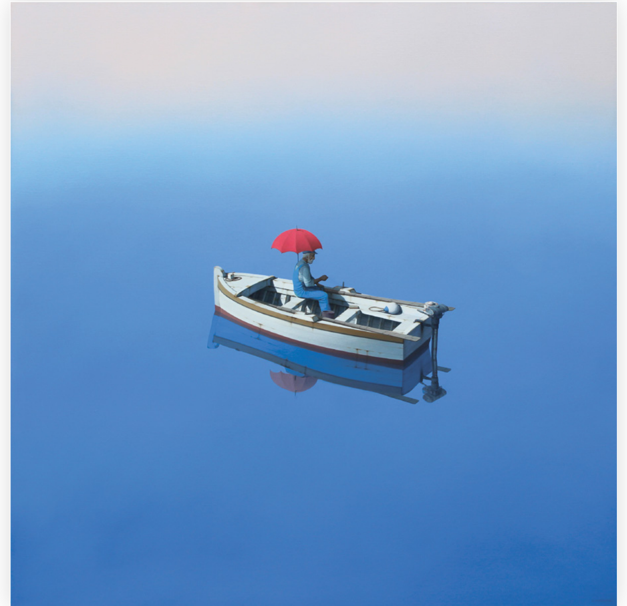
Simple Pleasures | oil on canvas | 43 1/4 x 43 1/4 in. | FG© 139045

Zvonimir Mihanović's work is collected and exhibited internationally. The Museum of Modern Art, Zagreb, and other European museums avidly collect his work, as do collectors from Europe, Latin America and the United States. He has had numerous one-man exhibitions at Findlay Galleries in Chicago, Palm Beach, New York and Beverly Hills.