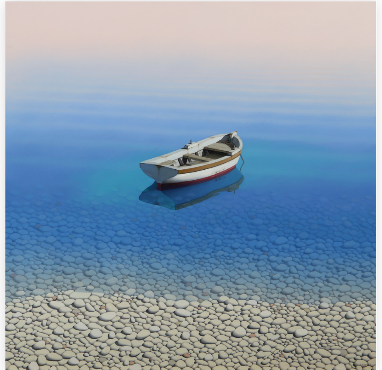
Morning Breeze oil on canvas 39 3/8 x 39 3/8 in. FG© 140447