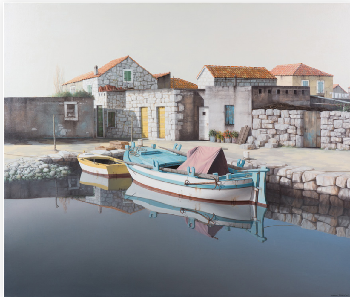
My Grandfather's Village | oil on canvas | 32 1/2 x 38 1/2 in. | FG© 134794