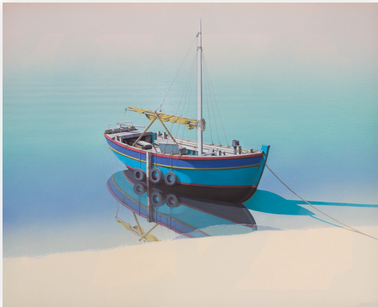
Low tide | oil on canvas | 32 x 39 1/2 in. | FG© 139711