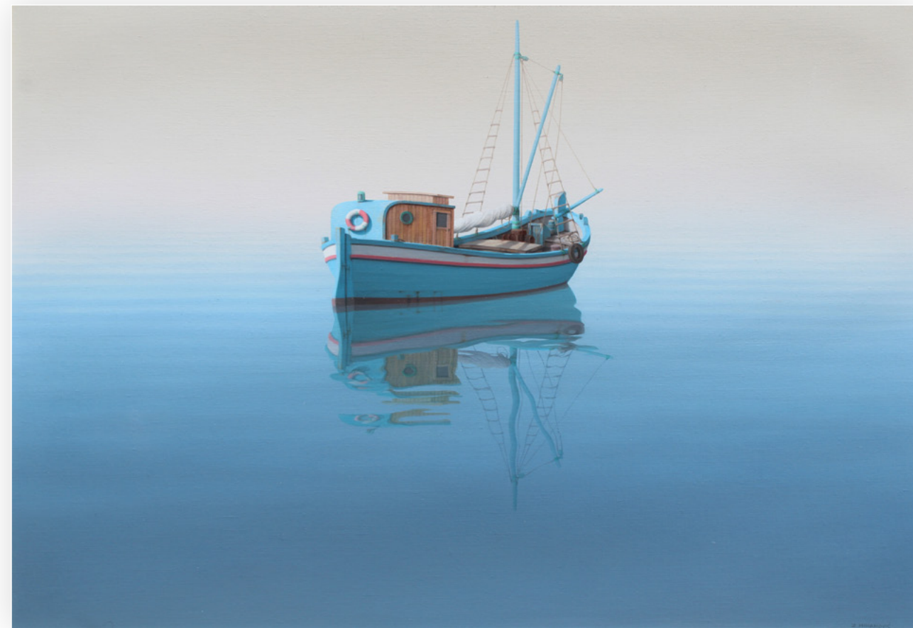
Old Wine Carrier | oil on canvas | 22 1/2 x 31 1/2 in. | FG© 139698