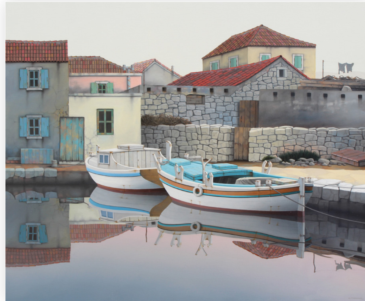
Childhood Memories, old neighborhood | oil on canvas | 31 7/8 x 39 1/2 in. | FG© 139621