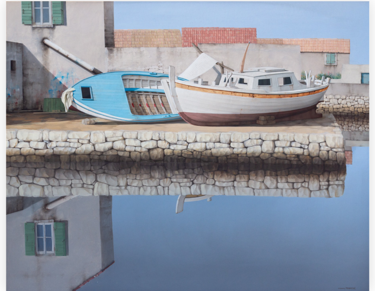
The Repair Dock (cover image) | oil on canvas | 39 3/8 x 31 7/8 in.