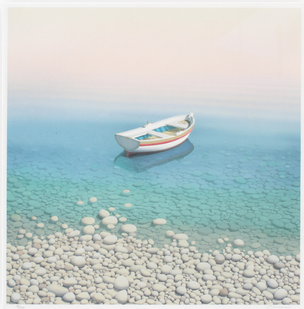
Morning Symphony | lithograph on paper | 34 x 34 1/2 in. | FG© 116827