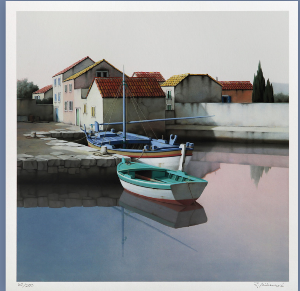
My Grandfather's Village | lithograph on paper | 22 1/2 x 23 1/4 in. | FG© 140453