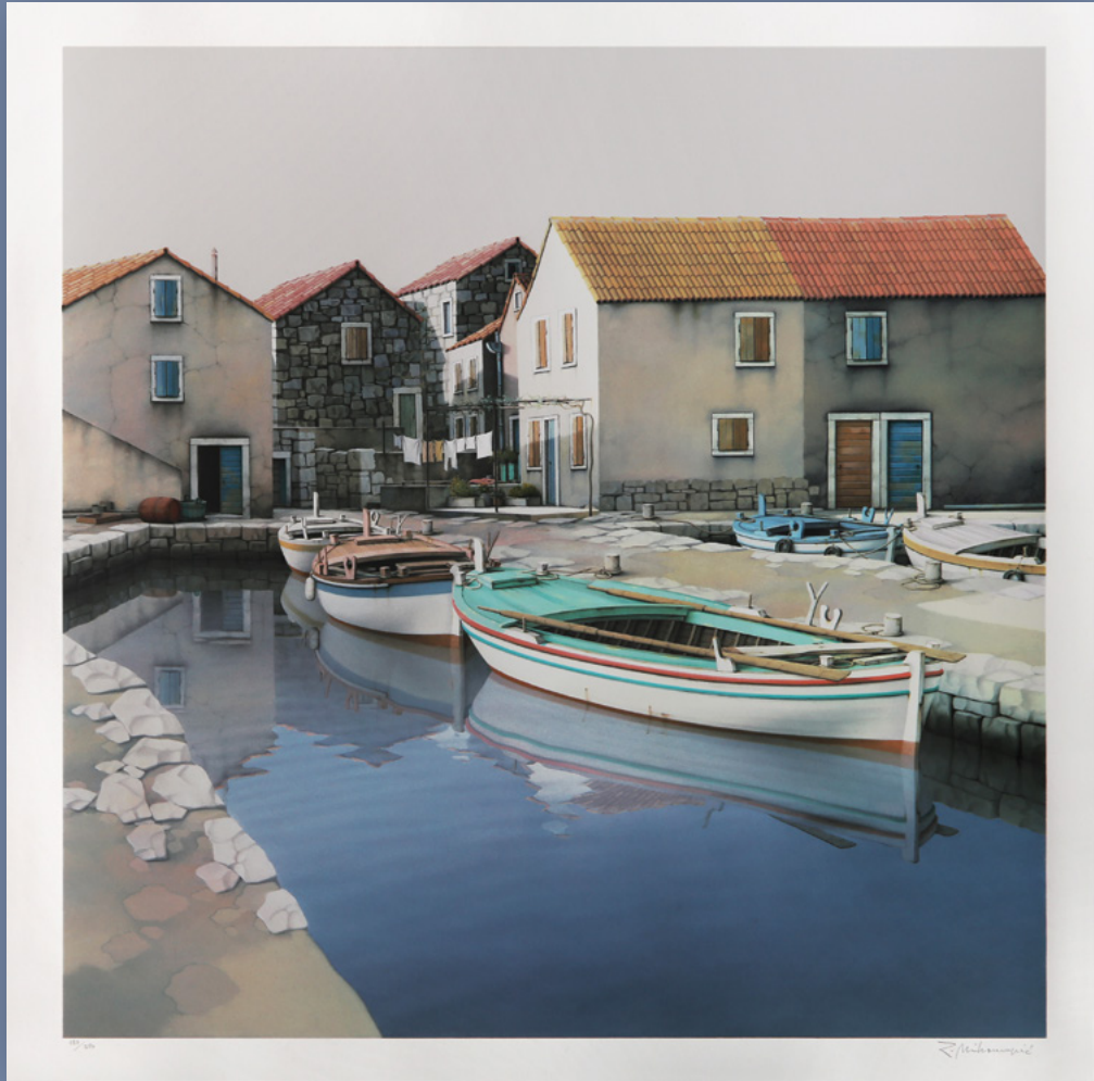
Midsummer Afternoon | lithograph on paper | 31 3/4 x 32 1/2 in. | FG© 140451