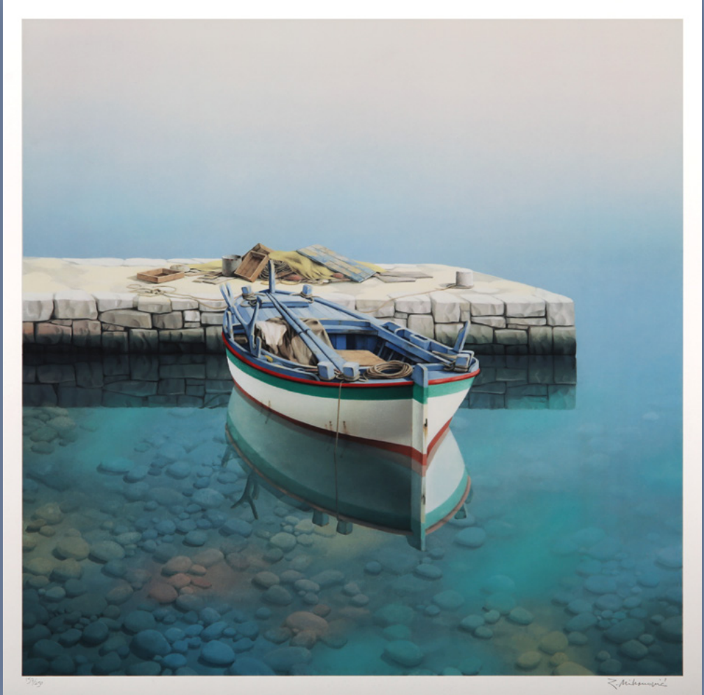
Return at Sunrise | lithograph on paper | 32 1/4 x 32 3/4 in. | FG© 140452