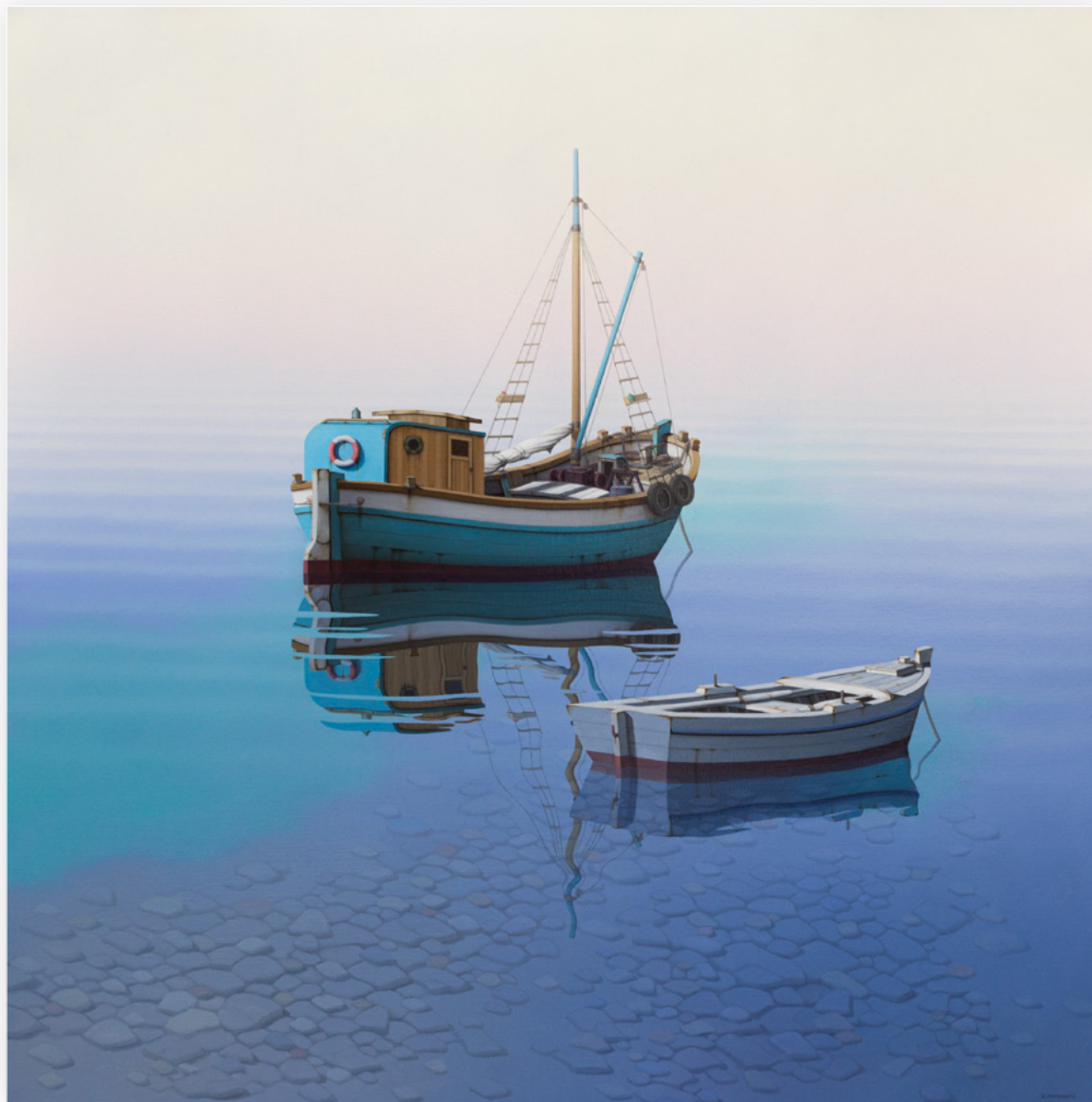
Daybreak | oil on canvas | 41 1/2 x 41 1/2 in. | FG© 139970