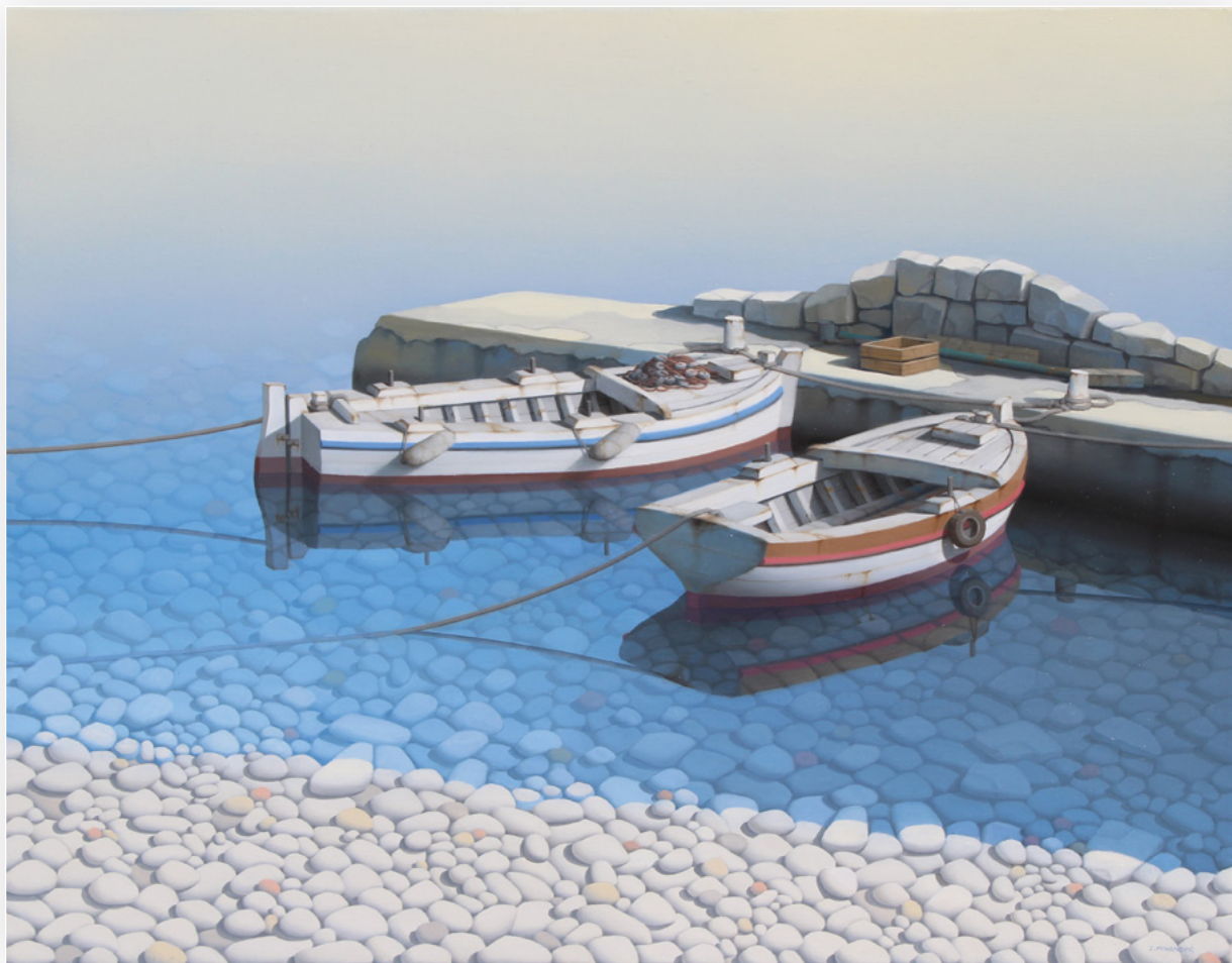
Tied to the Shallows, Rocky pier | oil on canvas | 19 7/8 x 25 1/2 in. | FG© 139620