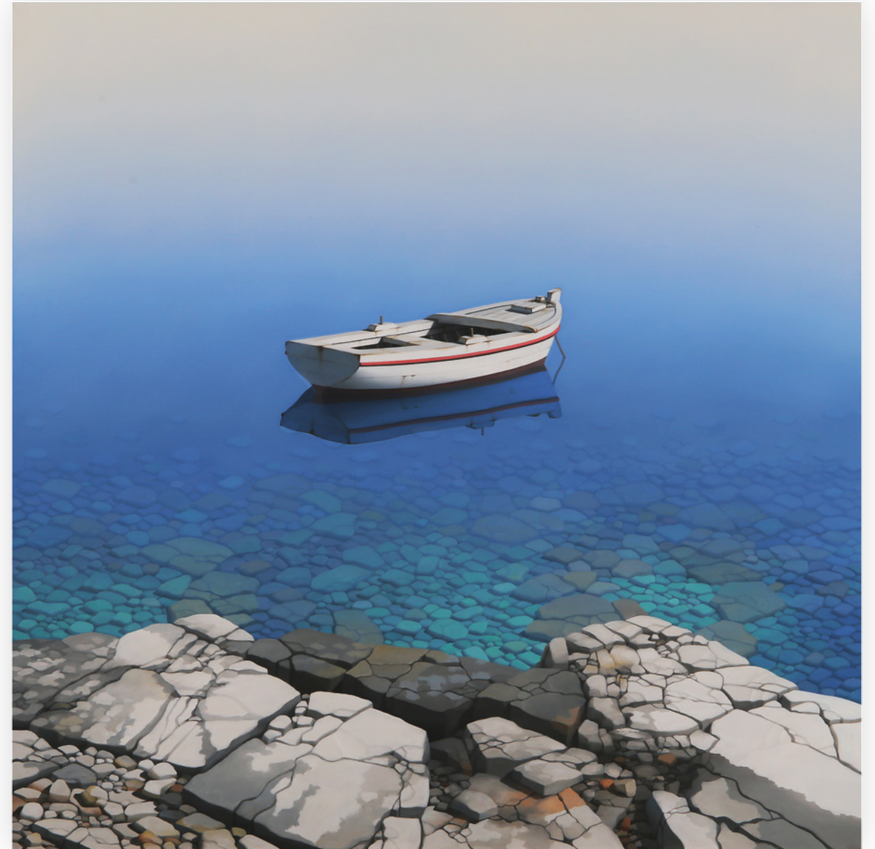
Morning Colors oil on canvas 43 1/4 x 43 1/4 in. FG© 140240