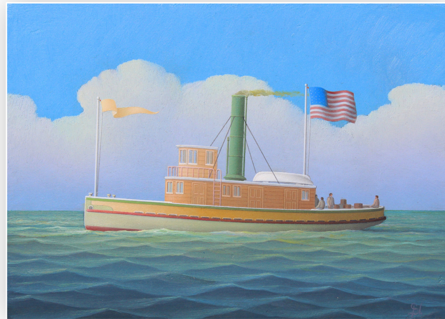
George Nemethy (b.1952) | Wally I | oil on canvas board | 4 1/2 x 6 1/2 inches | FG© 138119