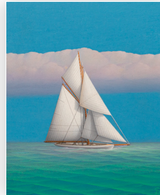
(right) George Nemethy (b.1952) | Ducking the Reef | oil on canvas board | 6 1/8 x 5 1/8 in. | FG© 139827