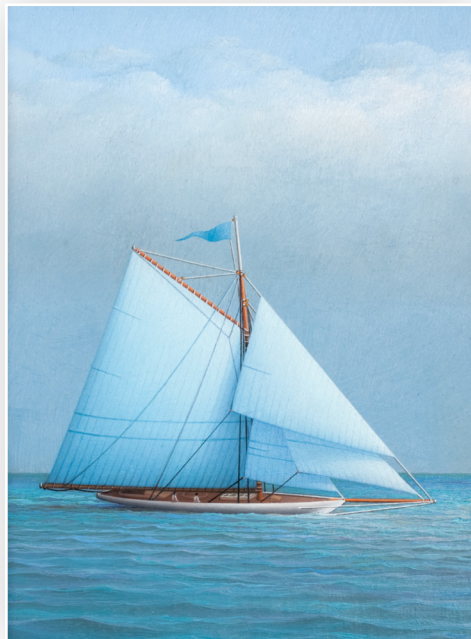
George Nemethy (b.1952) | Rhode Island Sailing oil on canvas board | 4 x 5 in. | FG© 132255

Celebrating over 20 years of exclusive representation by the Findlay Galleries, Nemethy’s paintings continue to delight collectors throughout the world.