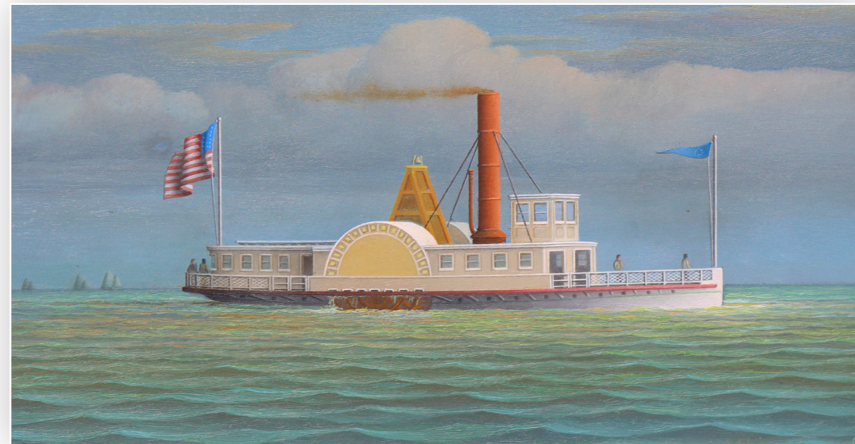
George Nemethy (b.1952) | Hudson River Steamboat John E. Moore | oil on board | 4 1/8 x 7 1/8 in. | FG© 134811