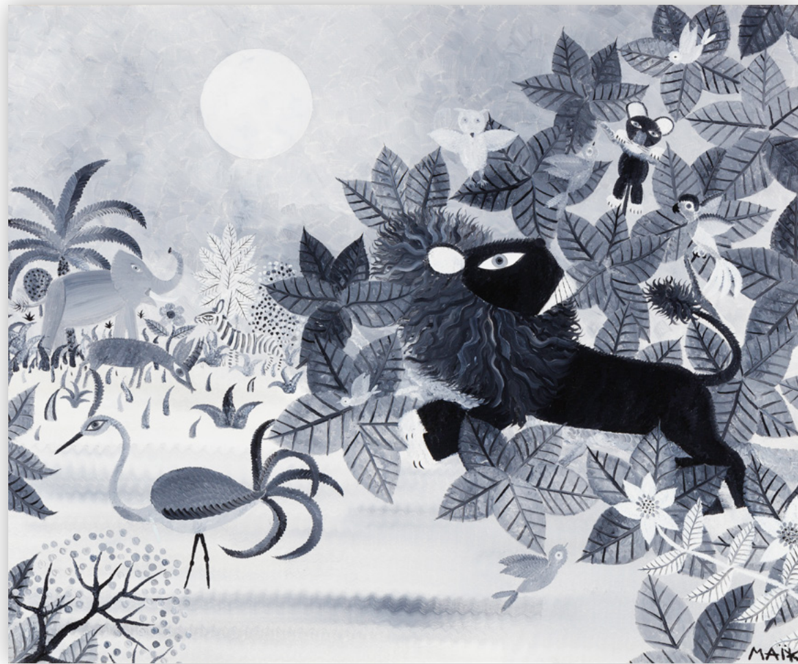
La Lune | oil on canvas | 18 1/8 x 21 5/8 in. | FG© 133740