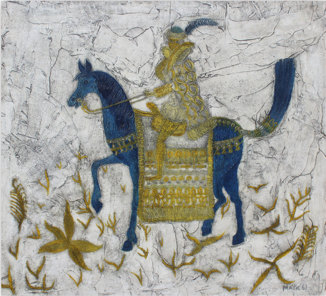
Cavalier Oriental | oil on panel | 16 x 17 3/8 in. | FG© 139692