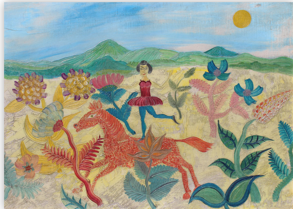
Ballerina | oil on canvas | 13 x 9 7/16 in. | FG© 139797