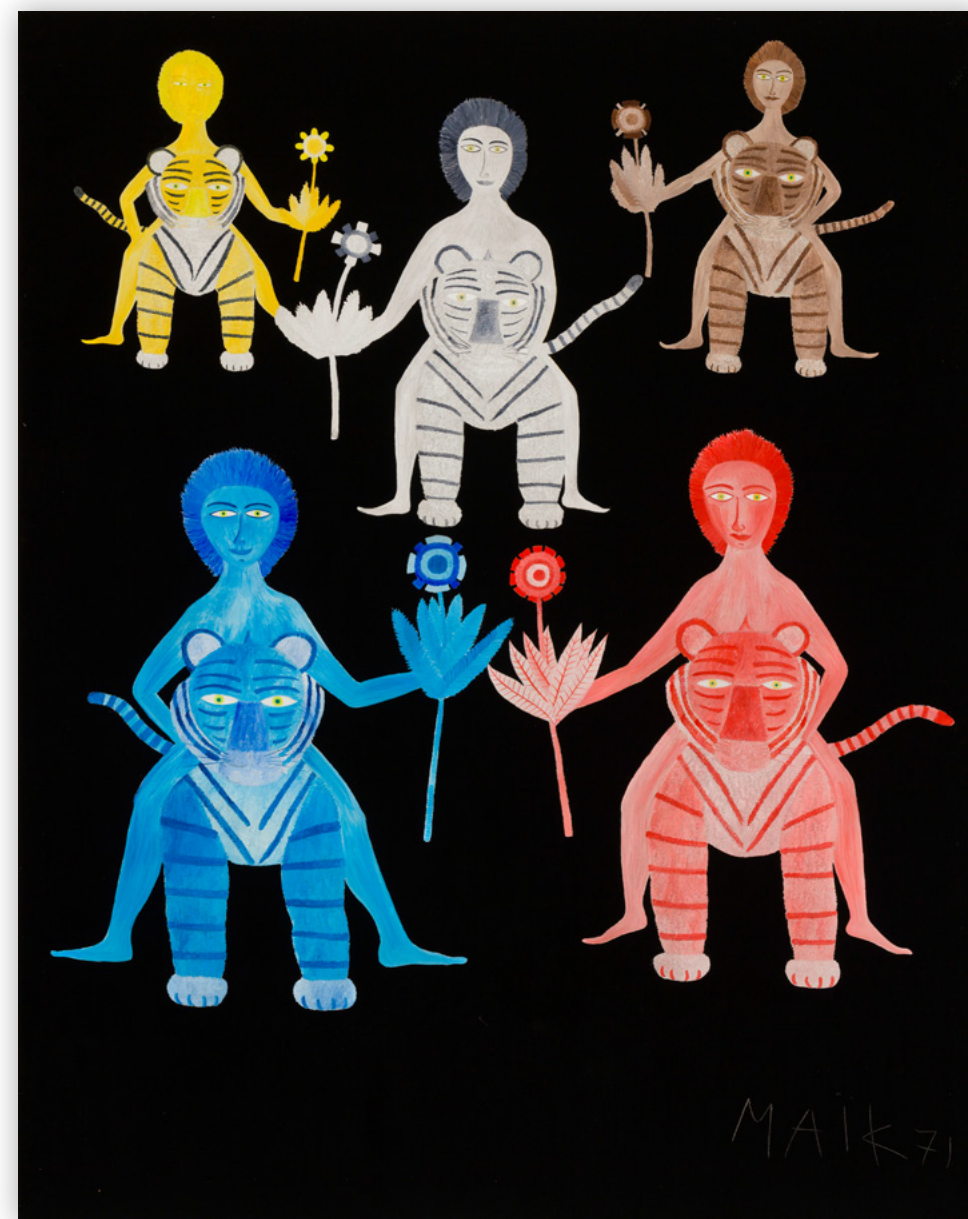
Cavaliers de la Nuit | oil on canvas | 57 1/2 x 44 7/8 in. | FG© 138694