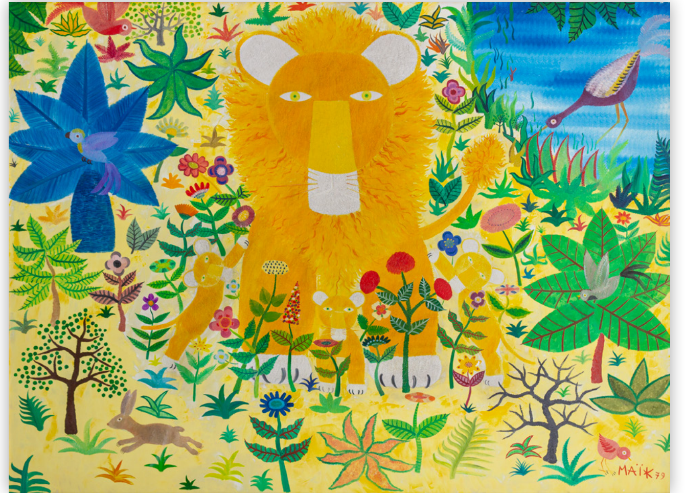
Les trois freres | oil on canvas | 38 3/16 x 51 3/16 | FG© 139883