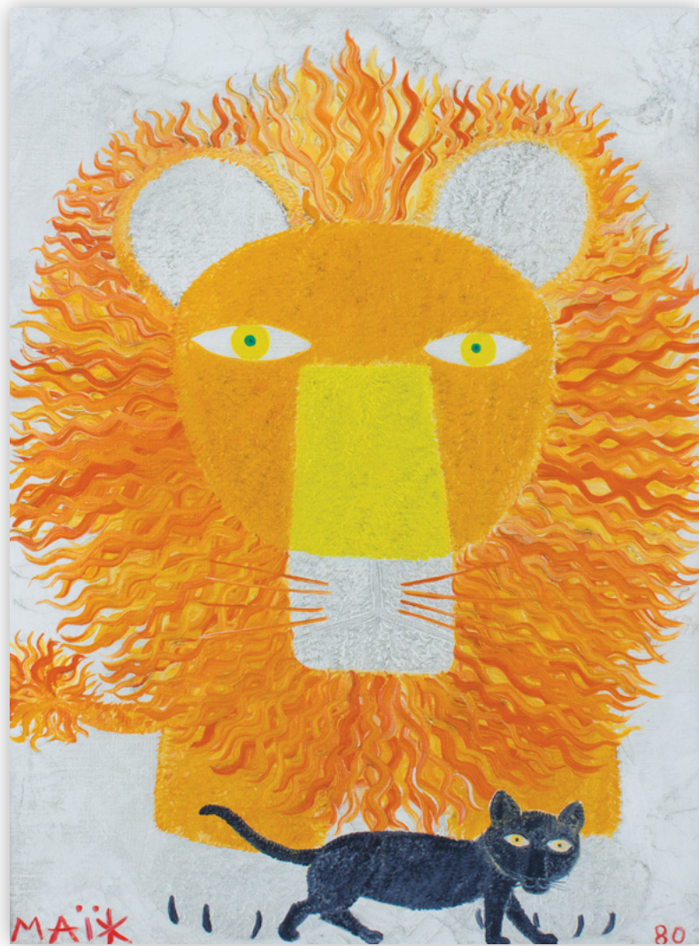
L'ami chat | oil on canvas | 12 15/16 x 9 3/8 in. | FG© 138169