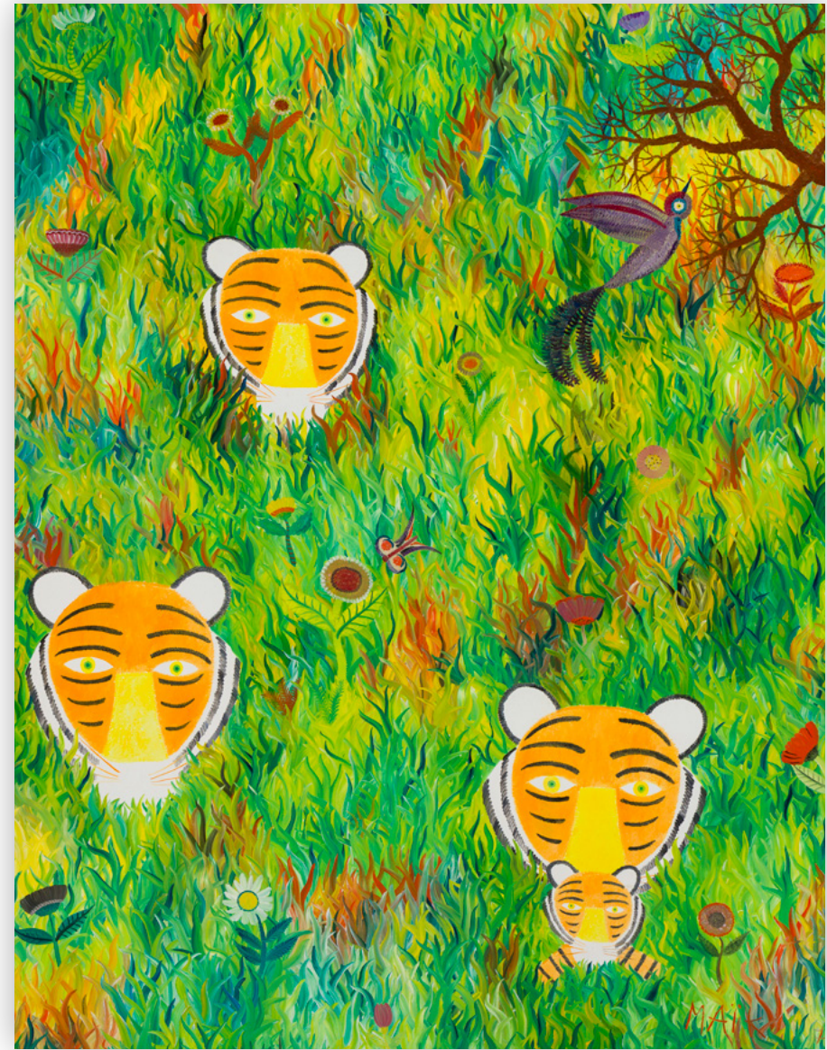
Marche dans les hautes herbes | oil on canvas | 57 1/2 x 44 7/8 in. | FG© 133033