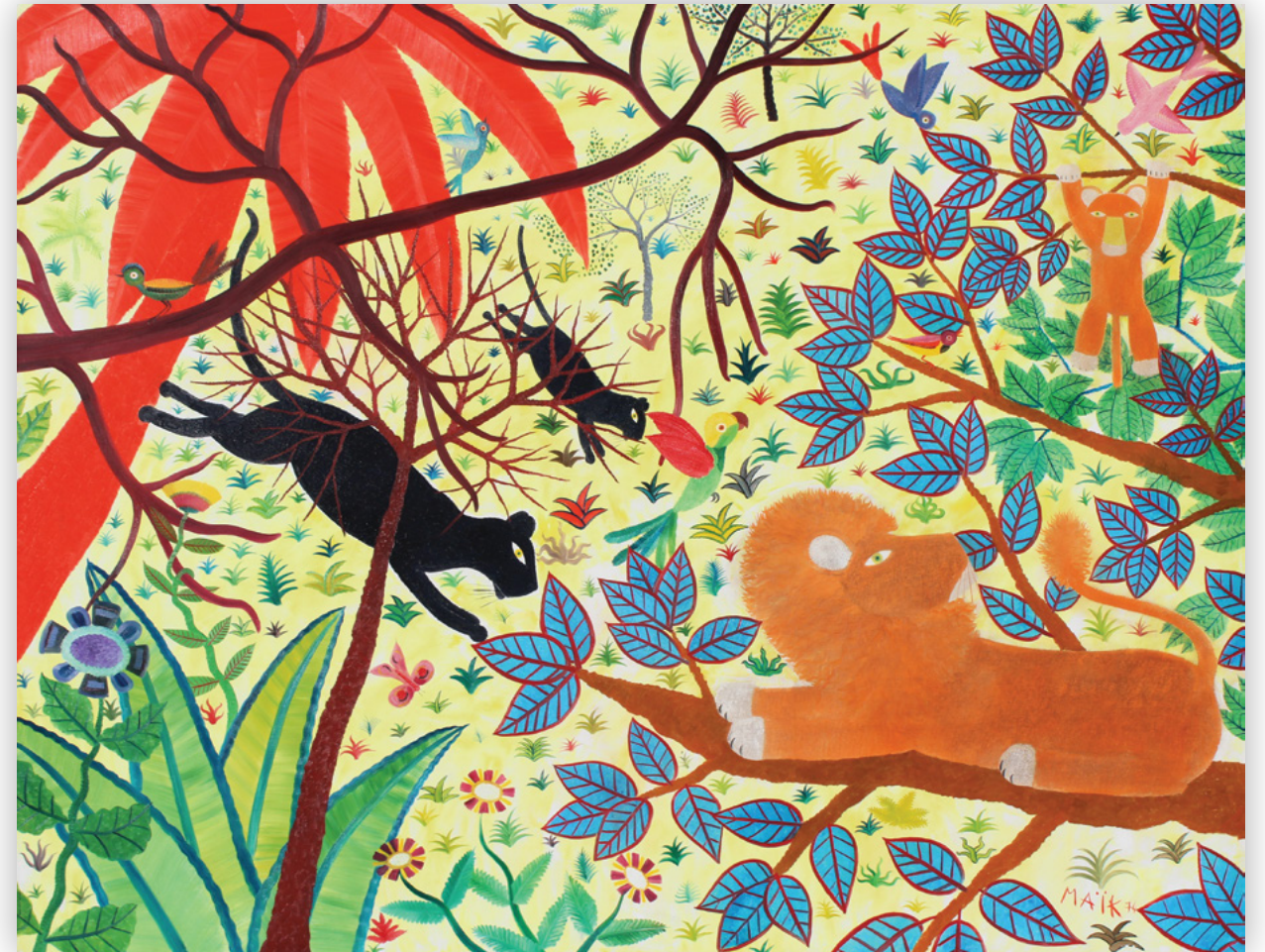
Tu vas tomber | oil on canvas | 57 1/2 x 44 7/8 in. | FG© 139647