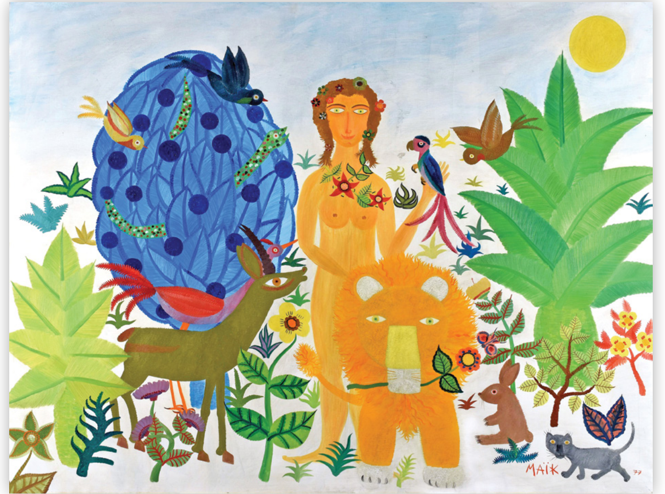
Le Paradis | oil on canvas | 35 1/16 x 45 11/16 in. | FG© 138603