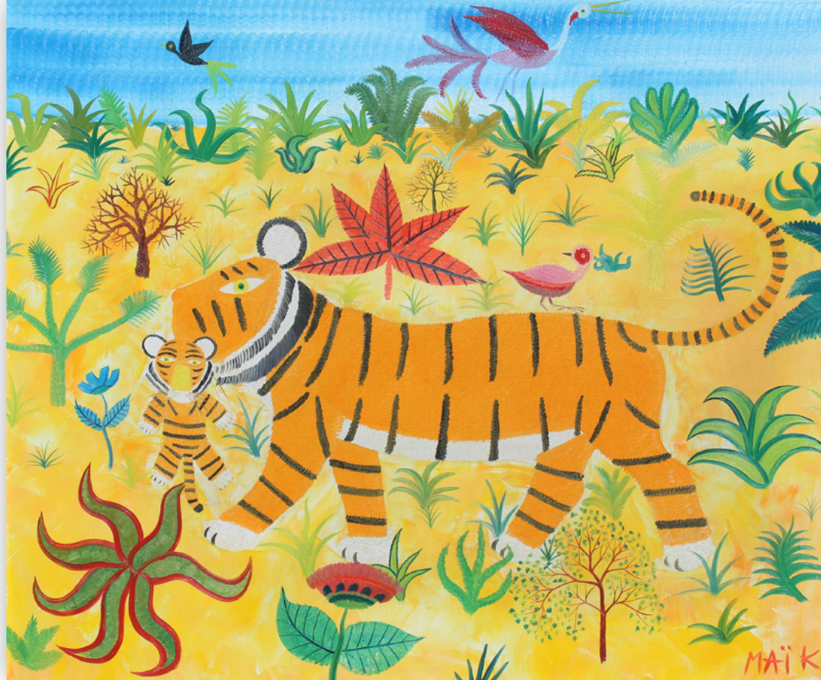
Promenade du tigre avec Papa | oil on canvas | 36 1/4 x 28 3/4 in. | FG© 139731