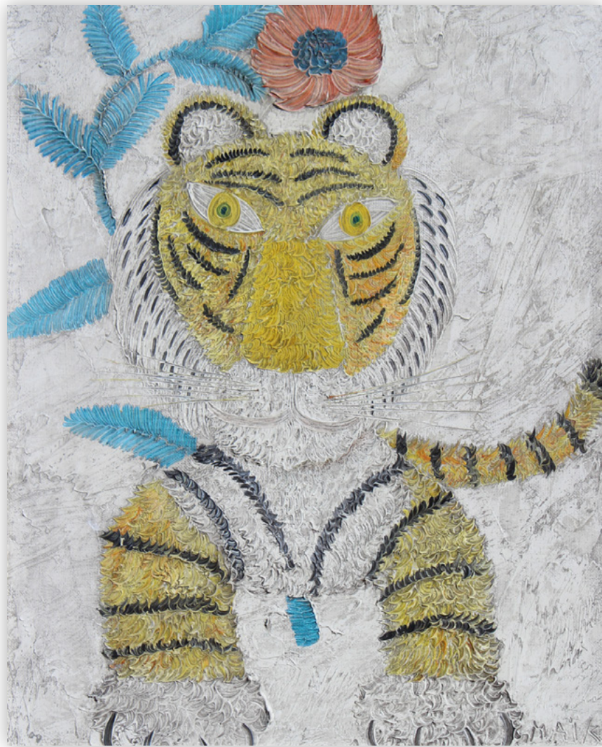
Le tigre | oil on canvas | 10 5/8 x 8 11/16 in. | FG© 139036