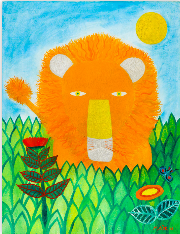
Le Roi | oil on canvas | 36 1/4 x 28 3/4 in. | FG© 138630