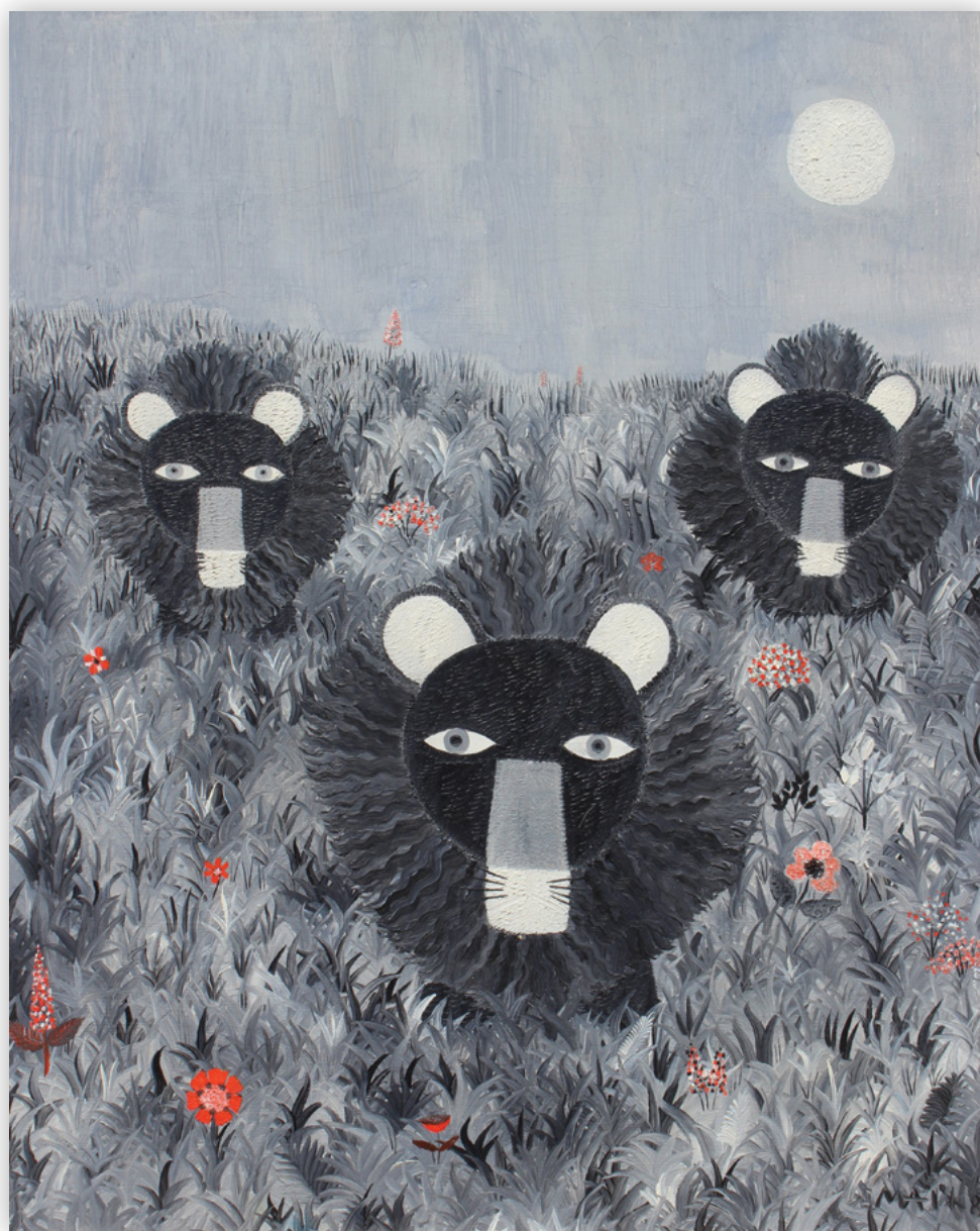
Nuit | oil on canvas | 16 1/4 x 13 in. | FG© 139761