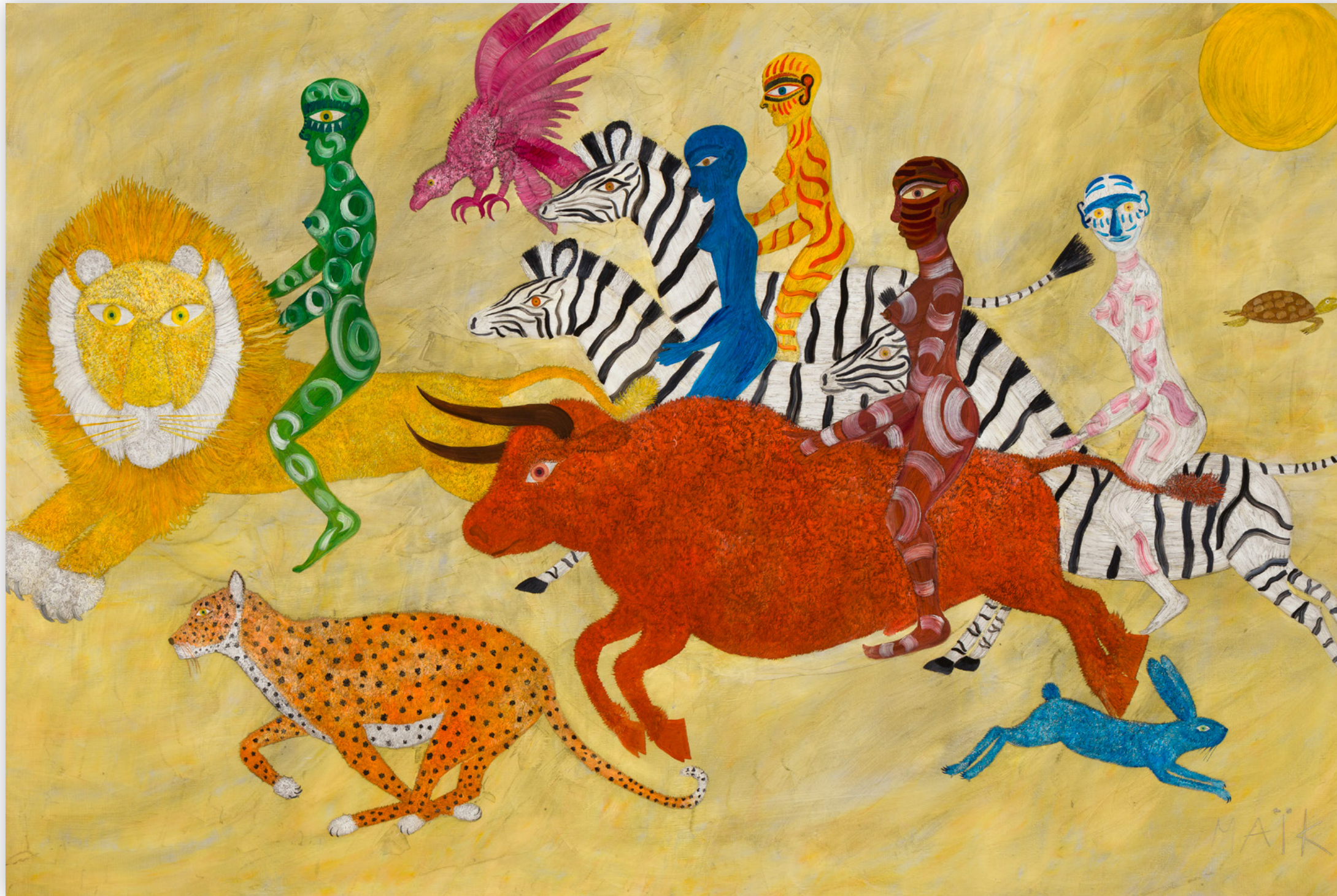
Let's Go oil on canvas 76 3/4 x 51 3/16 in. FG© 138539