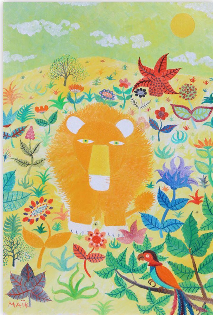
L'Afrique | oil on canvas | 19 1/16 x 13 in. | FG© 139495