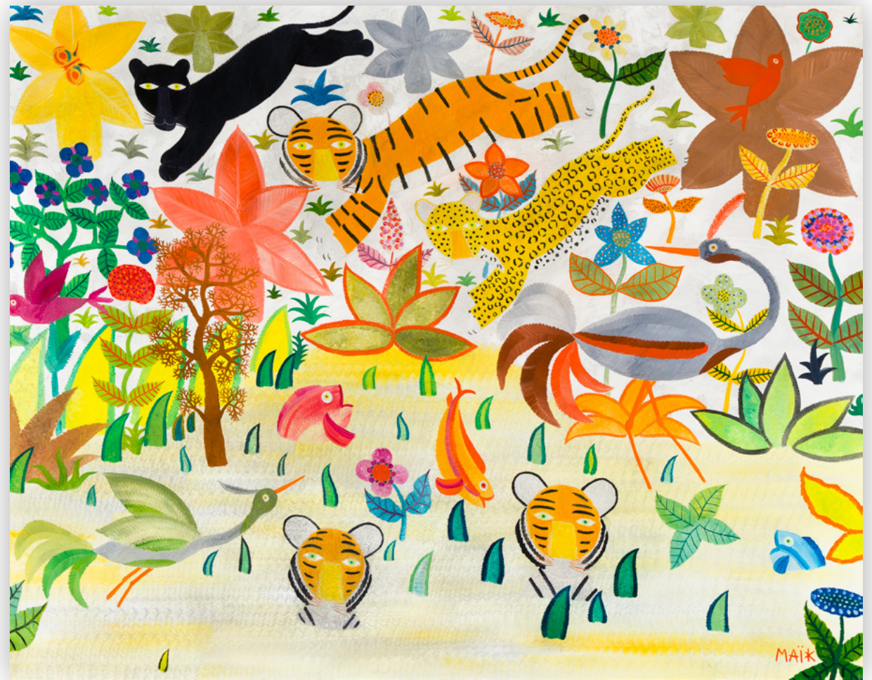
Les Plongeurs | oil on canvas | 28 3/4 x 36 1/4 in. | FG© 139649