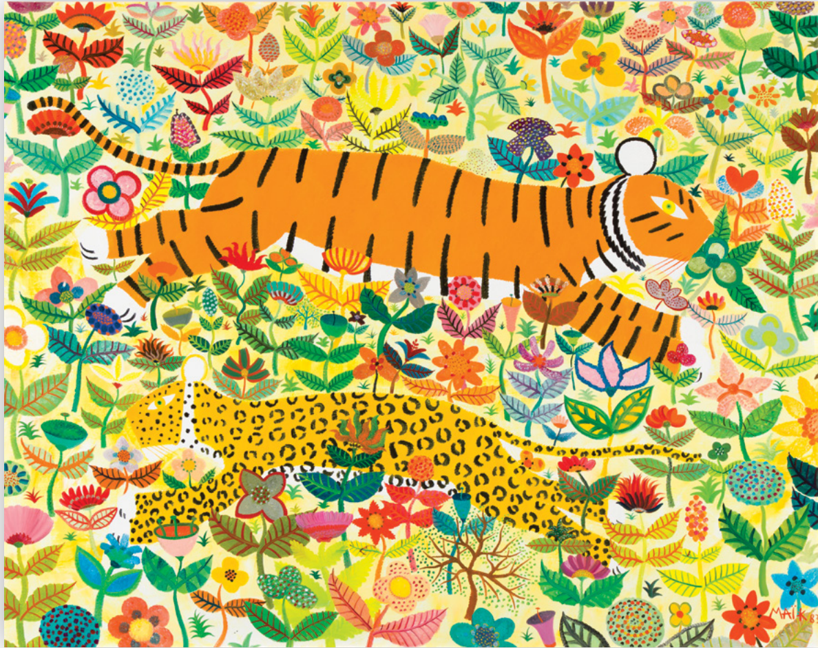
Le Paradis | oil on canvas | 36 1/4 x 28 3/4 in. | FG© 139691