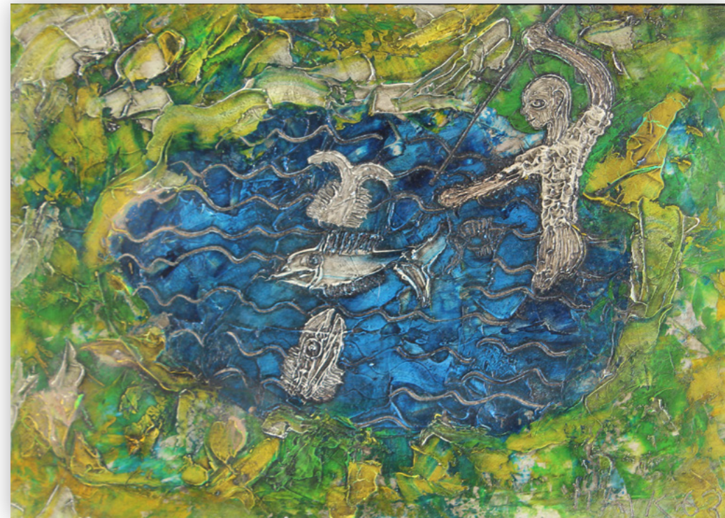
La chasse aux poissons | oil on panel | 8 3/8 x 12 1/4 in. | FG© 139549