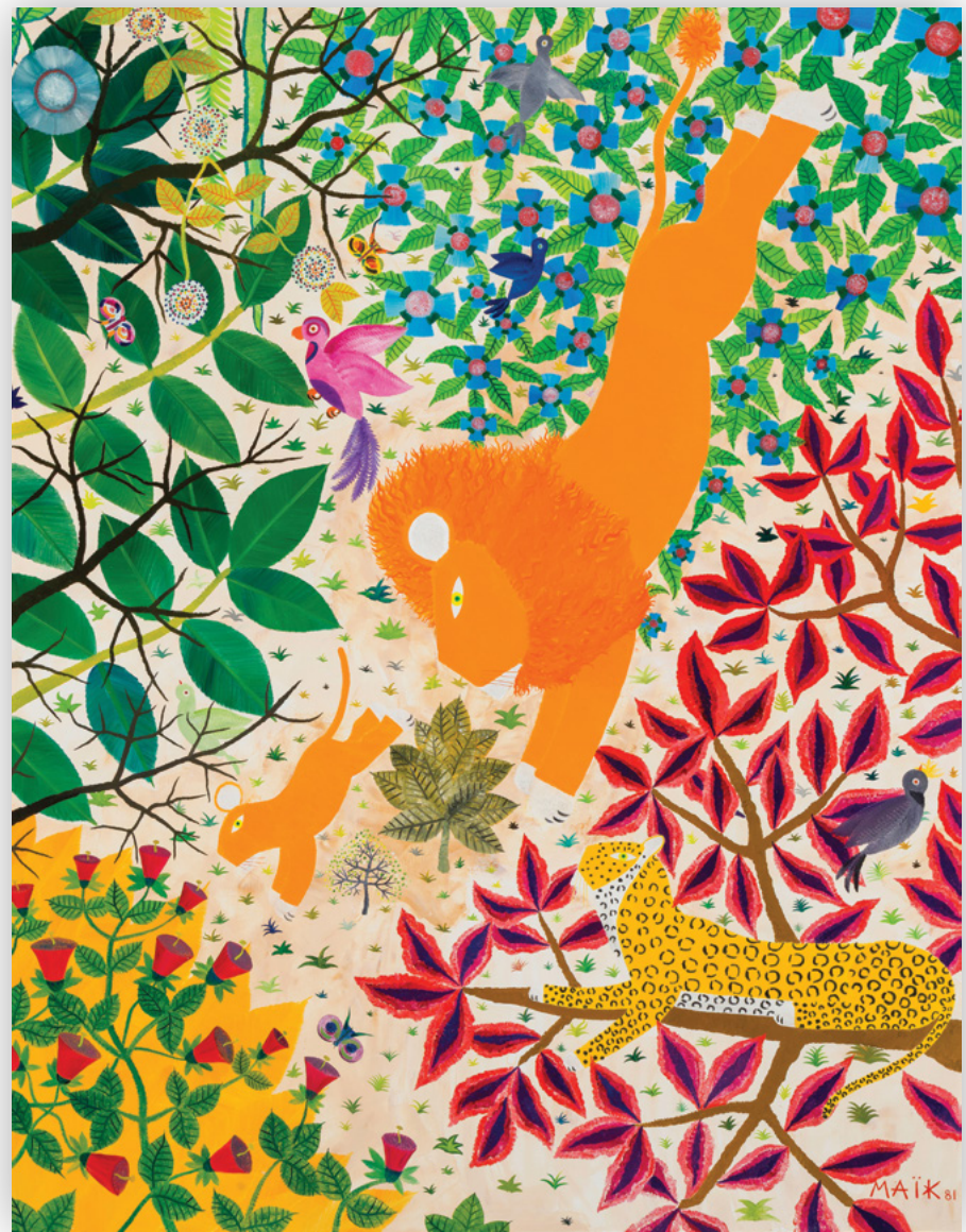
Comme Papa | oil on canvas | 57 1/2 x 44 7/8 in. | FG© 139648