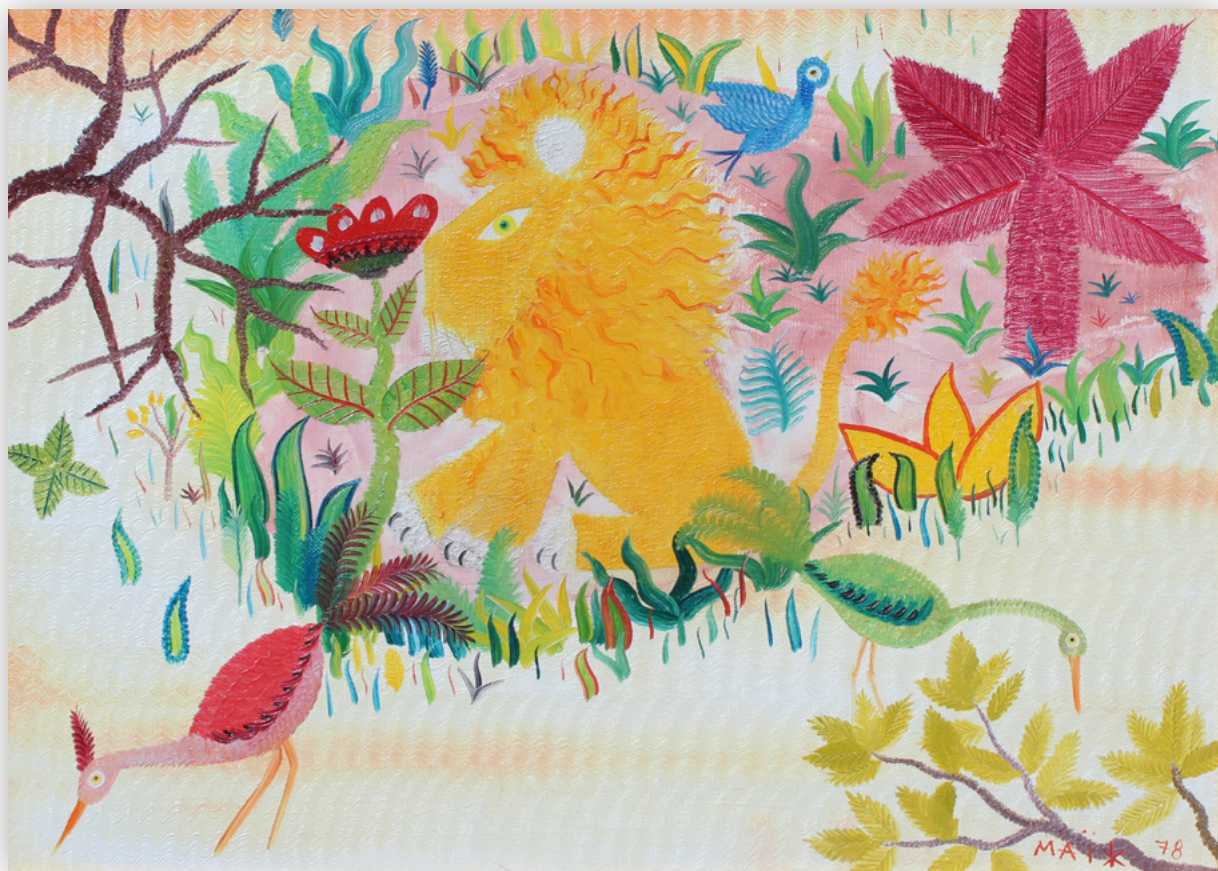
Une Belle Journee | oil on canvas | 13 x 9 7/16 in. | FG© 138741