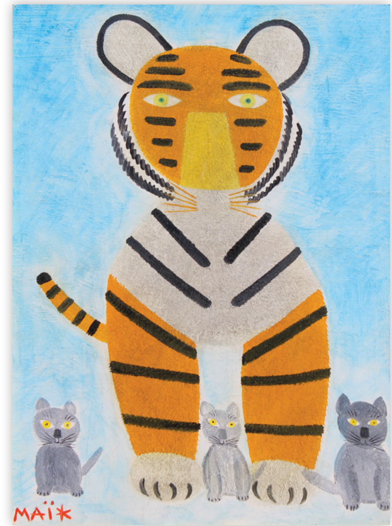
Les trois chats | oil on canvas | 13 x 9 7/16 in. | FG© 138684