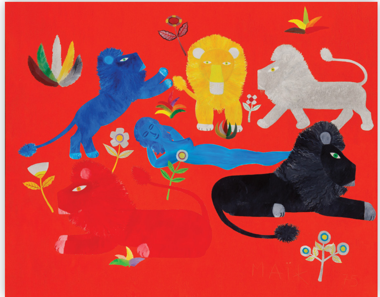
Dormir en Afrique | oil on canvas | 63 3/4 x 51 3/16 in. | FG© 139638