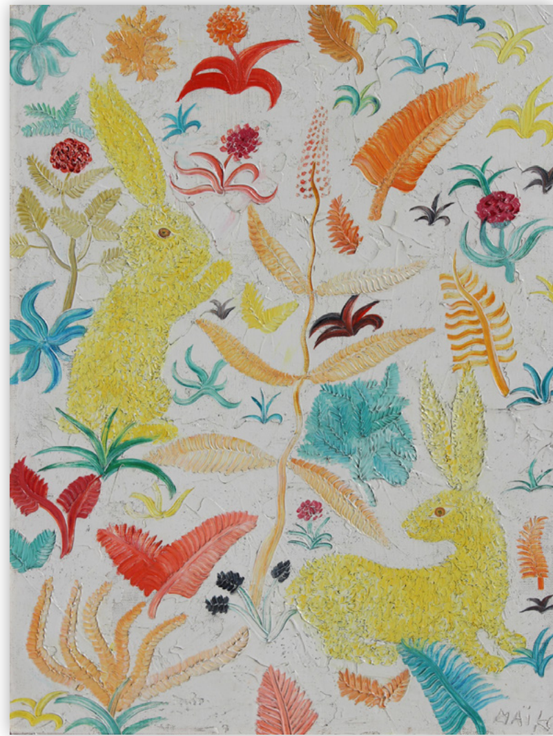
The Tropics | oil on canvas | 13 x 9 7/16 in. | FG© 139605