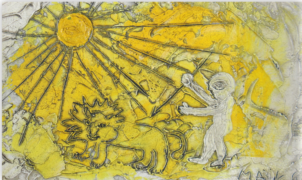
Chasse au lion | oil on panel | 5 1/4 x 9 in. | FG© 139550