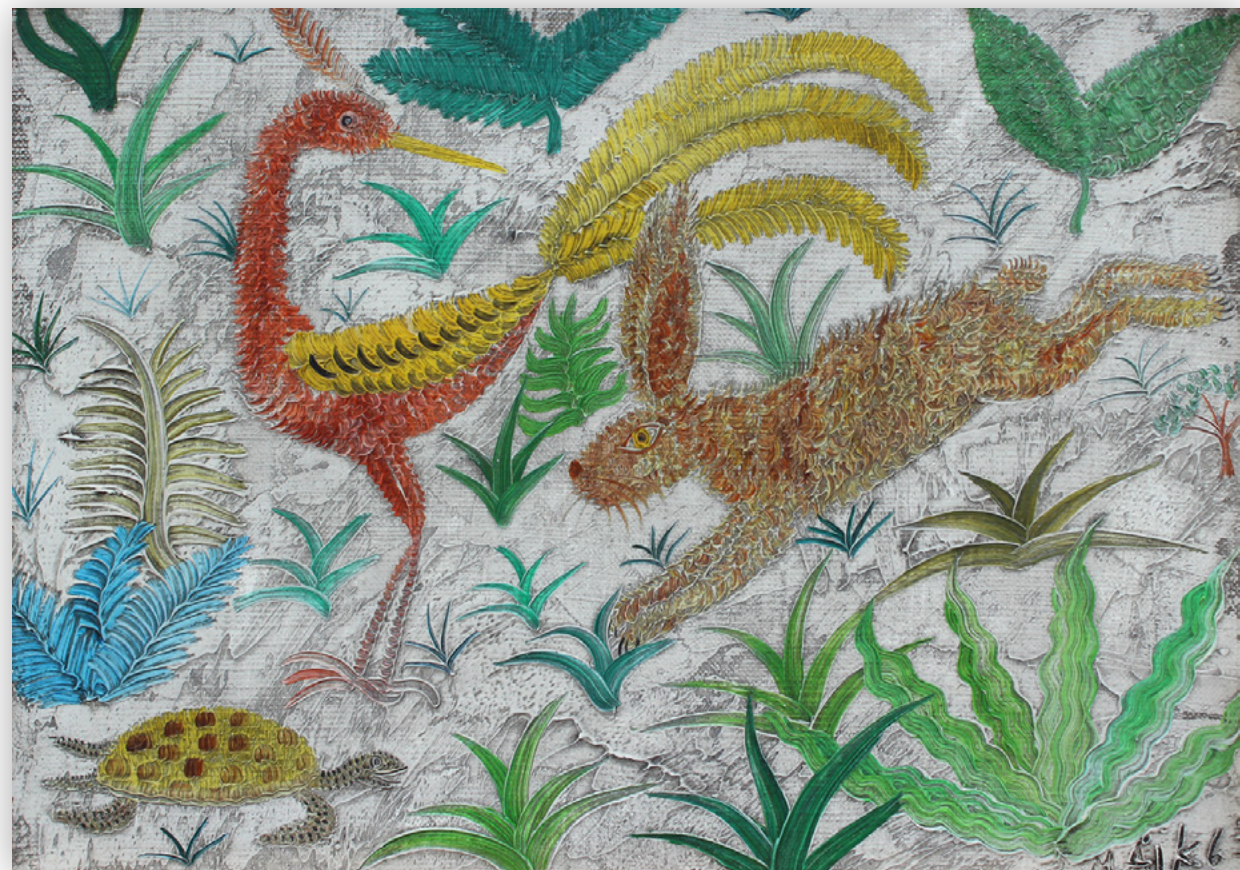
Le lièvre et l'oiseau | oil on canvas | 9 7/16 x 7 1/2 in. | FG© 138781