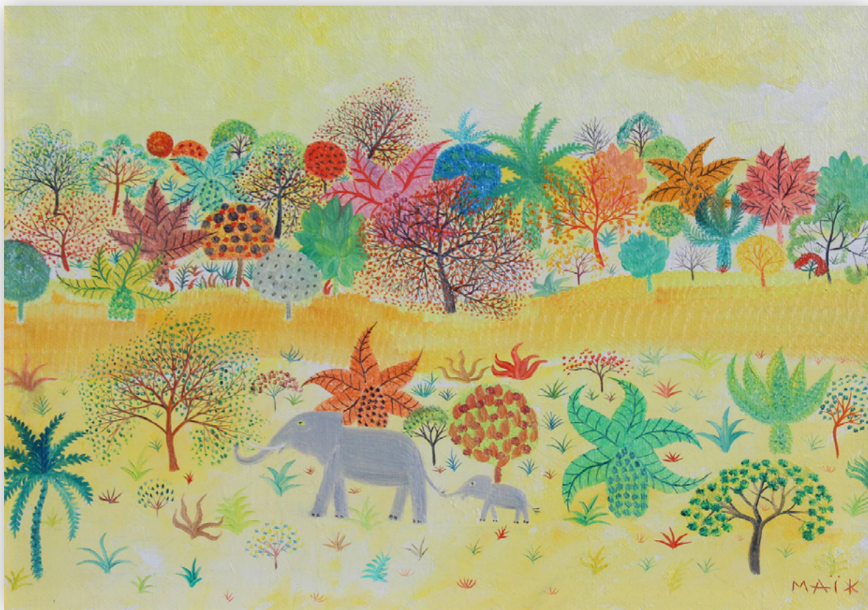
Une promenade | oil on canvas | 13 x 8 11/16 in. | FG© 139116