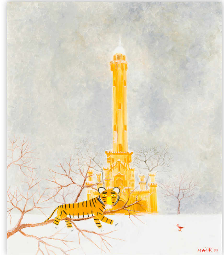
Chicago's Water Tower sous un ciel de neige | oil on canvas