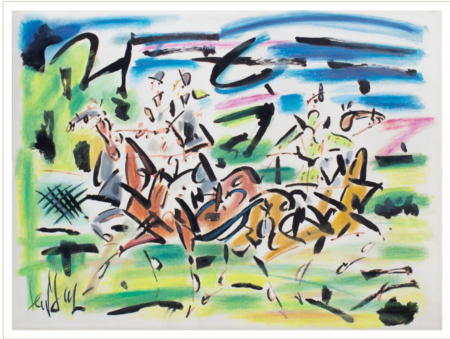
GEN PAUL | Les courses | ink and pastel on paper | 19 3/4 x 25 3/8 in. | FG© 136551