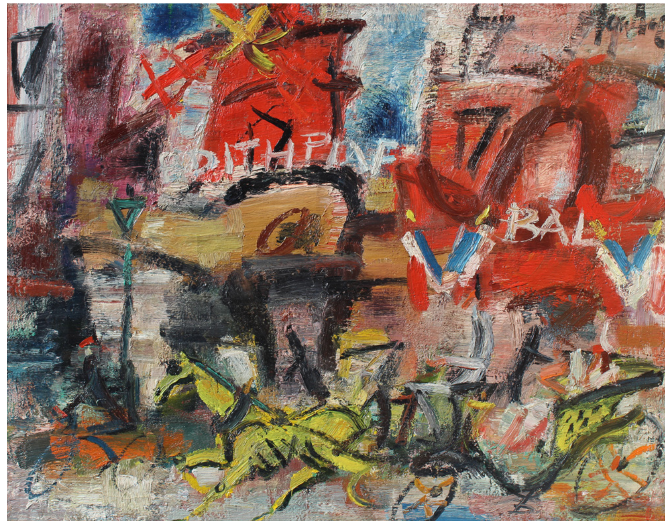
GEN PAUL | Calèche devant le Moulin Rouge, Edith Piaf | oil on canvas | 28 3/4 x 36 1/4 in. | FG© 136819