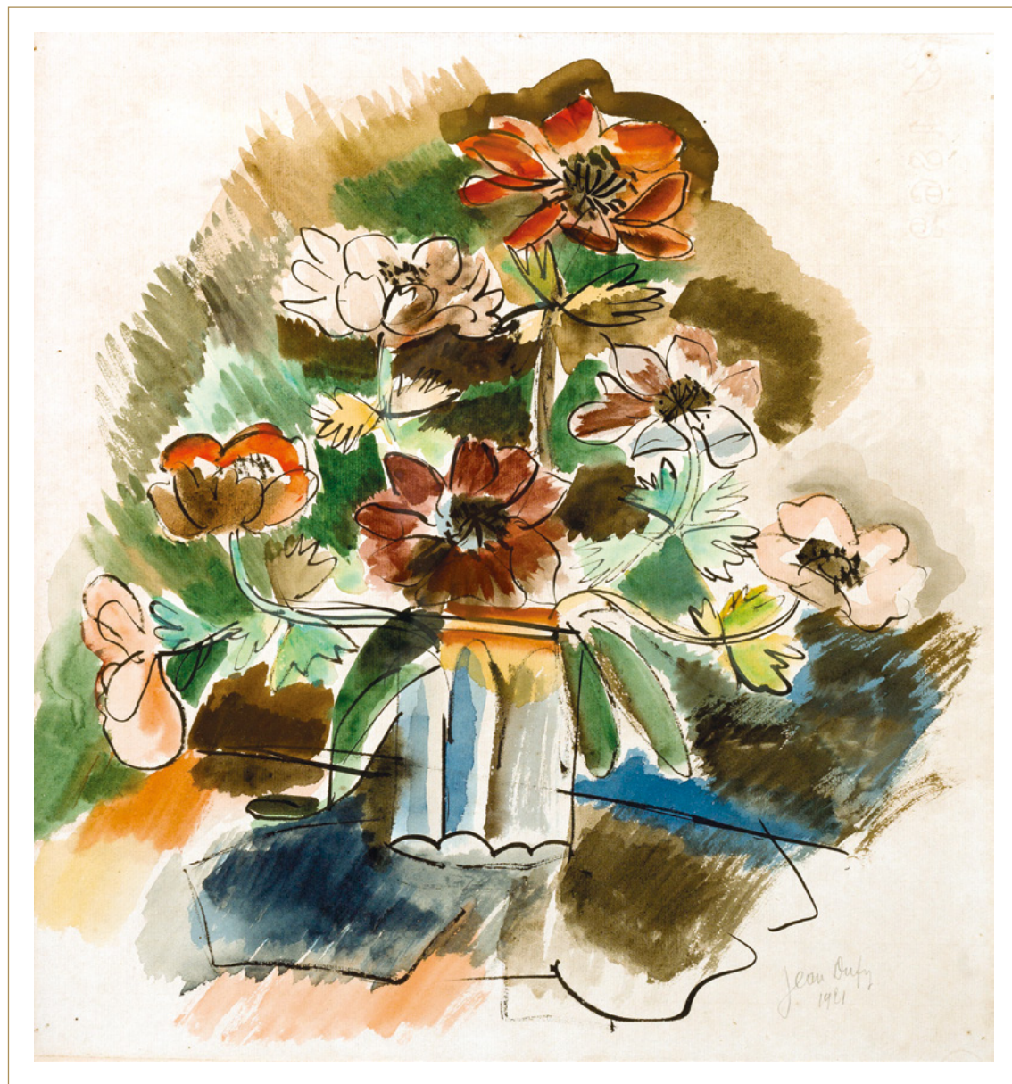
JEAN DUFY | Bouquet de fleurs | watercolor on paper | 18 1/2 x 16 1/2 in. | FG© 134154