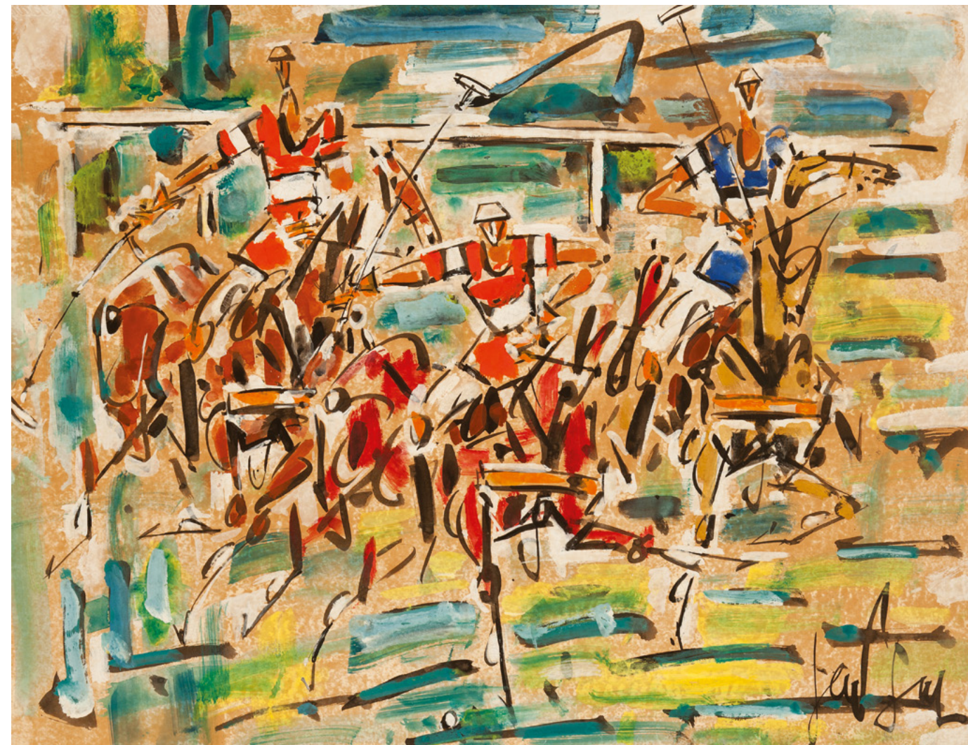
GEN PAUL | Polo | gouache on paper | 19 3/4 x 25 1/2 in. | FG© 135808