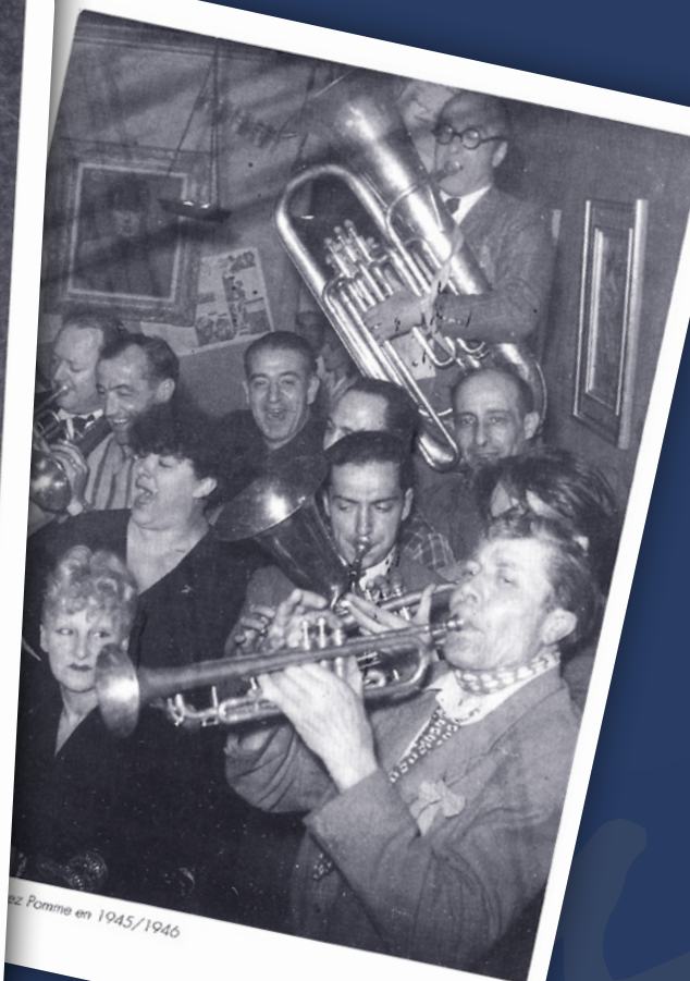
Gen Paul et ses amis en 1945/1946