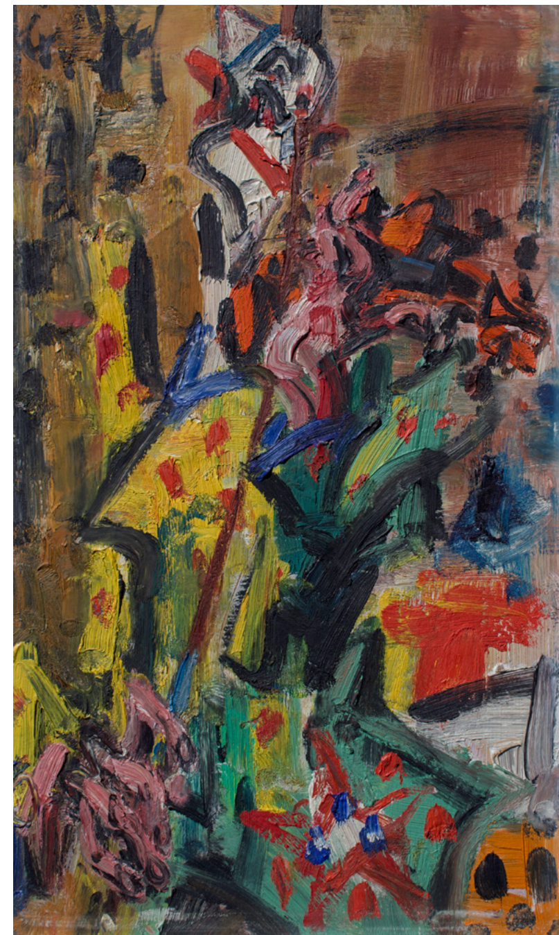
GEN PAUL Clown avec violon oil on panel 21 5/8 x 13 in. FG© 137480