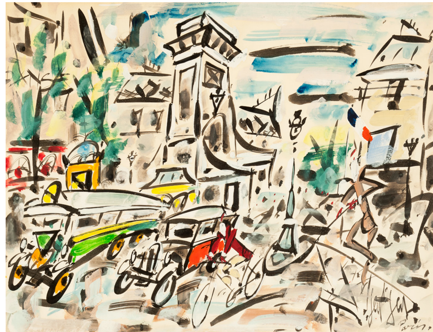
GEN PAUL | rue Parisienne | watercolor & gouache on paper | 19 5/8 x 25 5/8 in. | FG© 135688