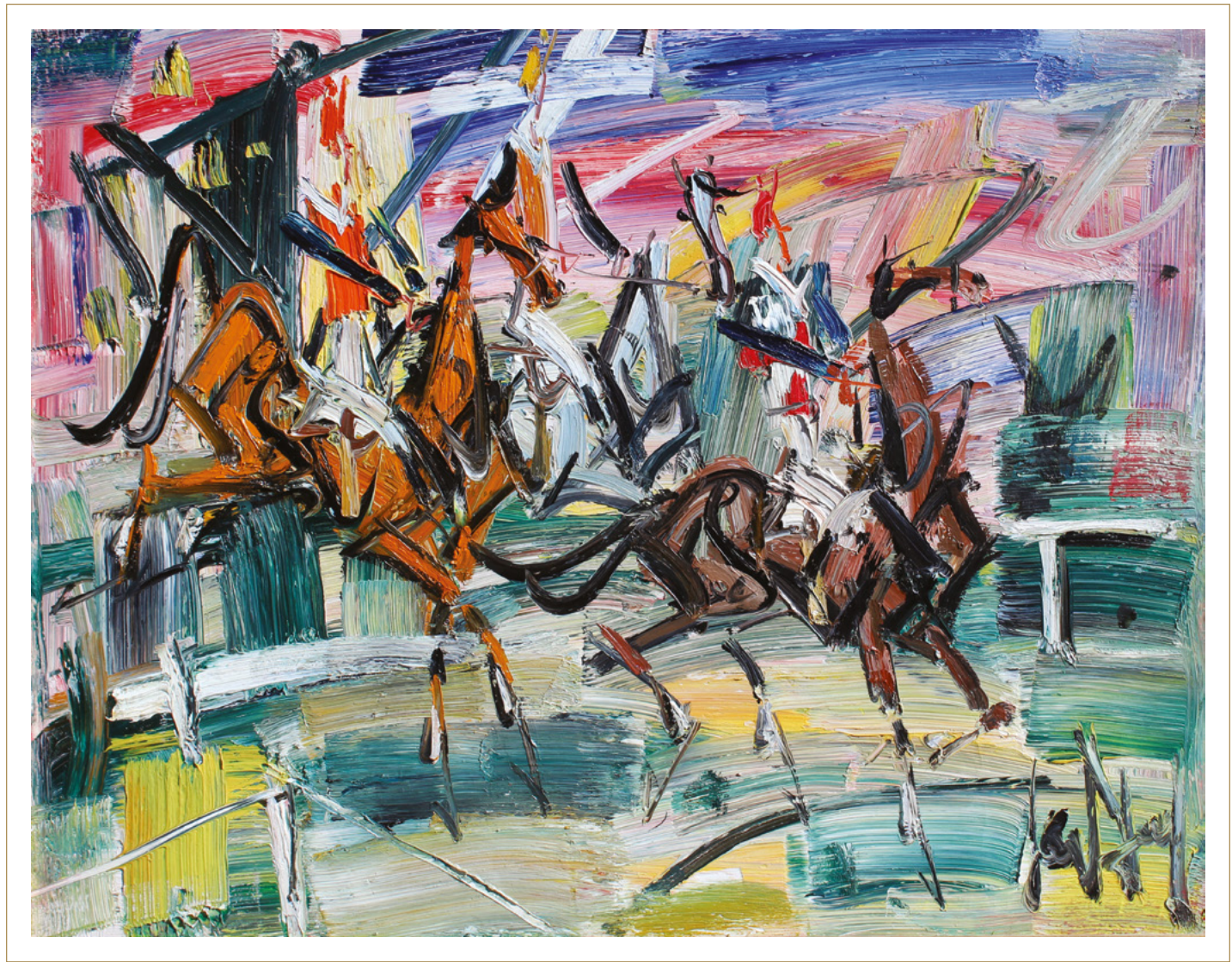
GEN PAUL | Concours de saut d'obstacles | oil on canvas | 25 9/16 x 19 11/16 in. | FG© 137108