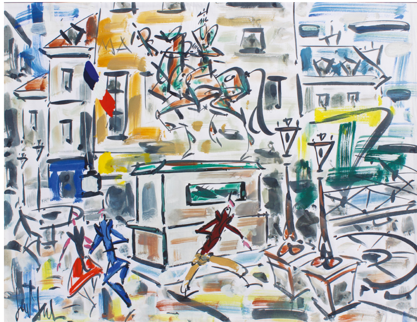
GEN PAUL | Paris, Place de Pont Neuf | gouache on Paper | 19 1/4 x 25 in. | FG© 137407