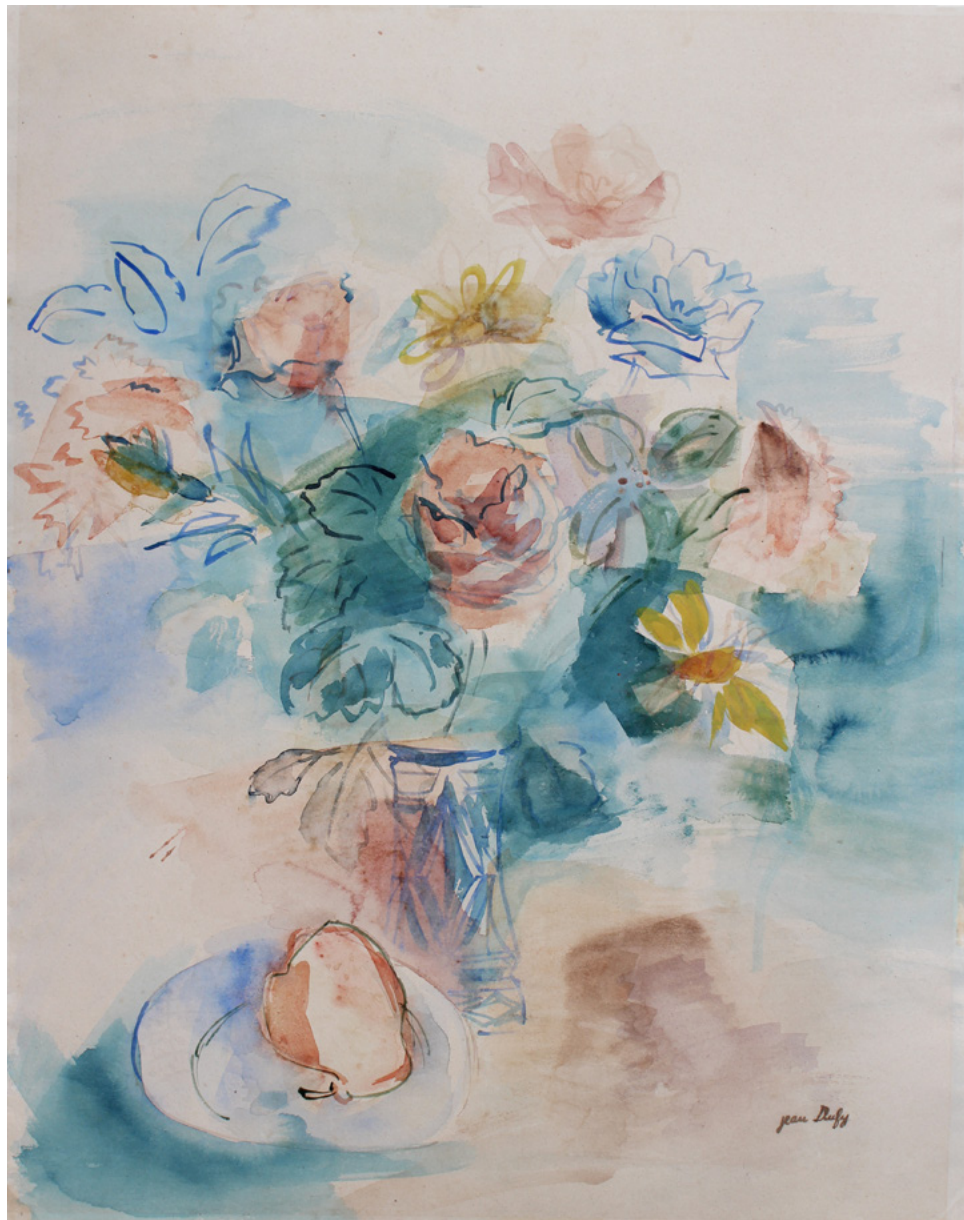
JEAN DUFY | Nature morte aux fleurs et aux fruit | watercolor on paper | 24 3/4 x 19 1/2 in. | FG© 137085