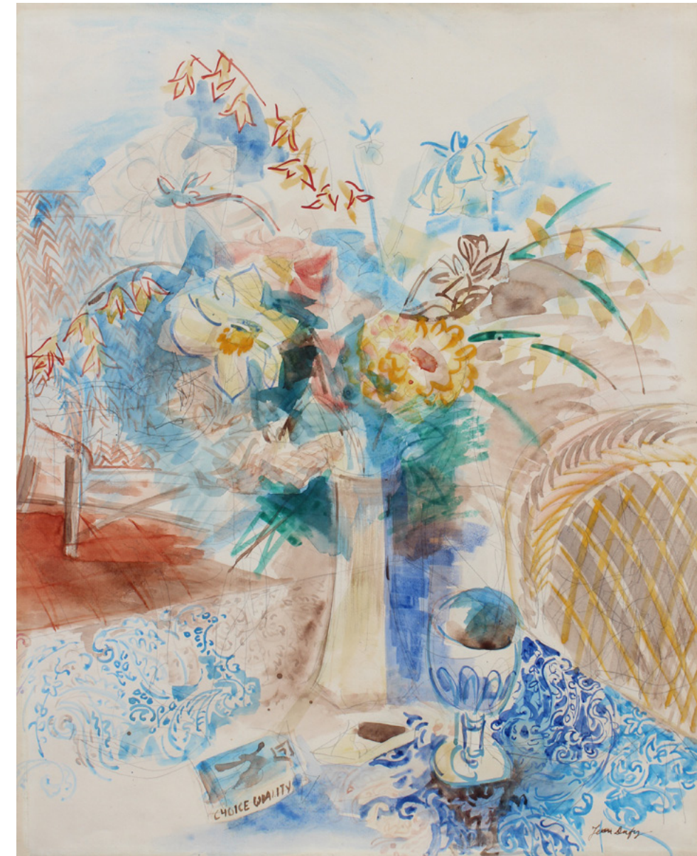
JEAN DUFY | Bouquet de fleur 1 | gouache and watercolor on paper | 24 1/4 x 19 1/4 in. | FG© 139360