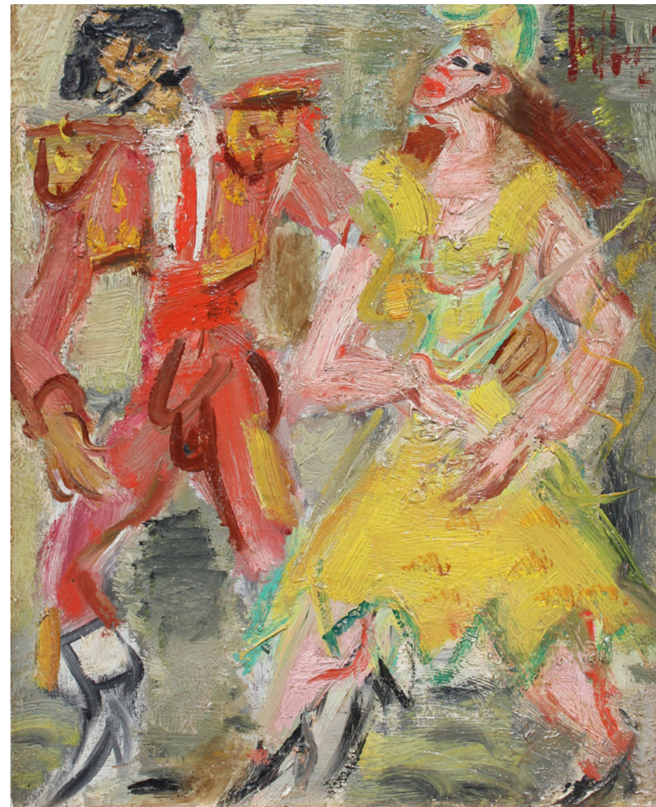
GEN PAUL | Toreador et son Amie | oil on canvas | 18 1/8 x 14 15/16 in. | FG© 139650