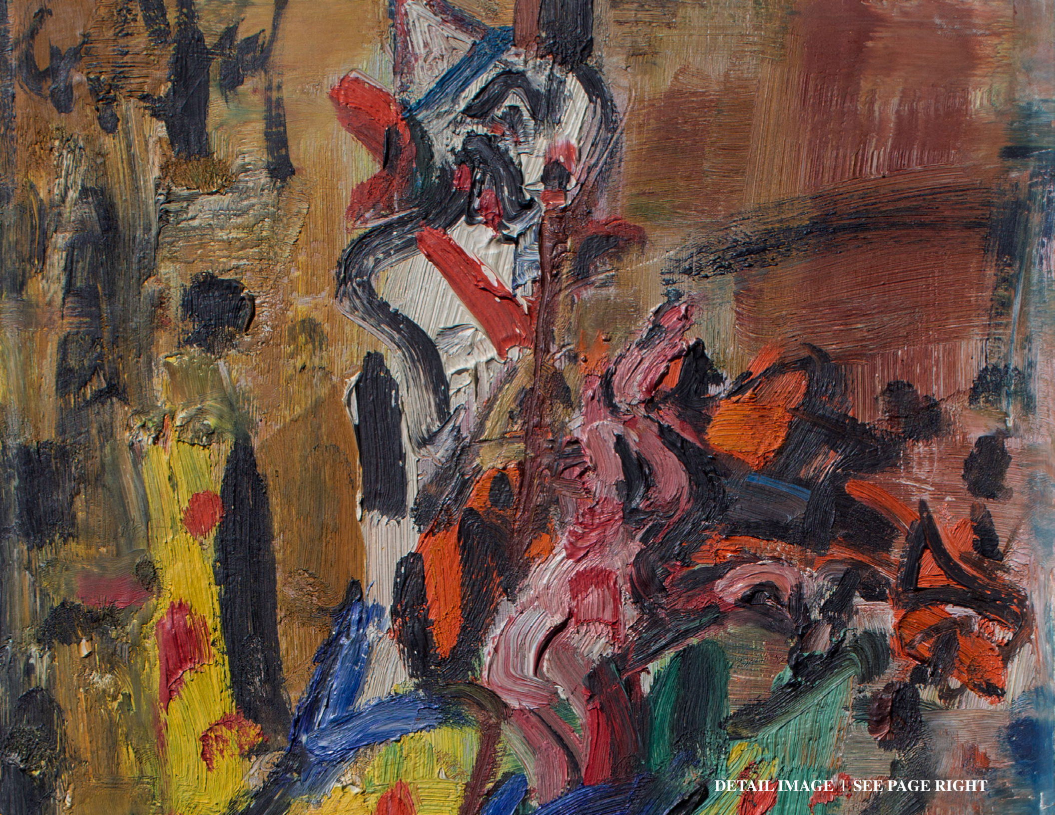
DETAIL IMAGE 1 SEE PAGE RIGHT