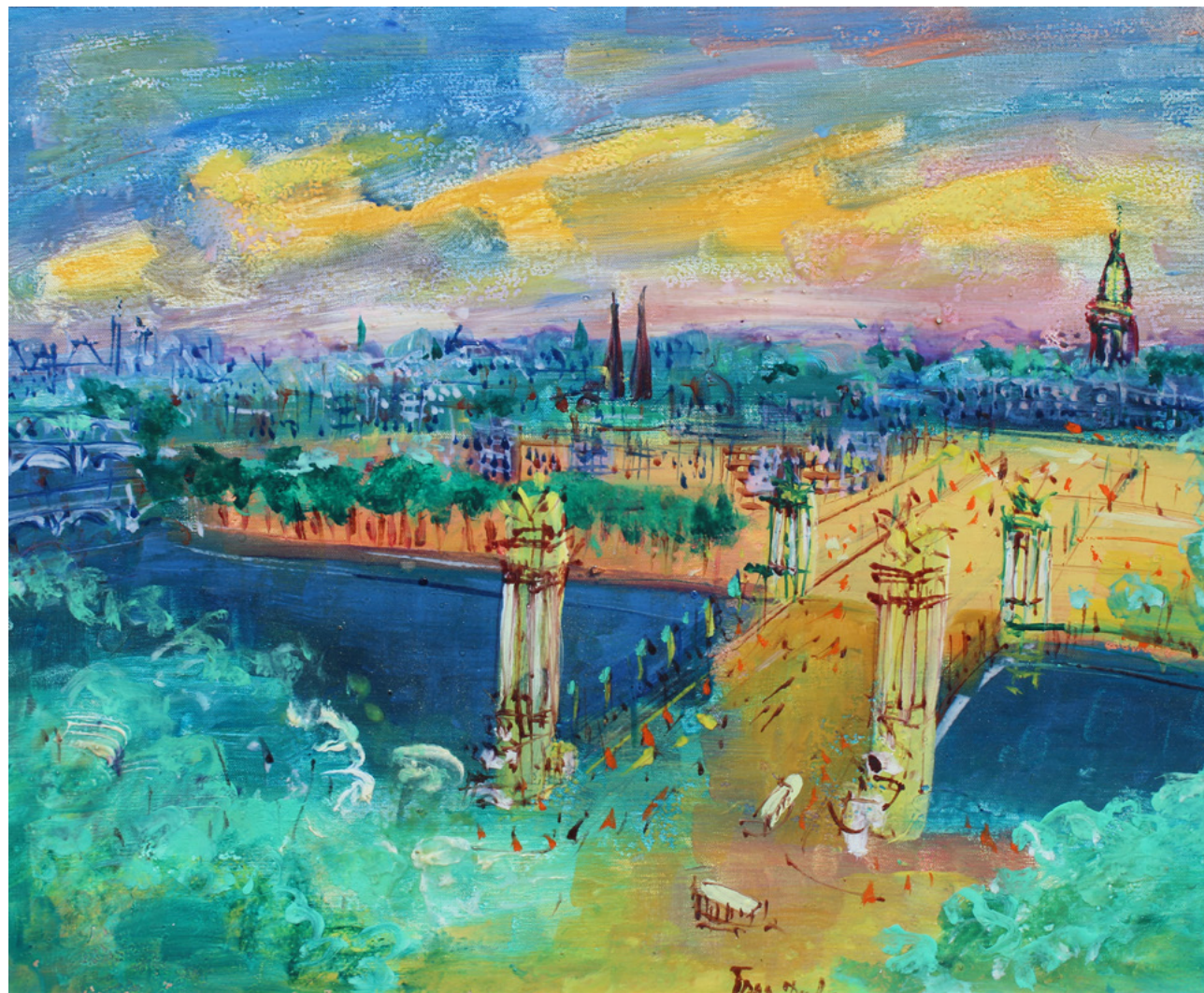
JEAN DUFY | Le Pont Alexandre III | oil on canvas | 15 x 18 in.