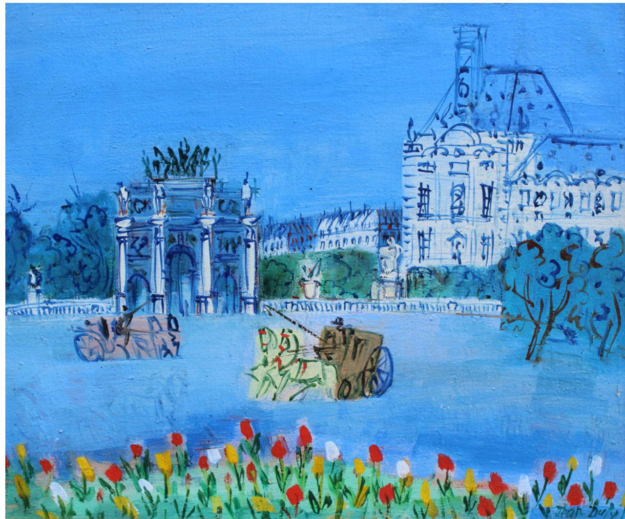
JEAN DUFY | Arc de Triomphe du Carrousel | oil on canvas | 18 1/8 x 21 5/8 in. | FG© 139701