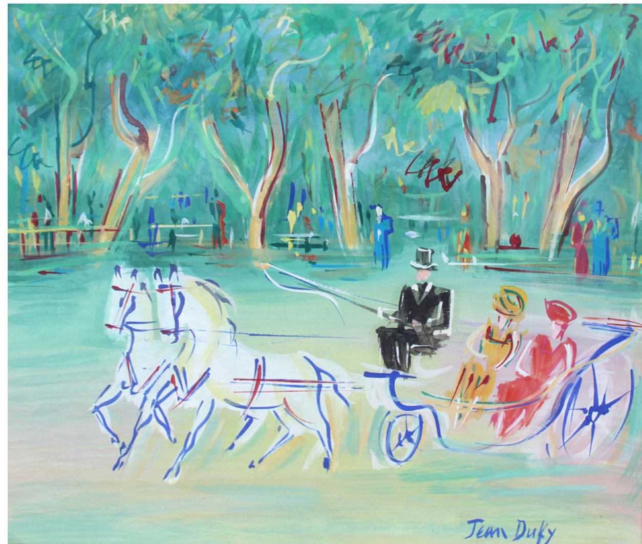
JEAN DUFY | Bois de Boulogne, Paris | gouache on paper | 7 11/16 x 9 1/4 in. | FG© 139709