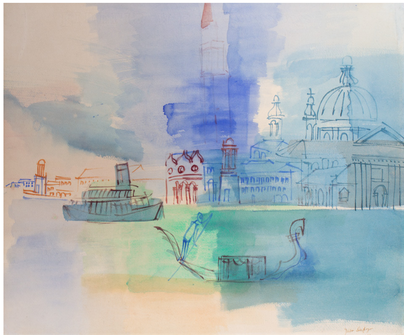
JEAN DUFY | Venise, Le Grand Canal | watercolor on paper | 18 x 22 in. | FG© 136328