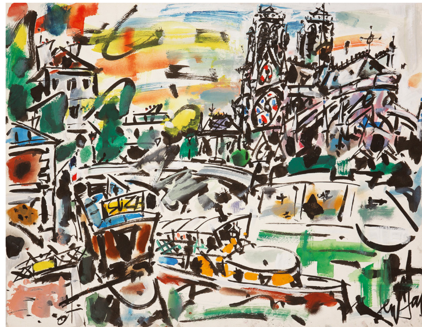
GEN PAUL | Notre Dame | watercolor, gouache and ink on paper | 19 5/16 x 25 5/16 in. | FG© 138410