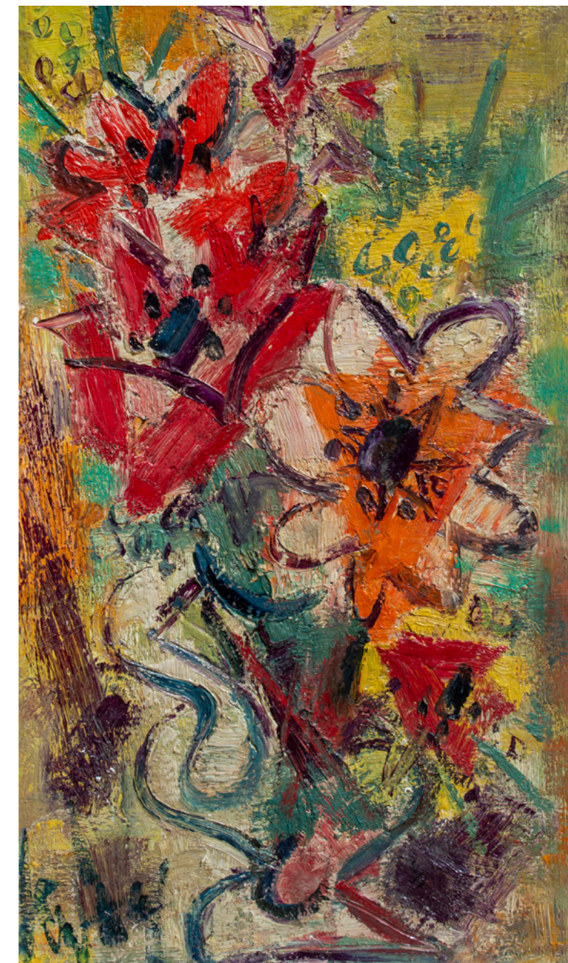
GEN PAUL Bouquet de fleurs oil on panel 21 5/8 x 13 1/8 in. FG© 136102