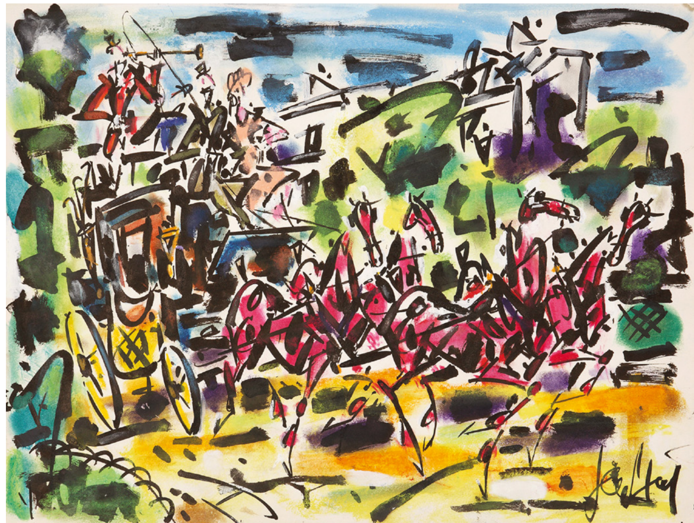
GEN PAUL | Attelage | crayons, gouache and ink on paper | 19 5/16 x 25 5/16 in. | FG© 138411