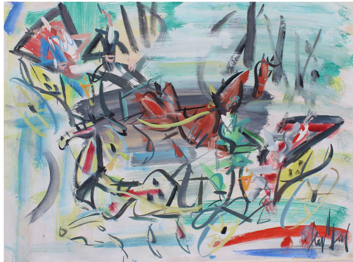
GEN PAUL | La Calèche | gouache on paper | 18 7/8 x 24 13/16 in. | FG© 138592