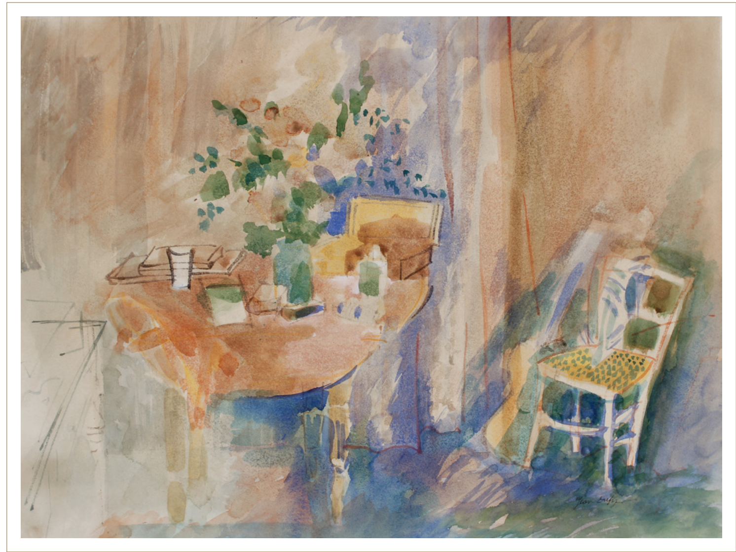
JEAN DUFY | Scène d'Intérieur | watercolor on paper | 19 11/16 x 25 9/16 in. | FG© 138142