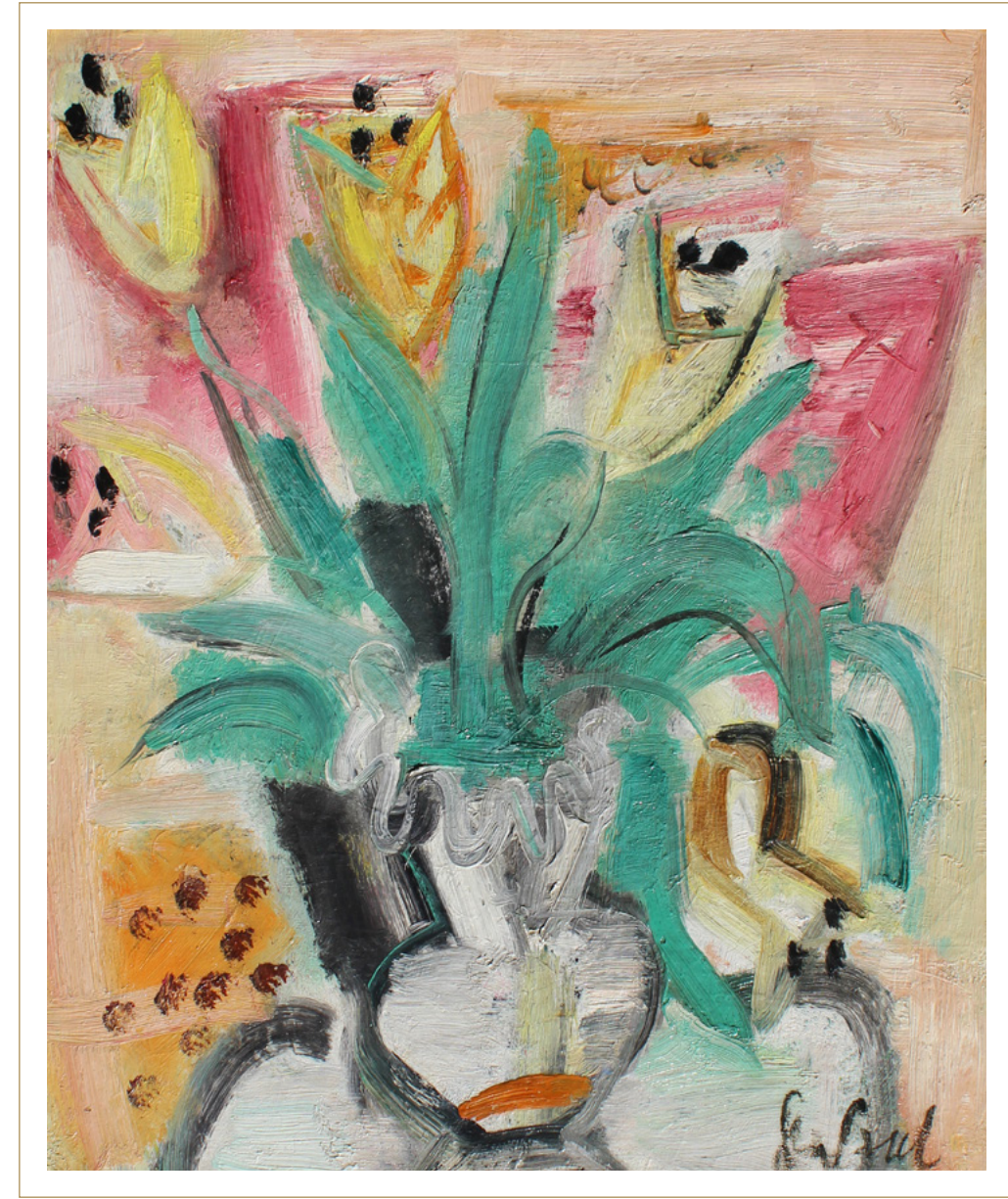
GEN PAUL | Bouquet de fleur de lis jaune | oil on canvas | 21 5/8 x 18 1/8 in. | FG© 138530