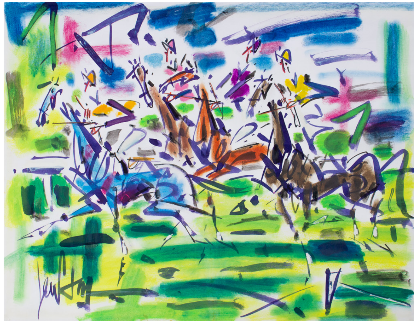
GEN PAUL | Course de chevaux | watercolor on paper | 20 x 25 in. | FG© 137086