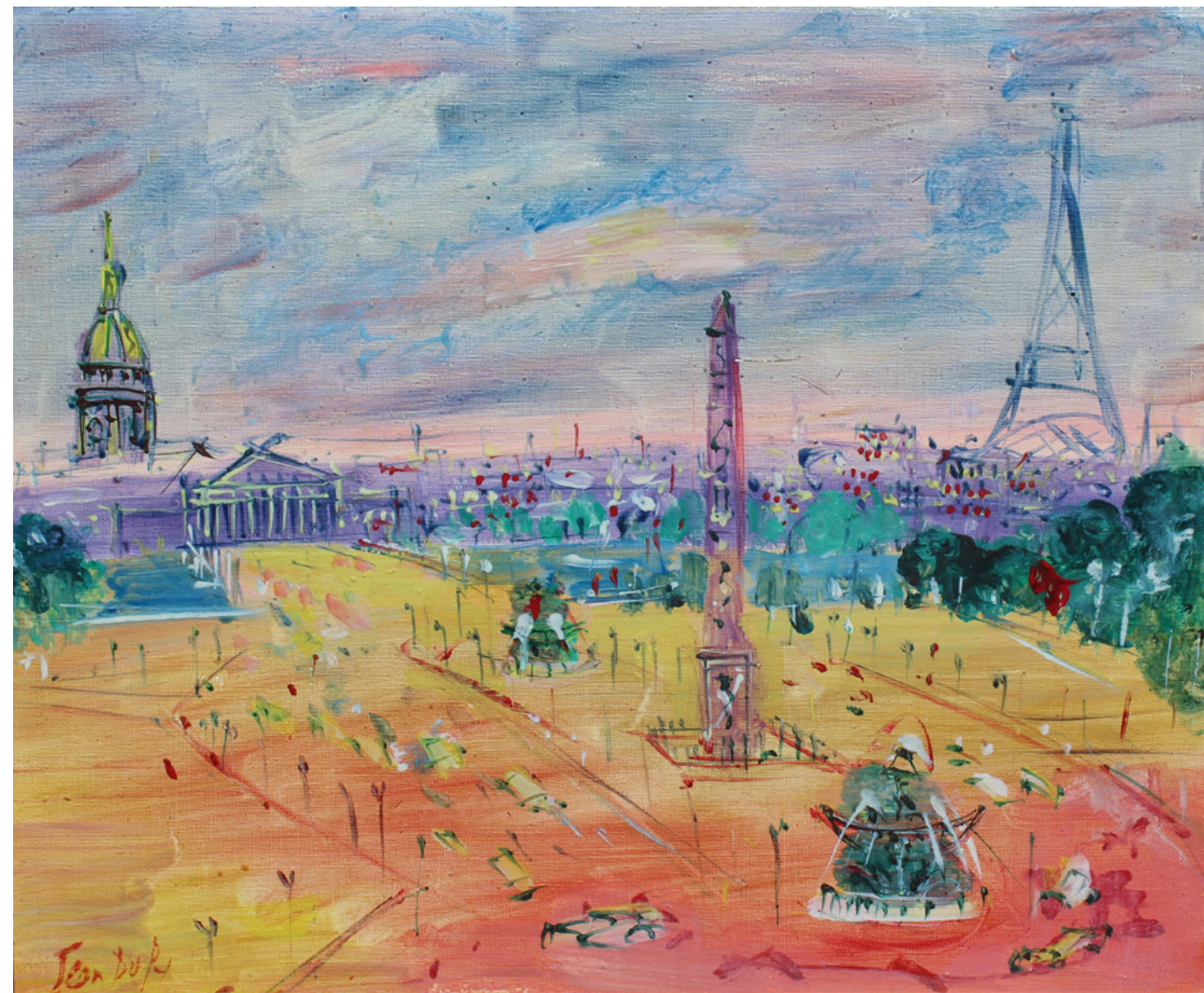
JEAN DUFY | Place de la Concorde | oil on canvas | 15 x 18 in. | FG© 137631