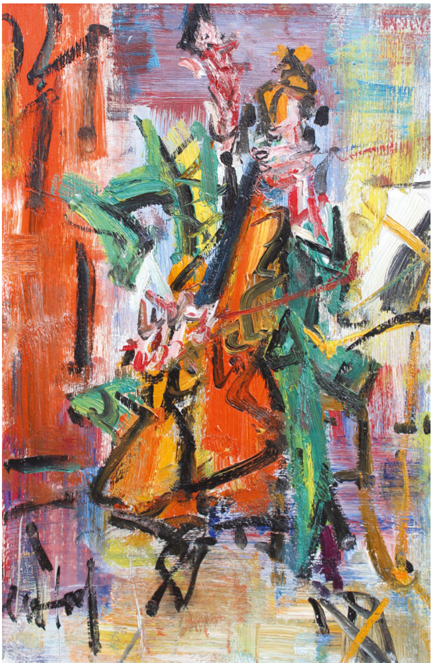
GEN PAUL Contrebassiste oil on masonite 16 1/8 x 10 5/8 in. FG© 137107