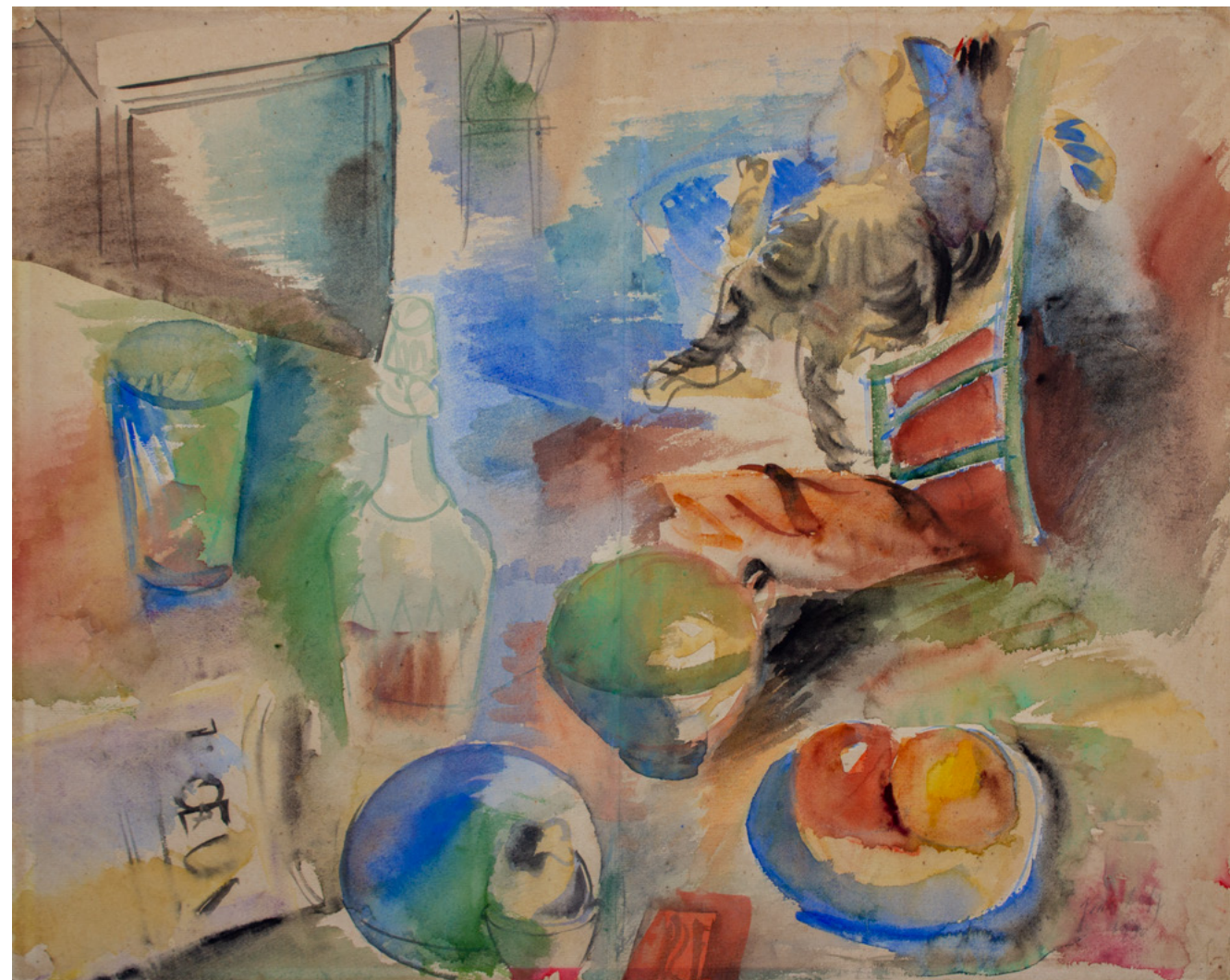
JEAN DUFY | Nature morte avec fruits | aquarelle on paper | 17 1/2 x 21 3/4 in. | FG© 135620