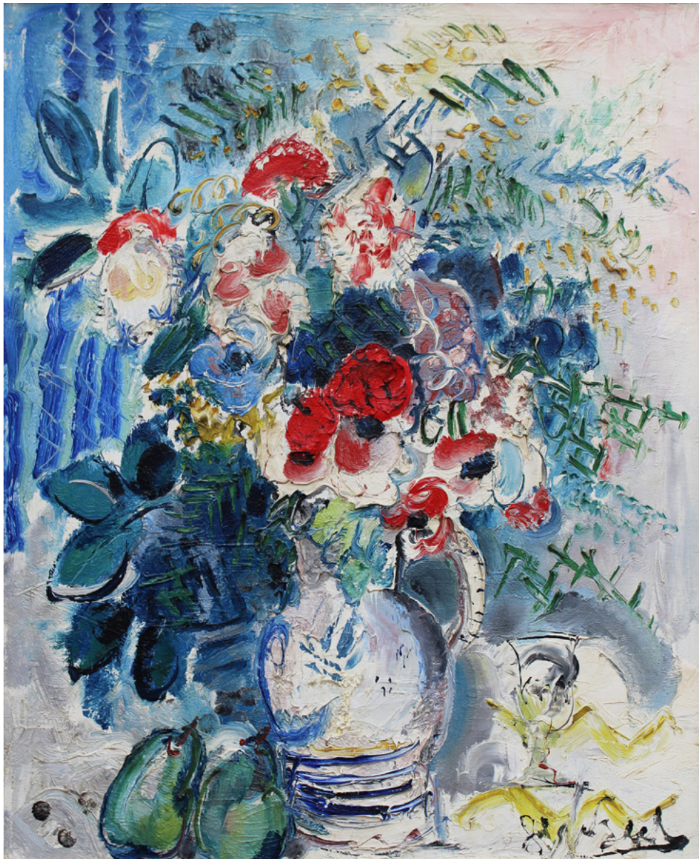
GEN PAUL | Nature morte avec fleurs | oil on canvas | 28 3/4 x 23 1/2 in. | FG© 139764