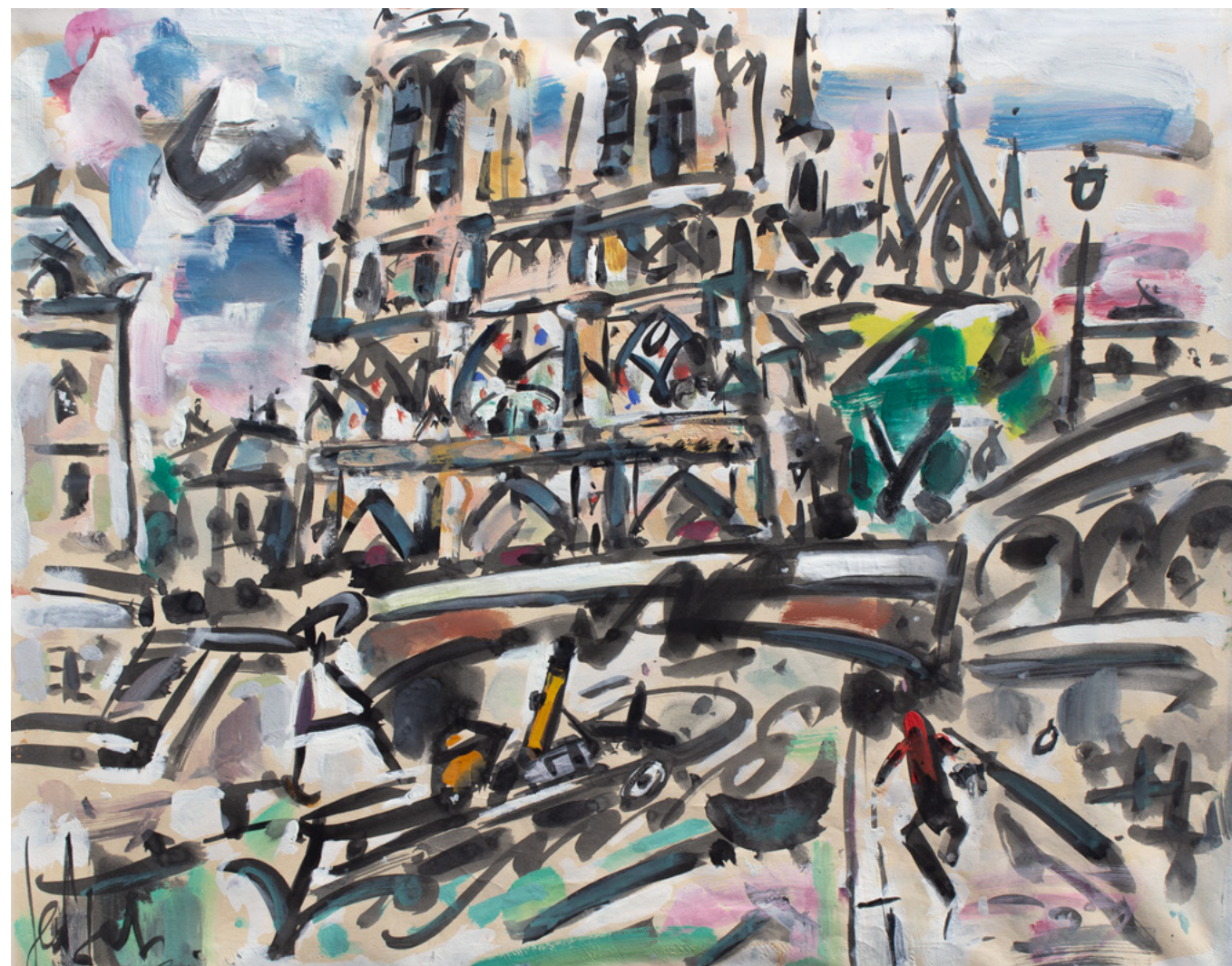
GEN PAUL | Notre Dame | gouache on paper | 19 3/4 x 25 1/2 in. | FG© 136106