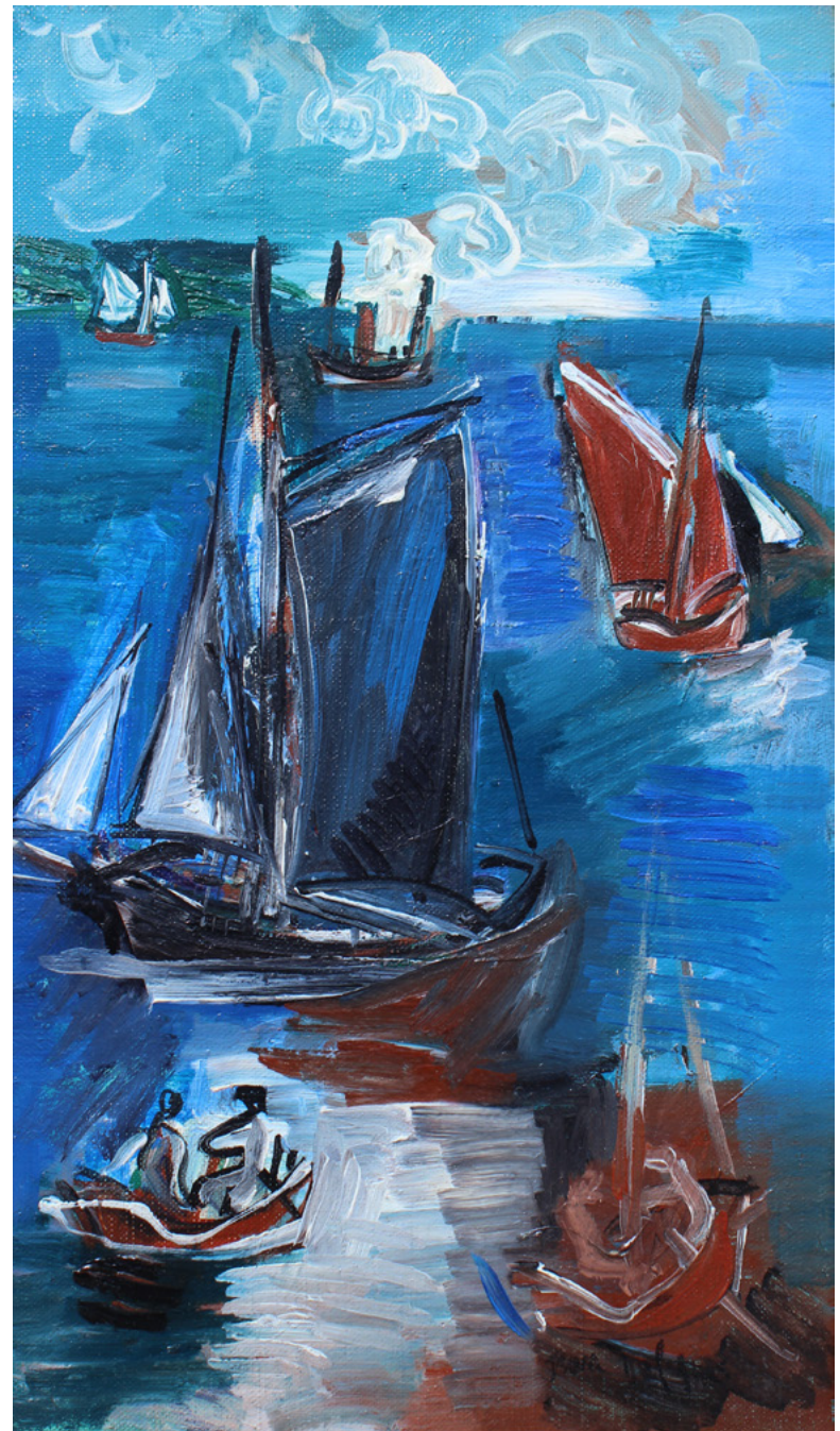
JEAN DUFY Voiliers oil on canvas 16 x 9 1/2 in. FG© 139688