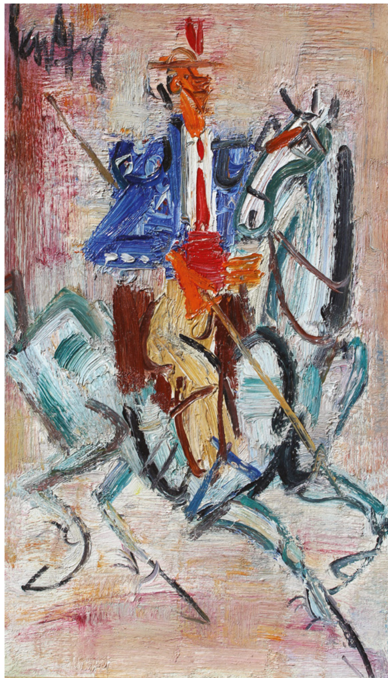
GEN PAUL Le Picador oil on canvas 15 11/16 x 9 7/16 in. FG© 136383