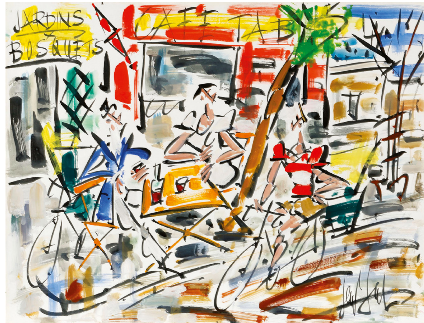
GEN PAUL | Jardins Bosquets | gouache | 25 9/16 x 19 11/16 in. | FG© 137153