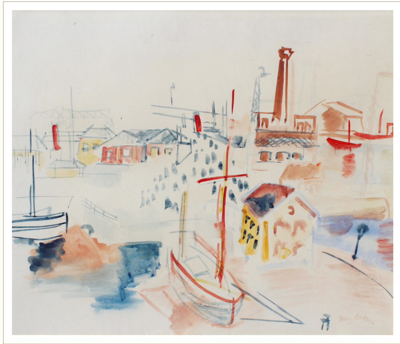
JEAN DUFY | Port du Havre | watercolor on paper | 16 1/2 x 19 5/8 in. | FG© 135763