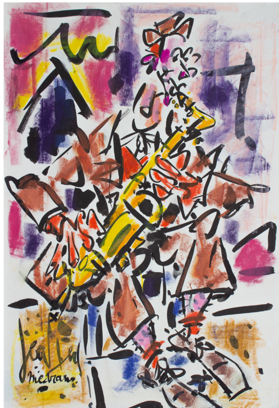
GEN PAUL Le Clown Saxophoniste pastel and ink on paper 21 5/8 x 15 1/4 in. FG© 137082