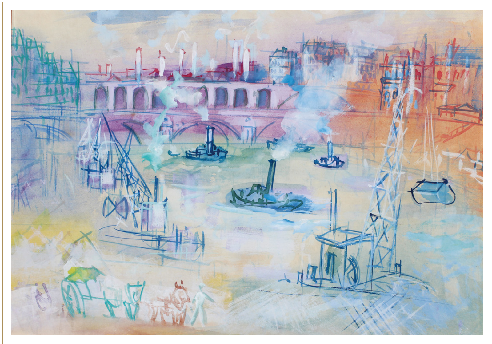
JEAN DUFY | Viaduc du Point-du-Jour, Paris | watercolor on paper | 16 1/2 x 23 9/16 in. | FG© 137084