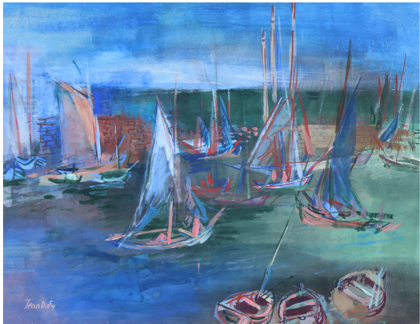
JEAN DUFY | Ile d'Yeu | gouache and watercolor on paper | 16 3/8 x 21 3/8 in. | FG© 139283