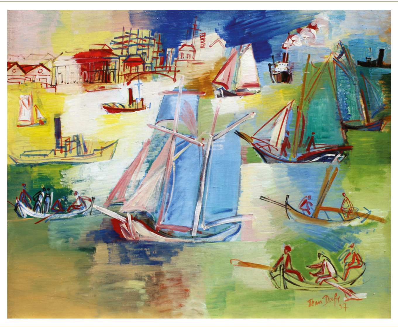
JEAN DUFY | Voiliers dans l'avant-port du Havre | oil on canvas | 21 7/8 x 25 5/8 in. | FG© 139689