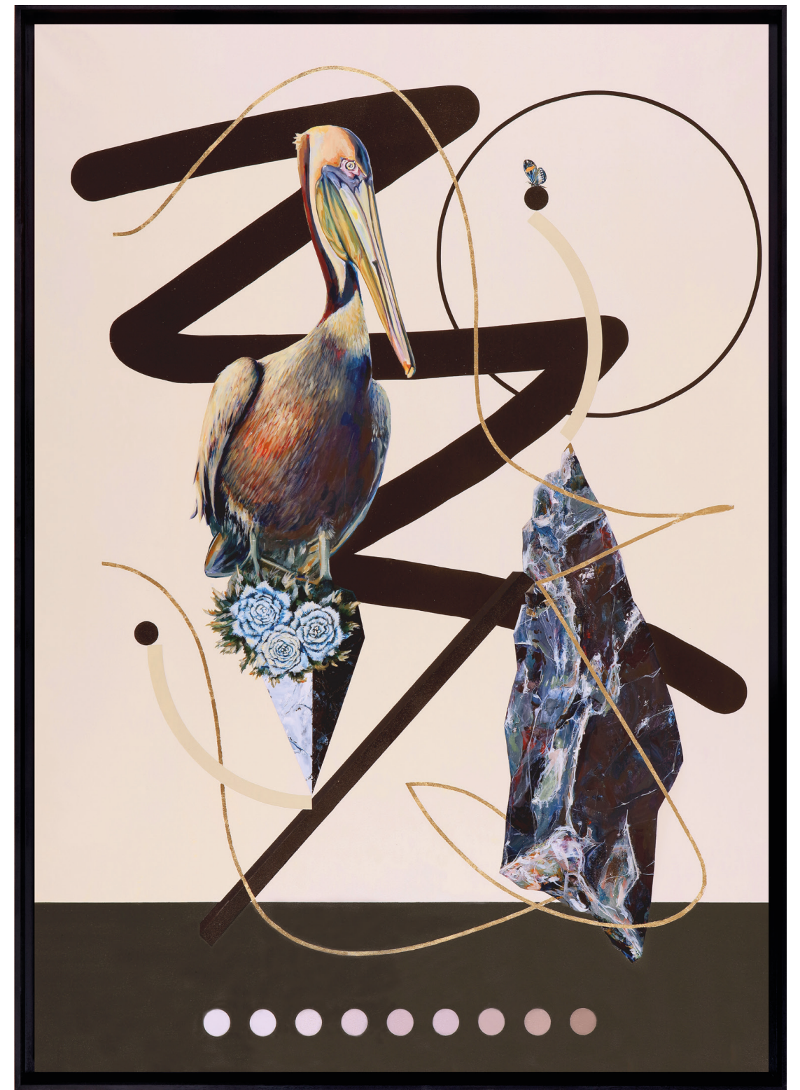
Pelican Brun Huppe

Acrylic on canvas | 63 3/4 x 44 7/8 in. | FG© 139618