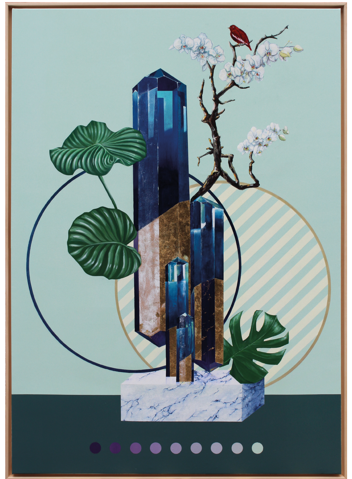
Durbec des Pins

Acrylic on canvas | 63 3/4 x 44 7/8 in. | FG© 139615