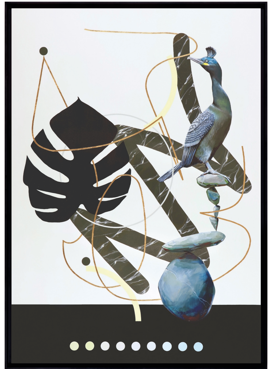
Cororan Huppe Acrylic on canvas | 63 3/4 x 44 7/8 in. | FG© 139617