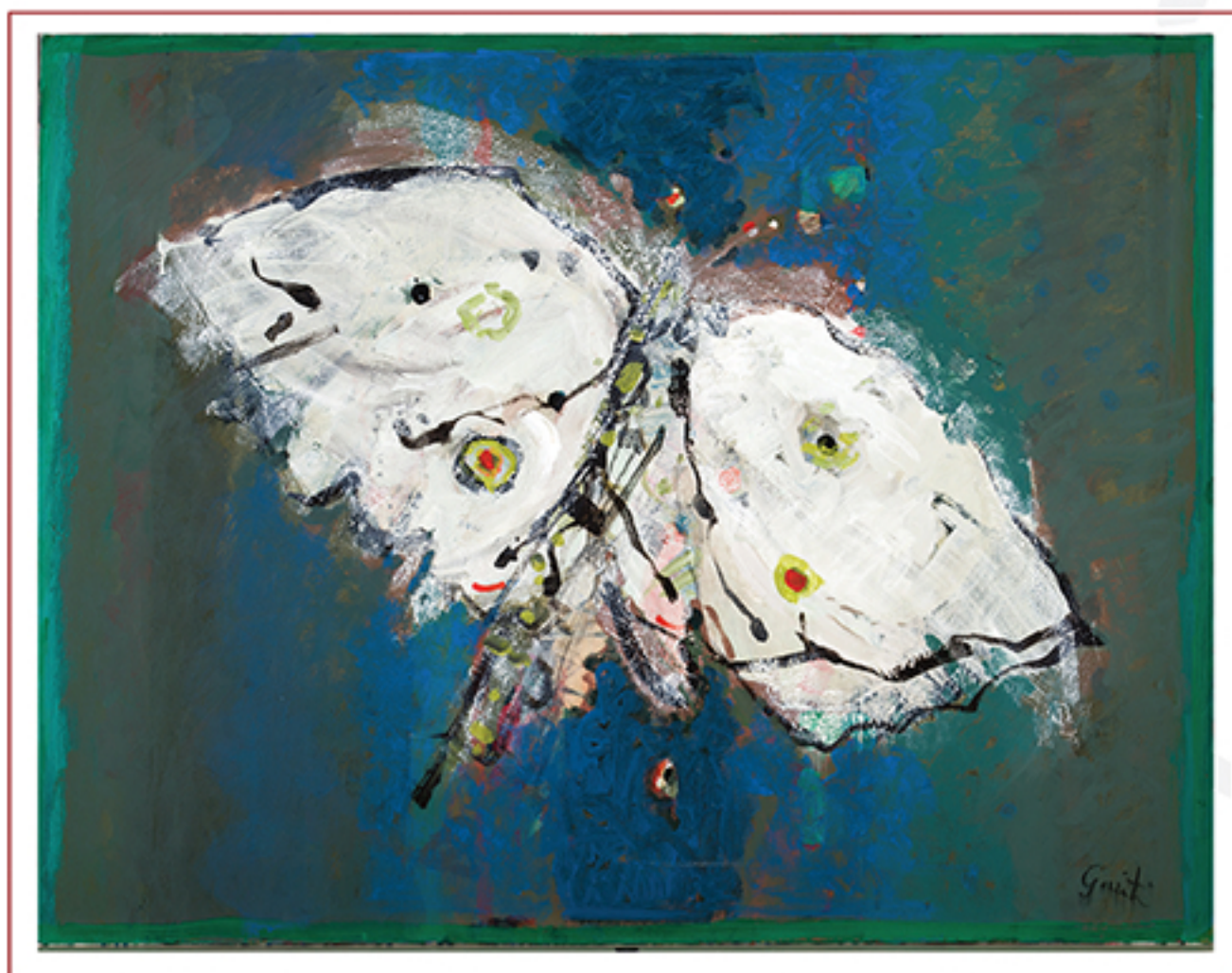
Papillon blanc | Mixed media on canvas | 35 1/16 X 45 11/16 in | FG©136591

Findlay Galleries first exhibited the work of Gorriti in 1981 in Paris, and has proudly shown his work for the past 38 years.