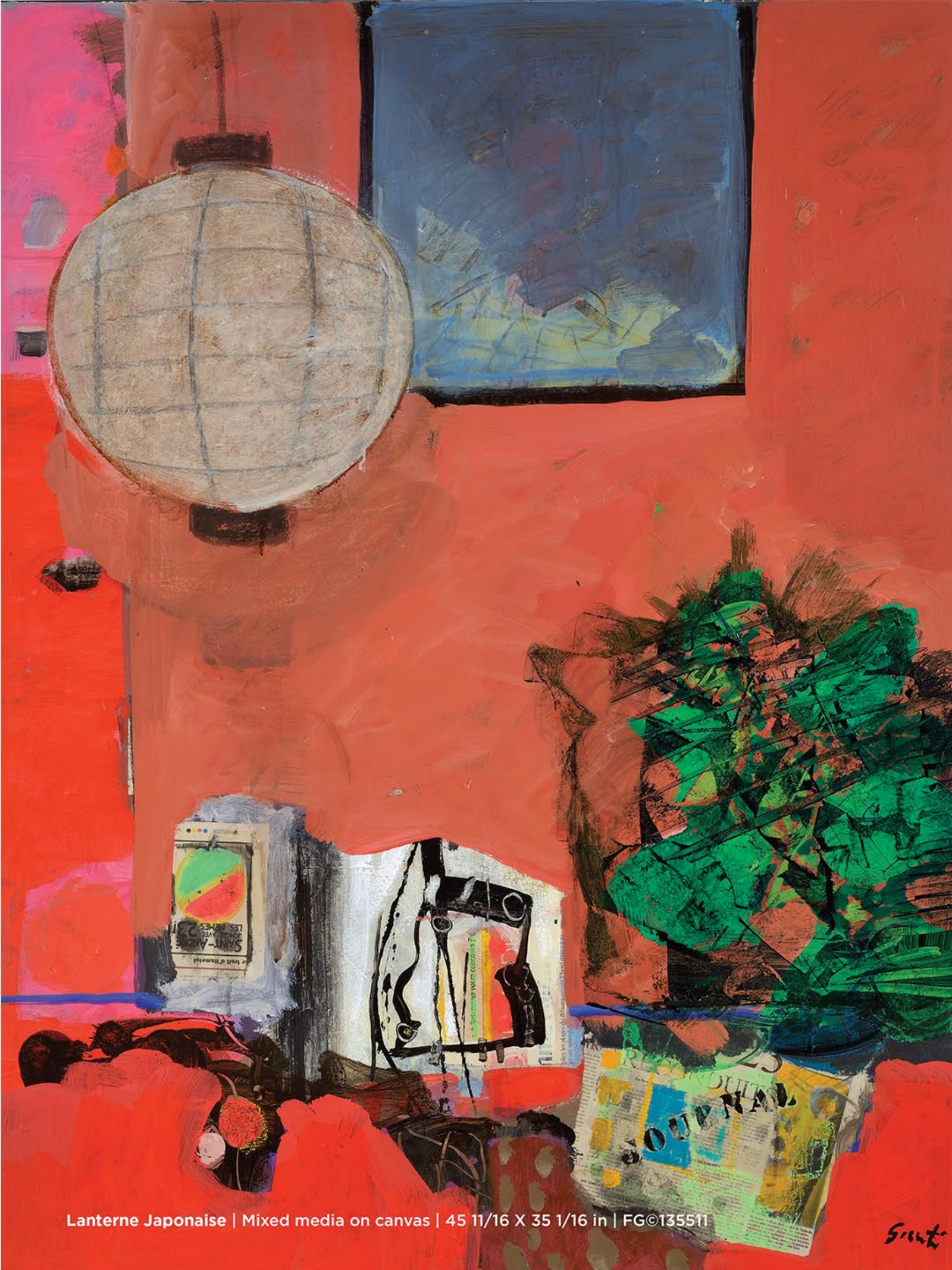
Lanterne Japonaise | Mixed media on canvas | 45 11/16 X 35 1/16 in | FG©135511