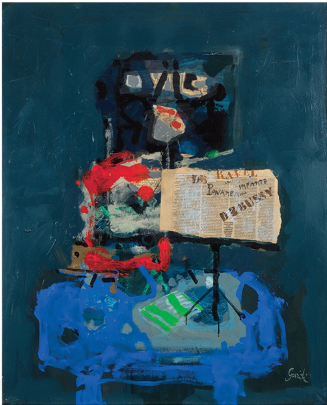
La partition de musique | Mixed media on canvas | 39 3/8 X 31 7/8 in | FG©133326