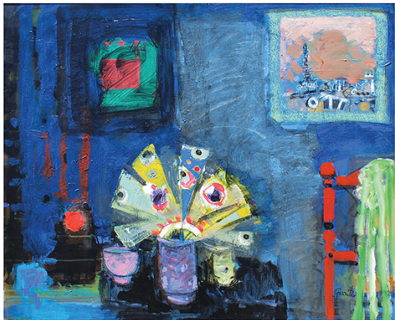
L'eventail | Oil on canvas | 31 7/8 X 39 13/8 in | FG©130871