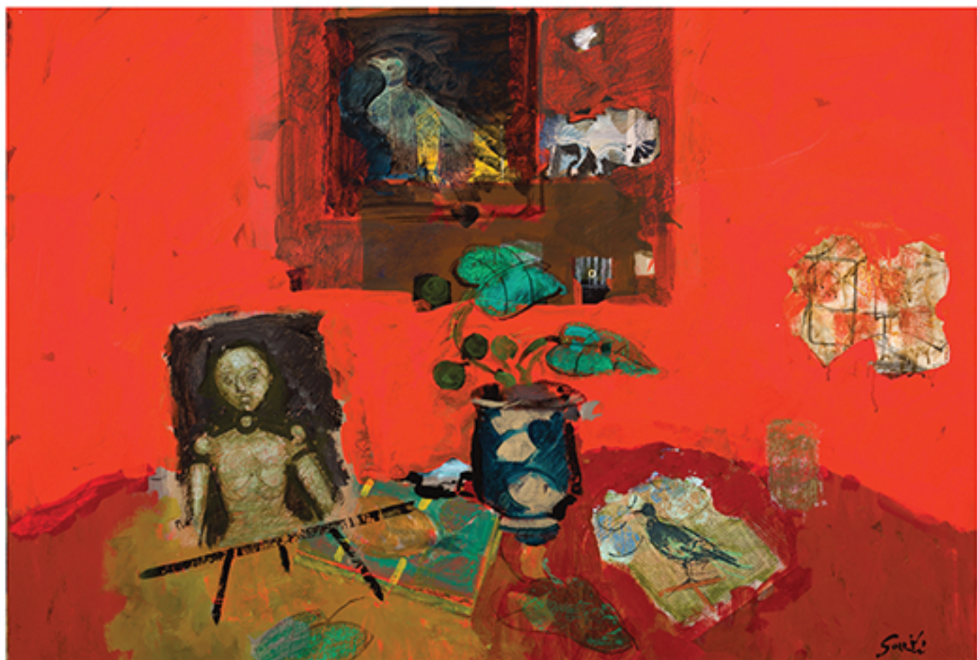
Above and Cover

Composition rouge | Mixed media on canvas | 35 1/16 X 45 11/16 in | FG©136597