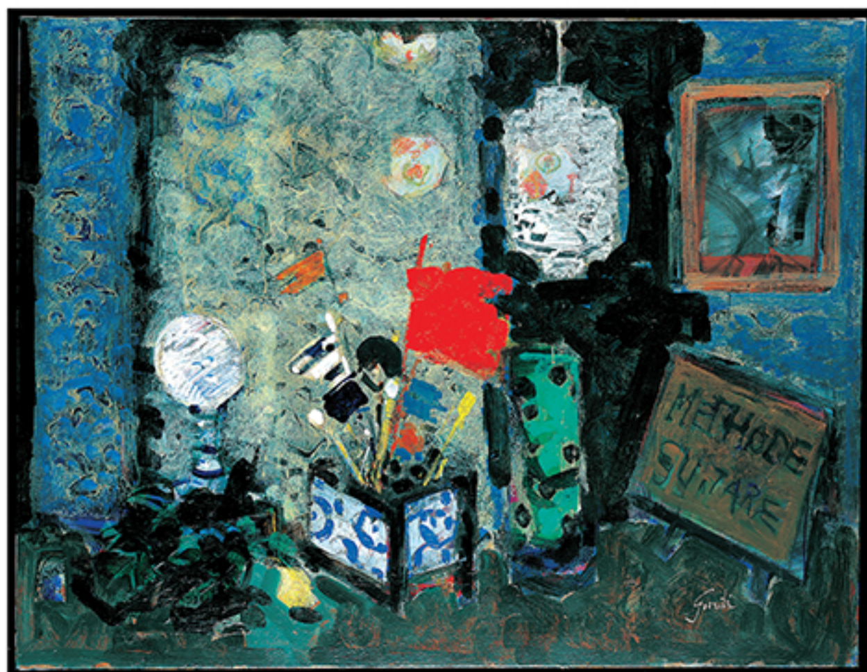
Les petits drapeaux | Mixed media on canvas | 35 1/16 X 45 11/16 in | FG©130861