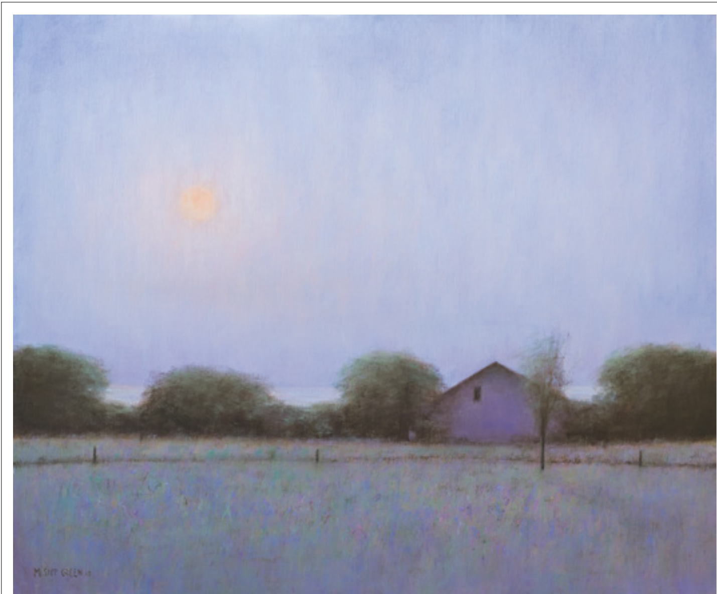
I S L A N D T W I L I G H T

Oil on Linen | 38 x 46 Inches | FG©138579