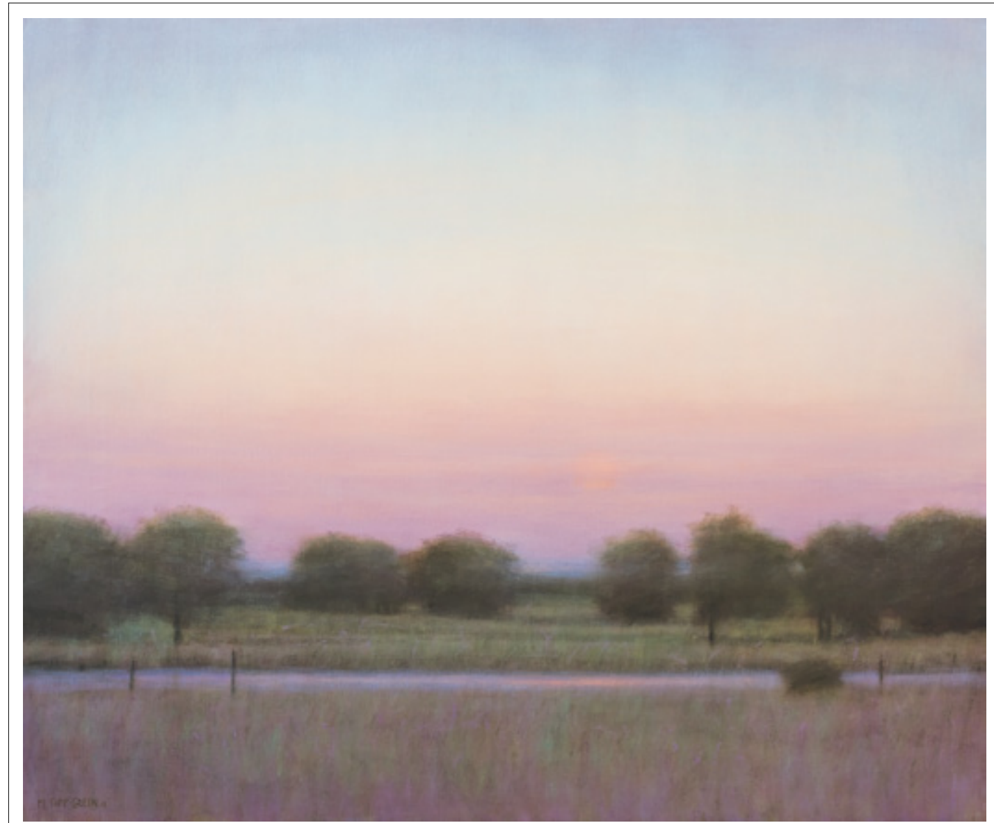
M E A D O W O N T H E N O R T H S H O R E

Oil on Linen | 38 x 46 Inches | FG©138579