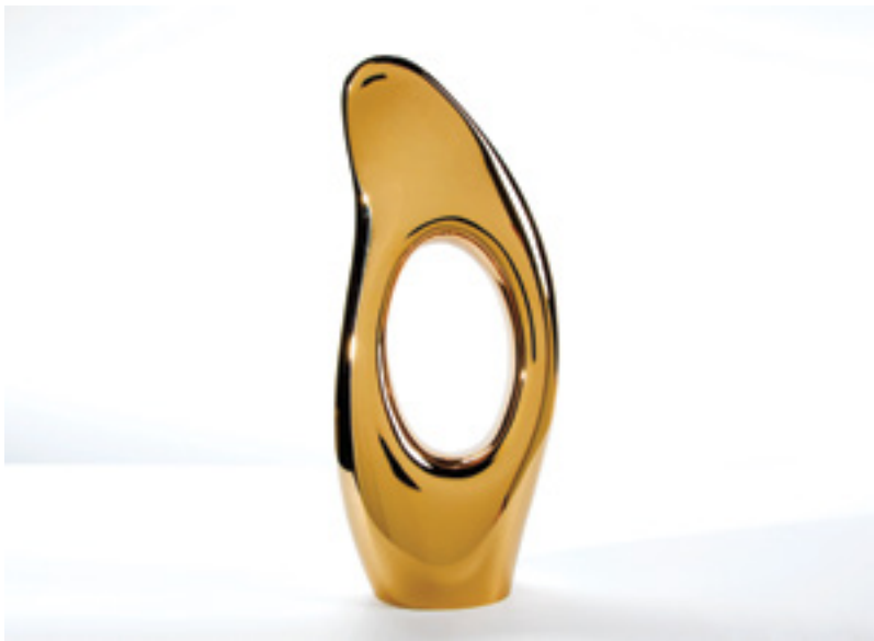
Him, 1/6 Edition, 2017 Polished Bronze 11 1/2 x 5 x 2 Inches FG©139102