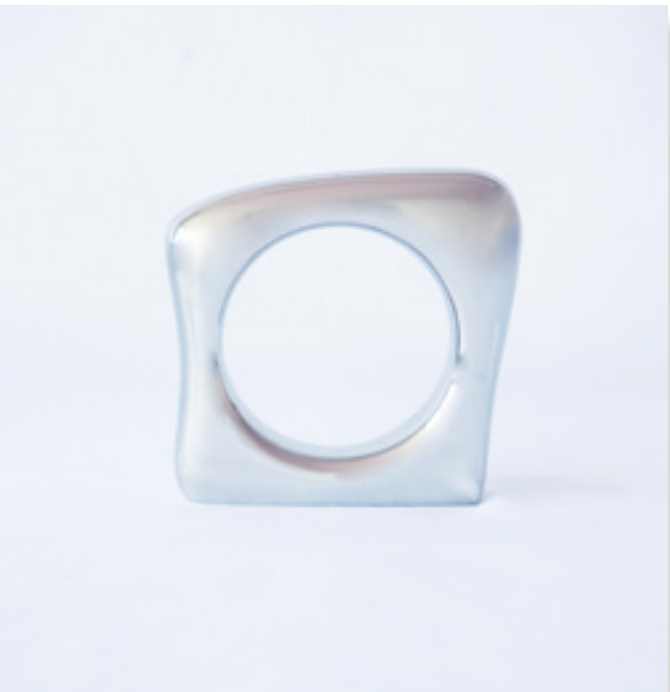
Bone Form, 1/6 Edition, 2016 :: Mini Maquette Series. Polished Nickel :: 5 x 5 x 2 1/2 Inches :: FG©139104