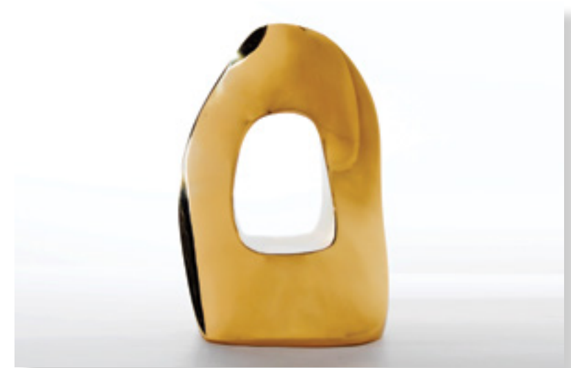
Altro, 1/6 Edition, 2017 Polished Bronze 17 x 13 x 3 1/2 Inches FG©139096