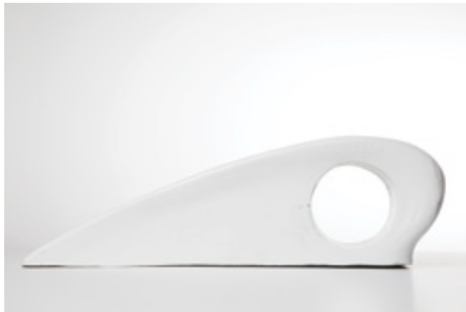
Wing, 1999 White Paint Over Wood 6 1 / 3 x 18 x 3 1 / 2 Inches FG©139080