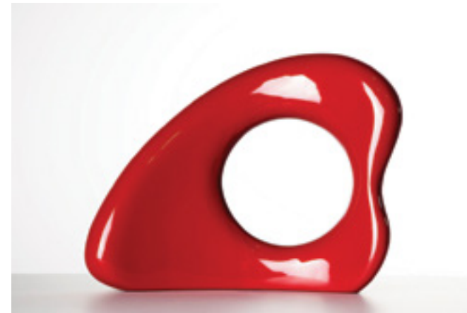
T-Rex-i, 2016 Red Lacquer Over Wood 7 x 9 x 2 Inches FG©139087