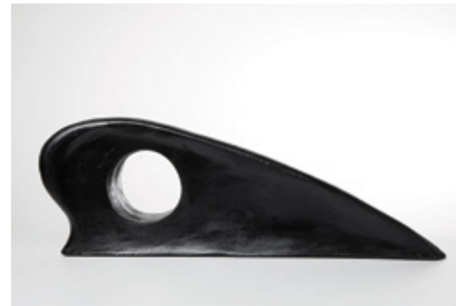
Wing, 1999 Black Paint Over Wood 6 5 / 16 x 18 x 3 1 / 2 Inches FG©139079