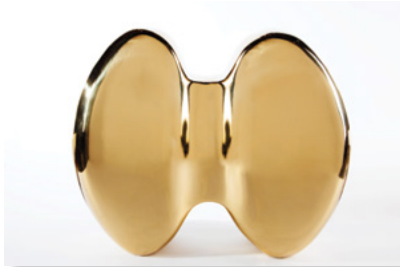
Nut Form, 1/3 Edition, 1985 Polished Bronze 10 x 11 x 5 Inches FG©139093