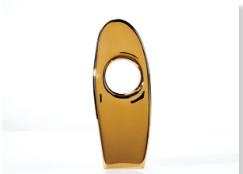
Her, 1/6 Edition, 2017 Polished Bronze 11 1/2 x 4 1/2 x 2 Inches FG©139101