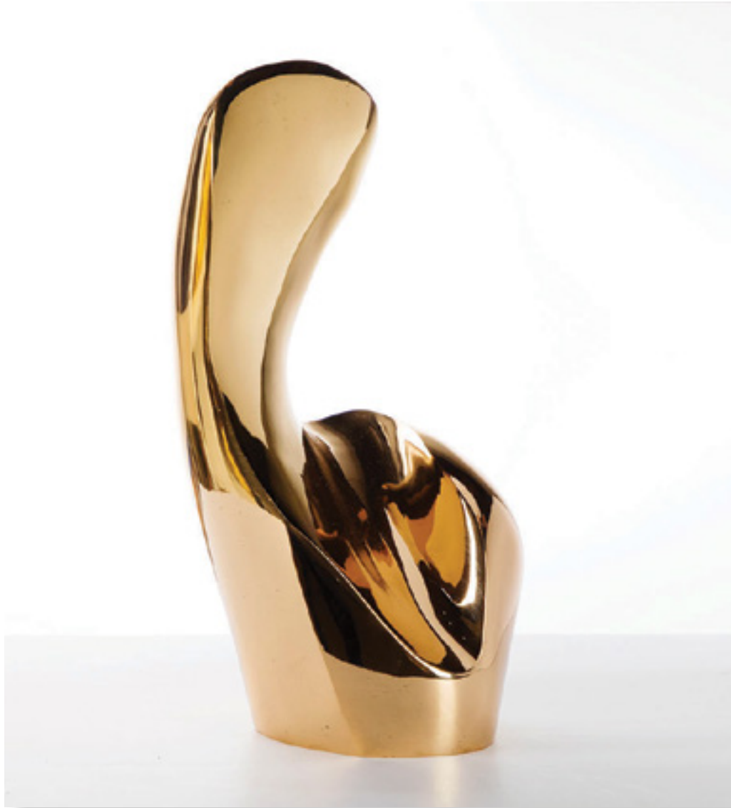
Seated Figure, 3/8 Edition, 1985 Polished Bronze 16 x 8 1/2 x 6 Inches FG©139091