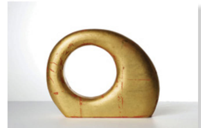
Golden Apple, 2016 Gold Leaf Over Wood 8 x 10 x 2 Inches FG©139085