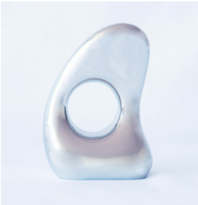
Sail Form, 1/6 Edition, 2016 :: Mini Maquette Series. Polished Nickel :: 5 x 3 x 2 1/2 Inches :: FG©139105