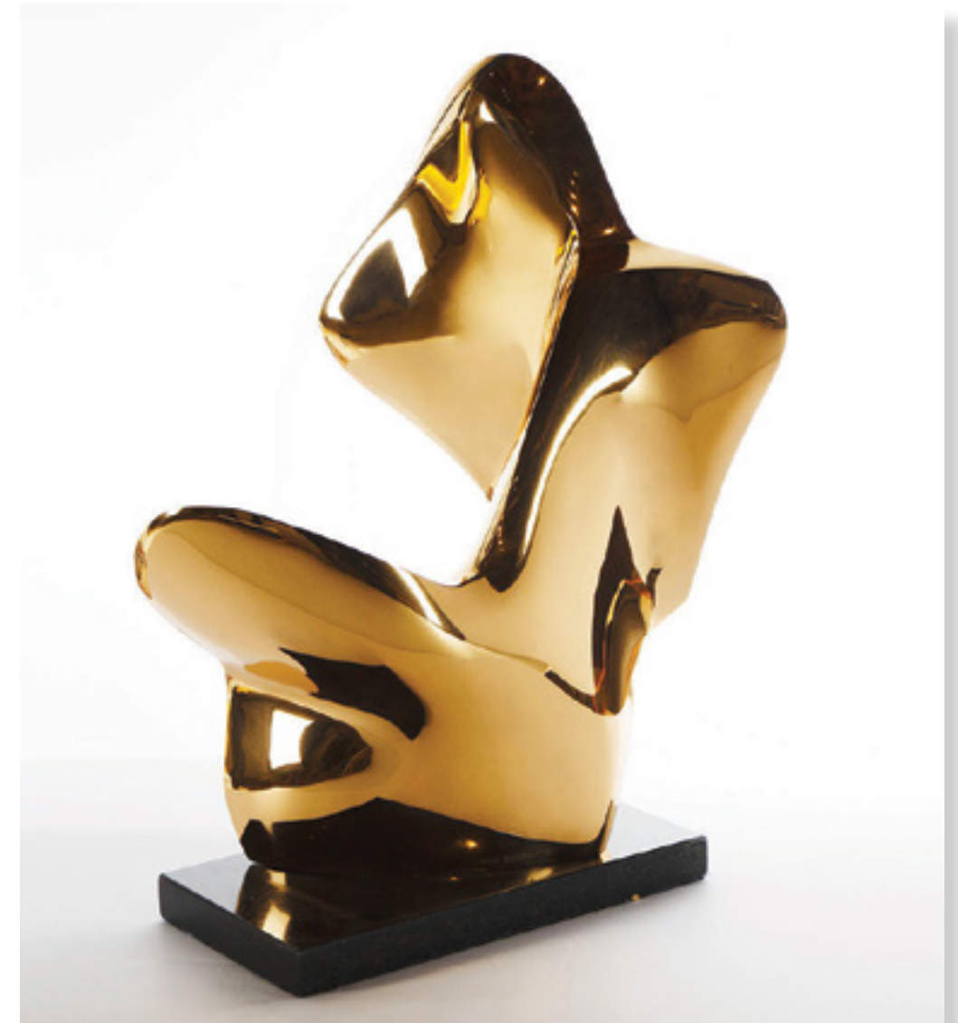
Seated Woman, 2/6 Edition, 1985 Polished Bronze 20 x 12 x 13 Inches FG©139090