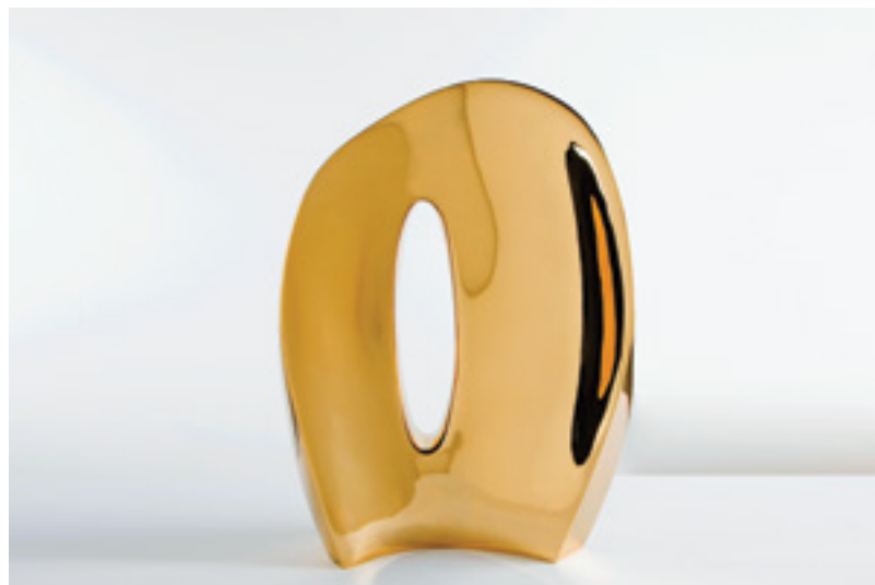
Lei, 1/6 Edition, 2017 Polished Bronze 16 x 11 x 4 Inches FG©139094