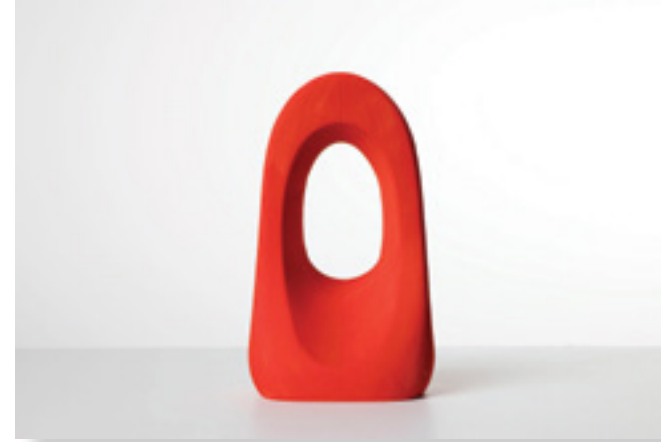
Rogue Wave, 2016 Red Paint Over Wood 12 x 8 x 3 1 / 2 Inches FG©139082