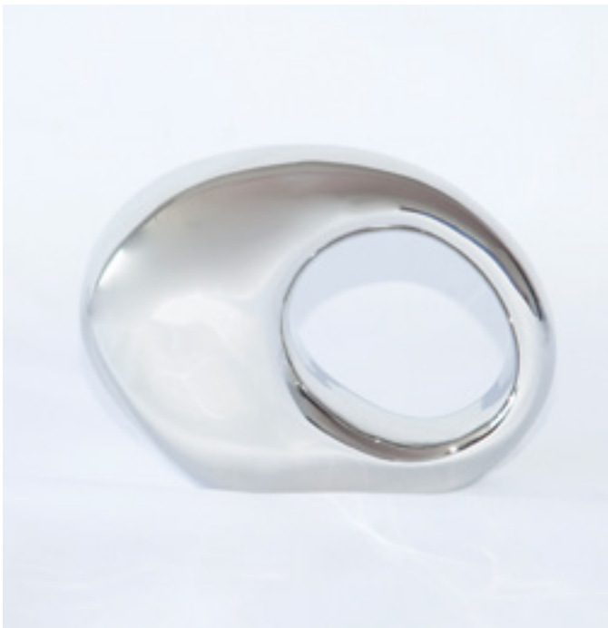
Apple, 1/6 Edition, 2016 :: Mini Maquette Series. Polished Nickel :: 4 x 5 x 2 1/2 Inches :: FG©139107