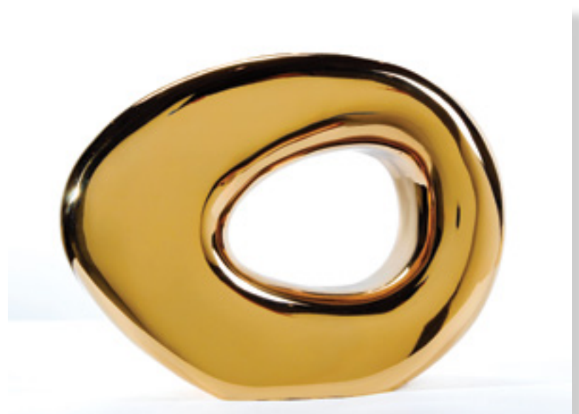
Eye I, 1/6 Edition, 2013 Polished Bronze 10 1/2 x 8 x 3 1/2 Inches FG©139099