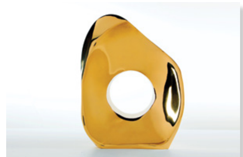
Lui, 3/6 Edition, 2017 Polished Bronze 15 x 10 1/2 x 5 1/2 Inches FG©139095