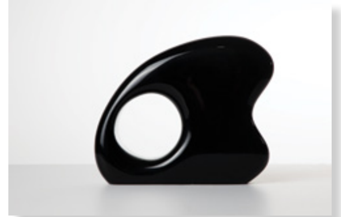
Ghost, 2016 Black Lucite 6 1 / 2 x 8 x 2 Inches FG©139084