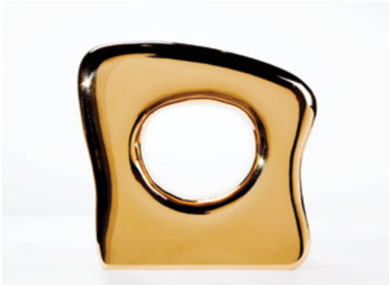
Bone Form, 4/6 Edition, 2010 Polished Bronze 9 x 9 x 3 Inches FG©139098