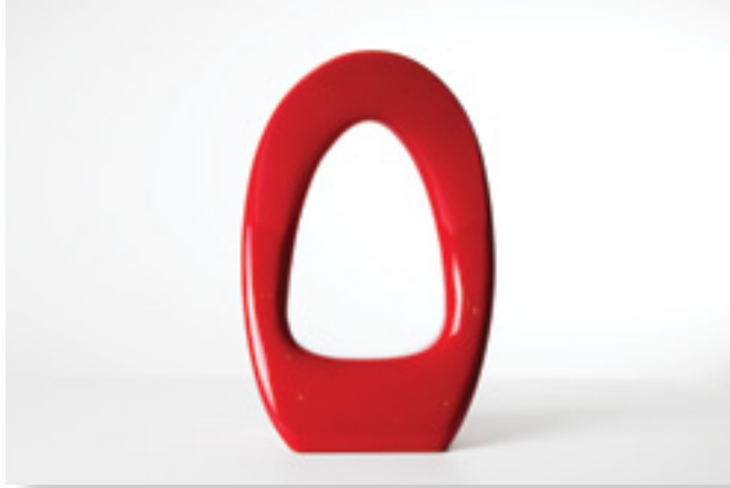
Curved Wave Form, 2013 Red Lacquer Over Wood 13 x 9 5 / 16 x 3 Inches FG©139081