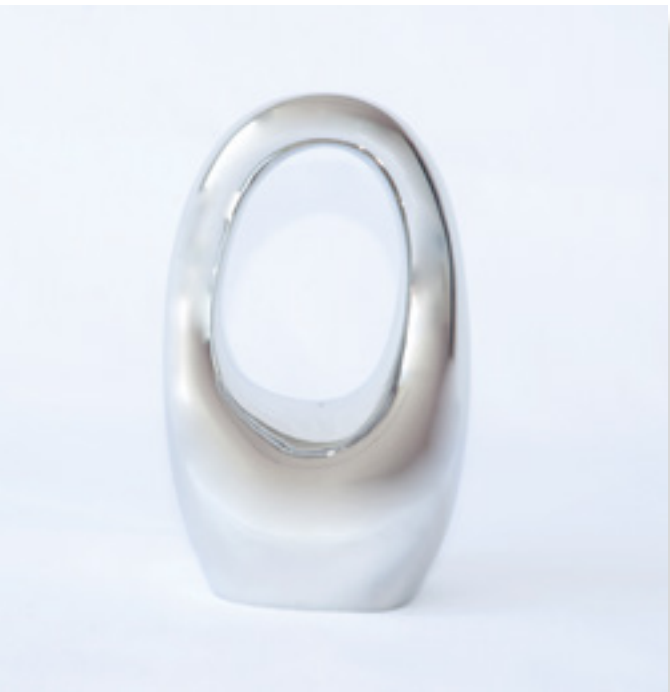
Egg Plomb, 1/6 Edition, 2014 :: Mini Maquette Series. Polished Nickel :: 6 x 5 x 2 1/2 Inches :: FG©139108