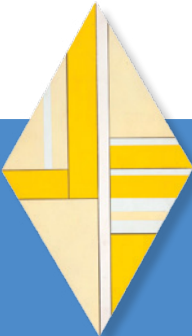
Ilya Bolotowsky • Rhomb , Pale Yellow, Blue and White, 1976 • Acrylic on Wood • 15 1/2 x 8 7/8 Inches • FG©137893