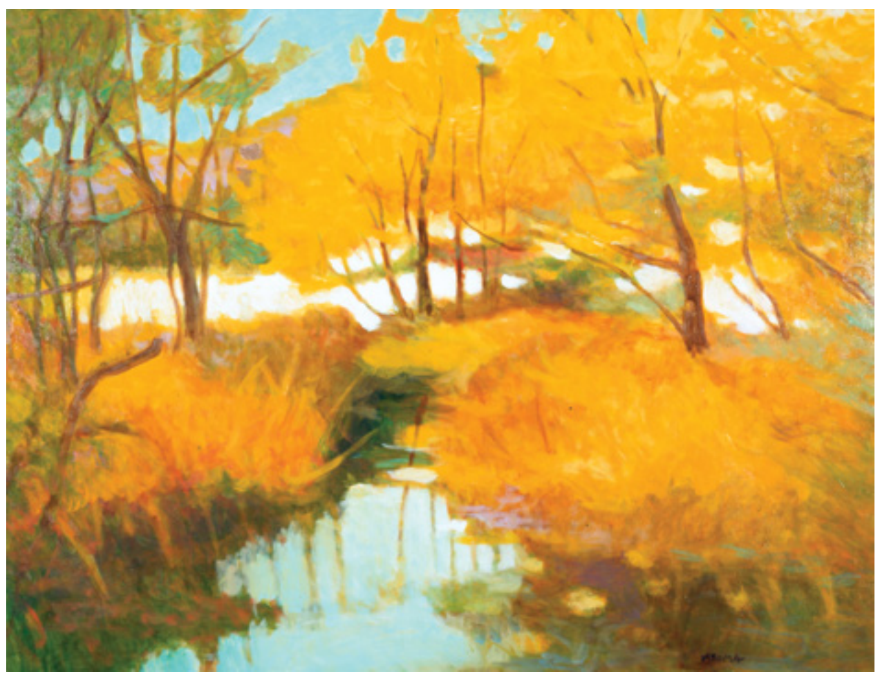
Tadashi Asoma • Yellow Rhapsody • Oil on Canvas • 44 7 / 8 x 57 1 / 2 Inches • FG©132994