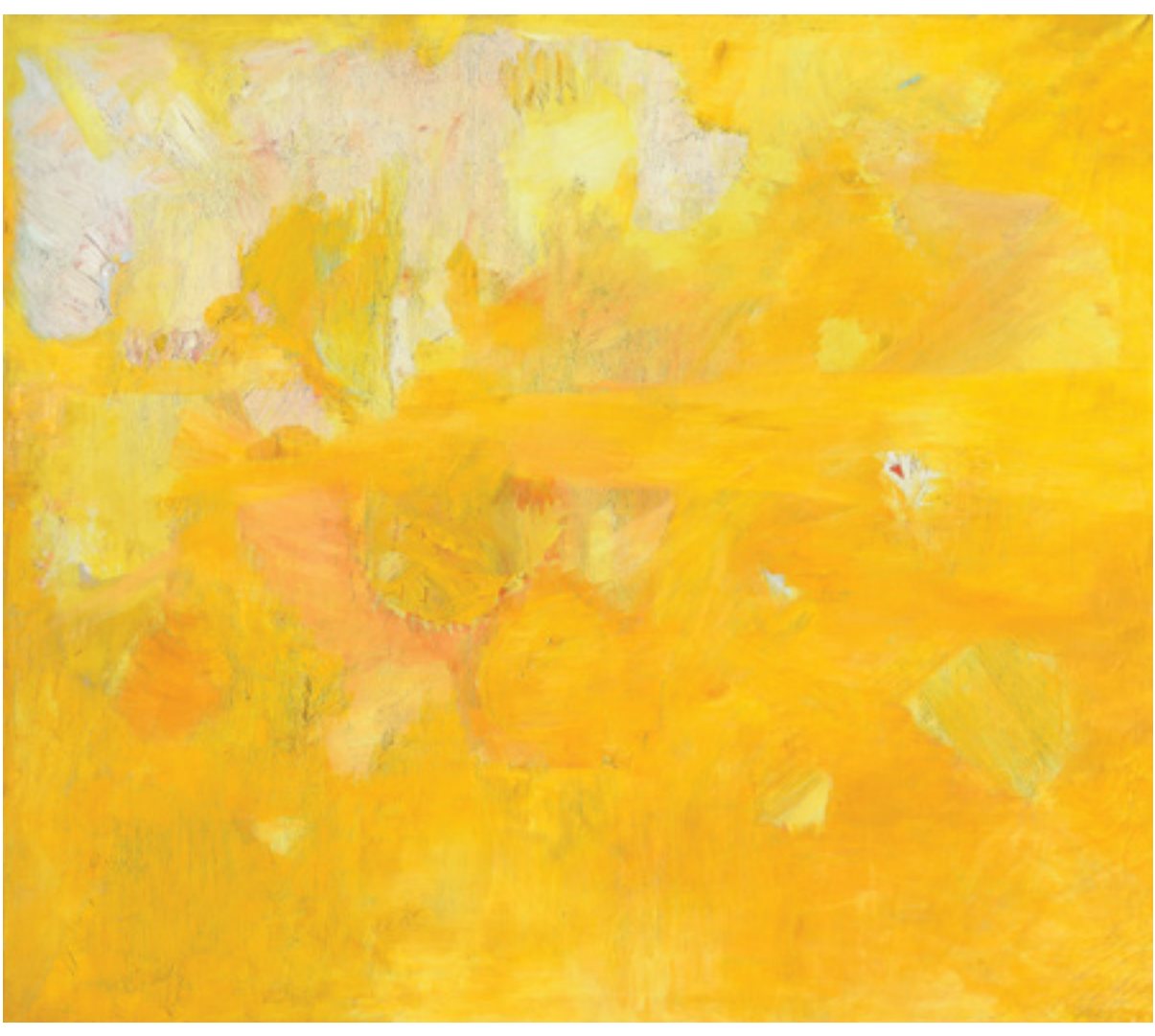
John Grillo • Hades , 1962 • Oil on Canvas • 67 3/4 x 77 1/4 Inches • FG©207151