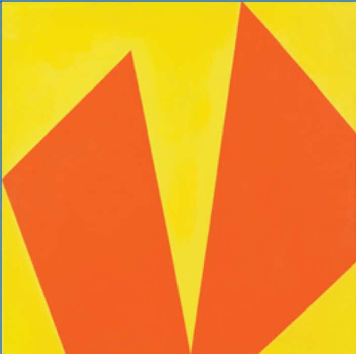
Ward Jackson • Volume II , c. 1973 • Acrylic on Canvas • 36 x 36 Inches • FG©137346