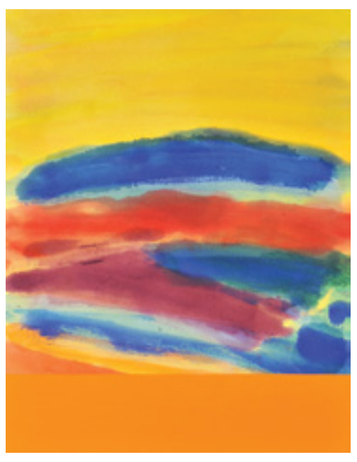
Ronnie Landfield • Dawning Light 4 , 2008 • Acrylic on Canvas 31 x 24 Inches • FG©137730