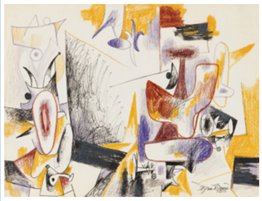
Byron Browne • Reef , 1953 • Conte Crayon, Watercolor Wash, India Ink • 20 x 26 Inches • FG©206446