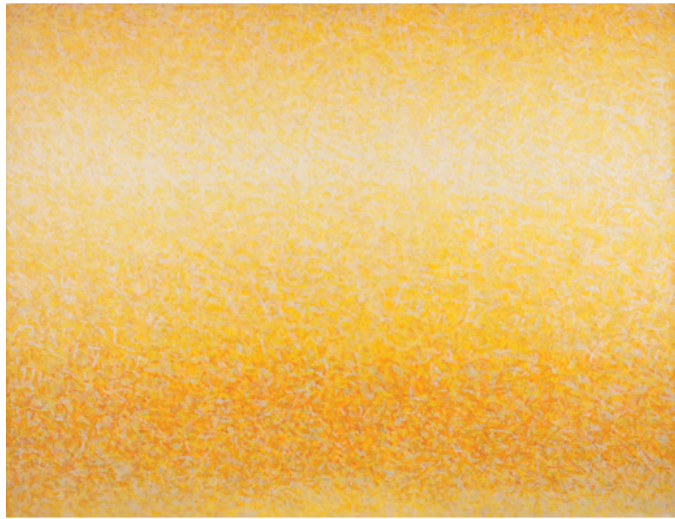
Leonard Nelson • Song of the Sun , 1979 • Oil and Acrylic on Canvas • 60 x 78 Inches • FG©133397