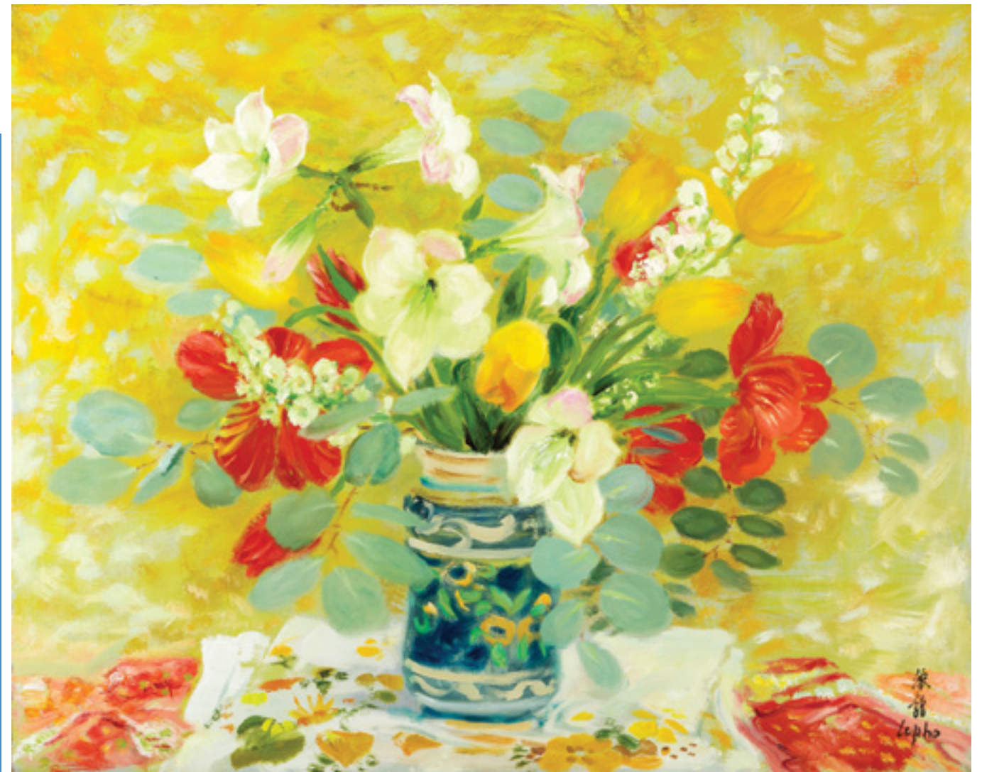
Le Pho • Les Tulipes et les Anthuriums , 1977 • Oil on Canvas • 31 7/8 x 39 3/8 Inches • FG©134200

One should consult a master of the palette, John Grillo, to truly gain an understanding of yellow's singularity. He once quipped, "Why do I use yellow? For one thing I feel the canvas expands - there is somehow more light and atmosphere, at least for me now, in the use of yellow. I'm concerned with space, atmosphere, and light - but to capture these phenomena and transform them into a work of art is a strange process. It could be magic, faith, or almost anything you want to call it. I have the canvas before me and I consciously choose primary colors - red, yellow, blue. After hours, days, or weeks, the painting becomes essentially yellow." As you regard his thoughts on atmosphere and