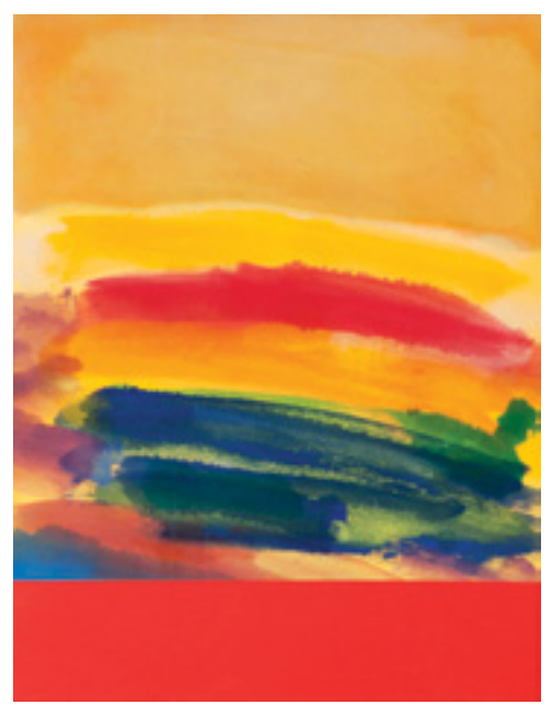
Ronnie Landfield • Dawning Light 6 , 2010 • Acrylic on Canvas 31 x 24 Inches • FG©137729