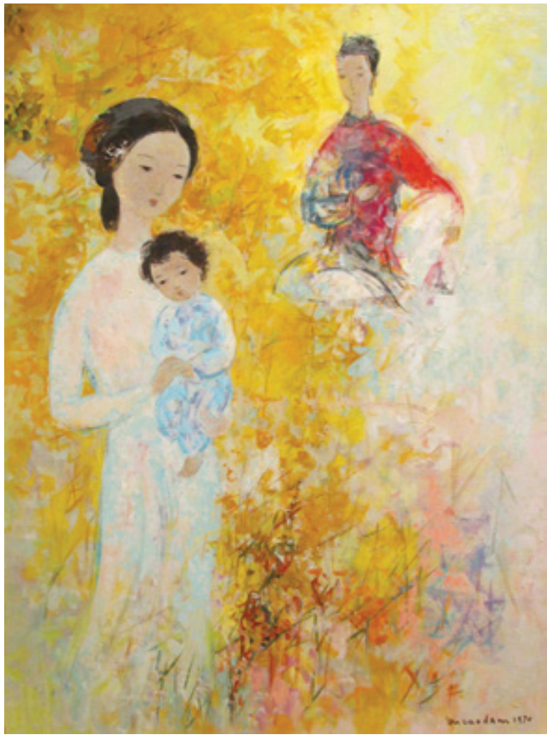
Vu Cao Dam • Composition • Oil on Canvas • 24 x 18 1/8 Inches • FG©136662