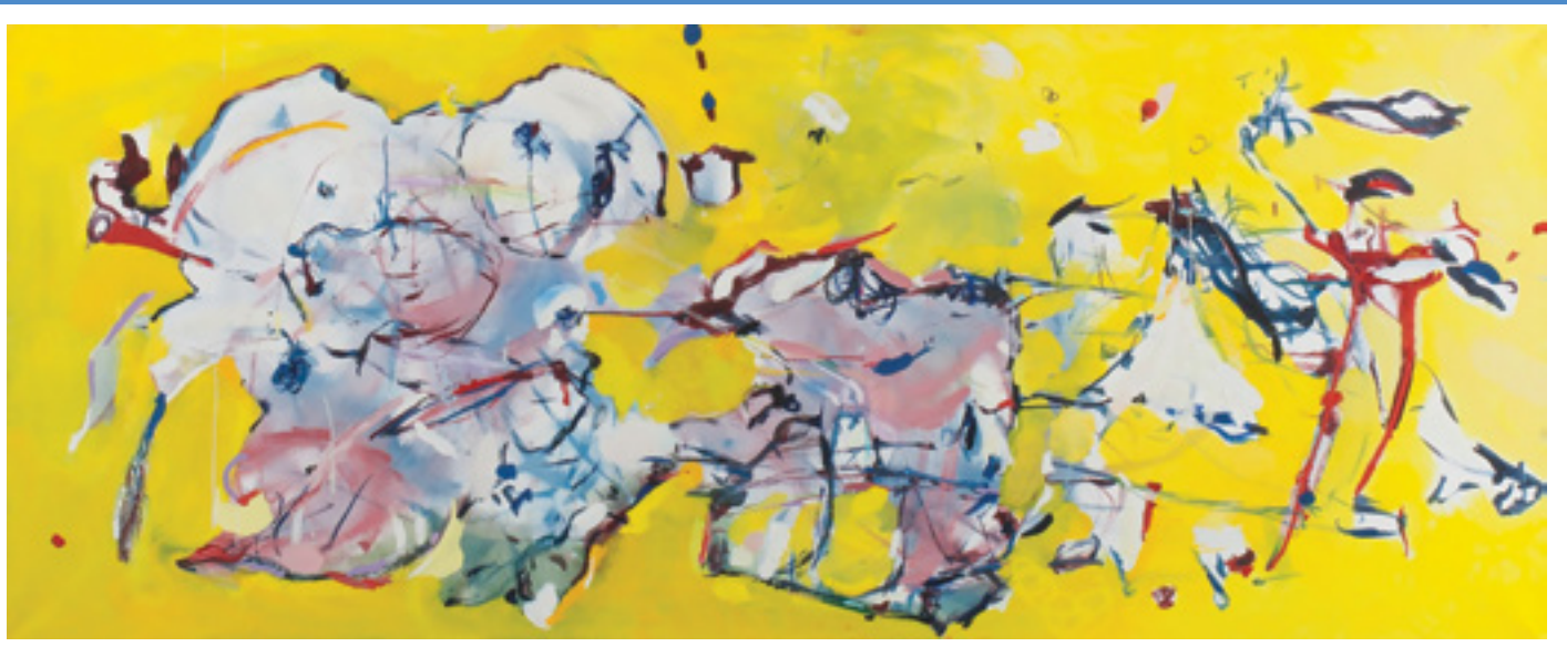
Priscilla Heine • Visitar el Jardin , 2017 • Oil on Linen • 32 x 80 Inches • FG©138517