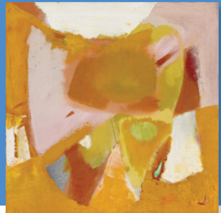
John Grillo • Untitled 29 , 1964 • Oil on Canvas 20 x 20 Inches • FG©206410

Each painting in this exhibition is a venture in creativity and courage, meant to inspire and light a fire within the viewer. Painting is challenging work, and to put one's ideas forth so boldly with what many would consider the most primary color is certainly noteworthy. We hope these luminous beings will arouse and inspire.