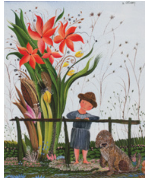
BOTTOM Annette Ollivary Petit Fermière Gouache on Paper 10 5/8 x 8 11/16 Inches FG©136674