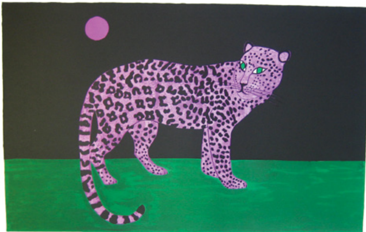
Poucette Panther Lithograph 30 x 22Inches FG©127829

Poucettes works capture costume parades, horse races and modern cabarets of post war France. Her paintings are works of decorative, childlike, and lighthearted nature and which relate to the viewers inner emotions and memories. Her works were widely collected by many in New York and around the globe, for example Marilyn Monroe and Zsa Zsa Gabor.