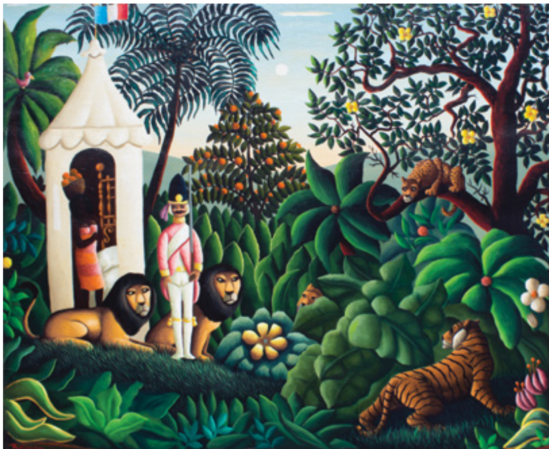
Orville Bulman • Garder vos Distances • Oil on Canvas • 30 1/4 x 36 1/4 Inches • FG©135616