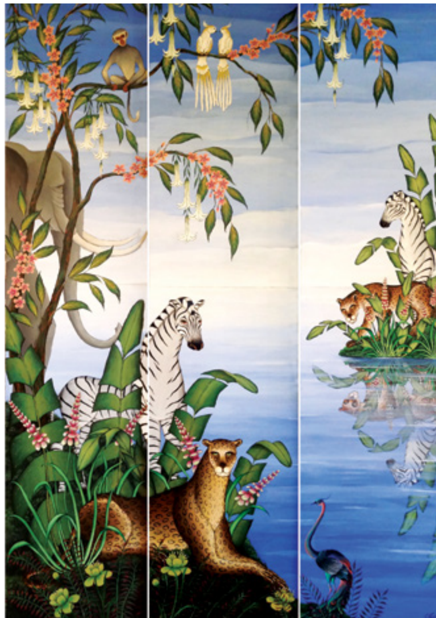
Gustavo Novoa • Reserved Paradise (Triptych) • Acrylic on Panel • 79 x 53 1/4 Inches • FG©136117

The Intruder Acrylic on Canvas 48 x 36 Inches FG©133748