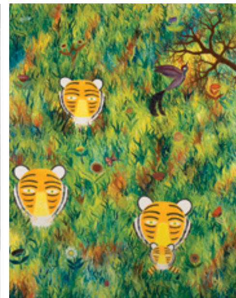
Henri Maïk • Marché dans les Hautes Herbes , 1971 Oil on Canvas • 57 1/2 x 44 7/8 Inches • FG©133033