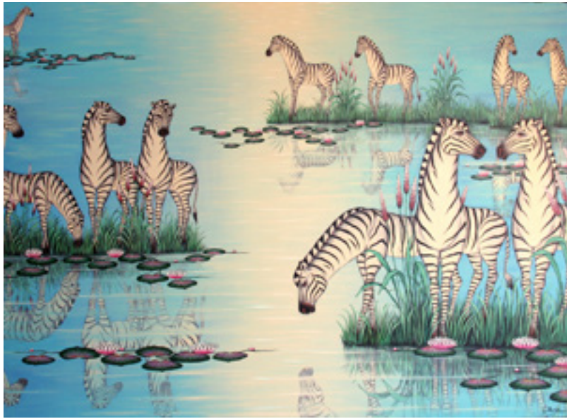
Gustavo Novoa • Zebra Lake • Acrylic on Canvas • 30 x 40 Inches • FG©133577