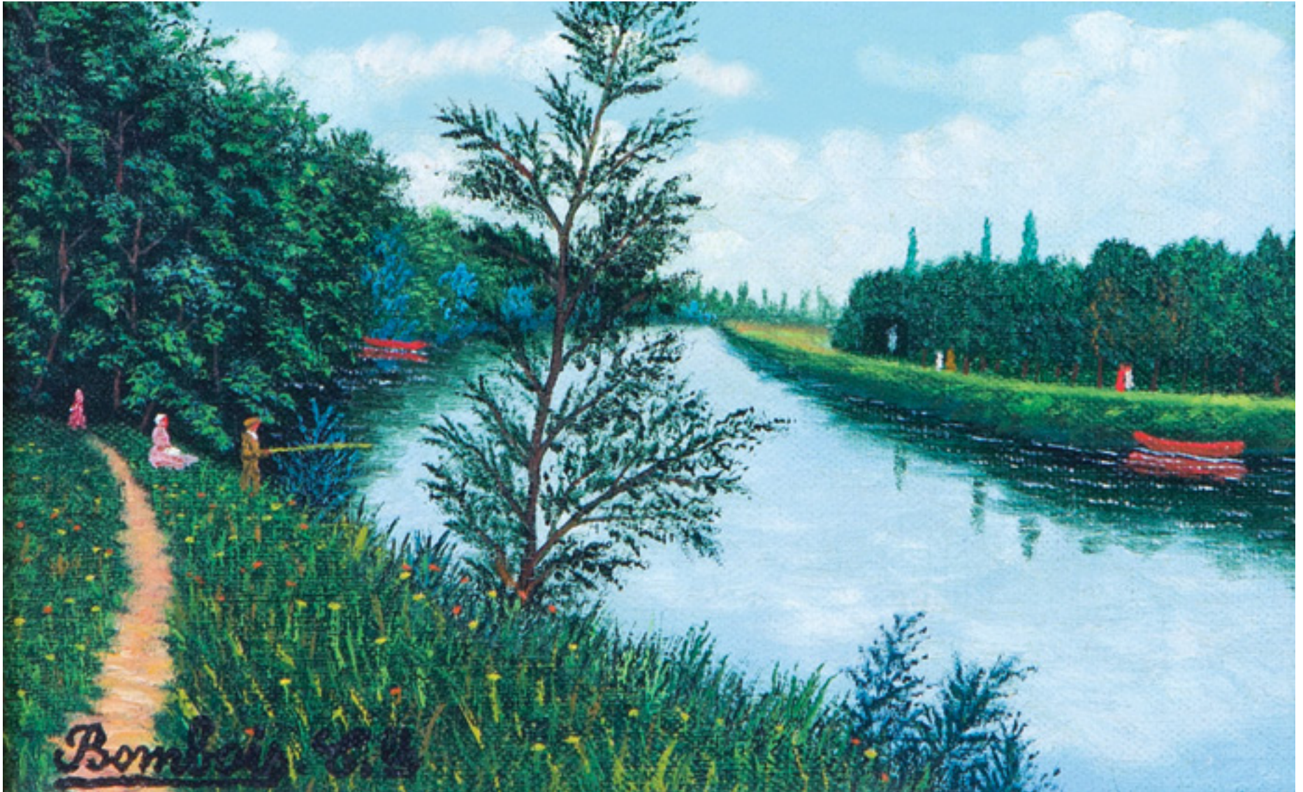
Camille Bombois • Pêcheur à la Rivière • Oil on Canvas • 6 5/16 x 8 11/16 Inches • FG©135279

Camille Bombois (1883 - 1970) was born in Venarey-les-Laumes, in the Côte-d'Or region of France. Bombois' early life was utterly different than what one would imagine an artist having. His childhood was spent on the canals of his birthplace on a barge owned by his father. His schooling was brief and when he was twelve years old he was sent to work as a farmhand. This fact only makes it all the more remarkable that he achieved such great distinction among France's important painters. The first indication of any interest in drawing or painting developed when he was sixteen. He began to draw scenes from his life as a shepherd and a worker in the fields. His self taught style gained Bombois an international reputation as a painter of the common man focused on nature and daily life in France. Bombois' work may be found in major museum collections the US and France.