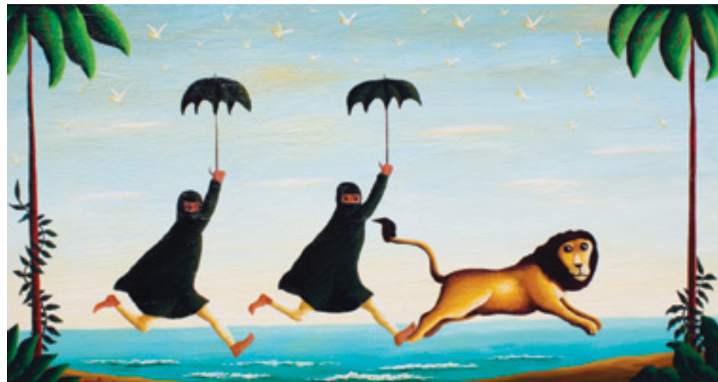
Orville Bulman Suivez le Premier Oil on Canvas 16 x 30 Inches FG©135343