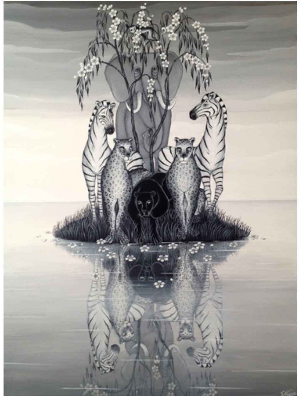
Gustavo Novoa • Photo Pose • Acrylic on Canvas • 40 x 30 Inches • FG©134839