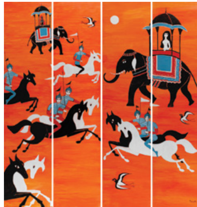
Poucette • La Parade • Oil on Panel (4 panel screen) • 75 x 71 1/2 Inches • FG©51144