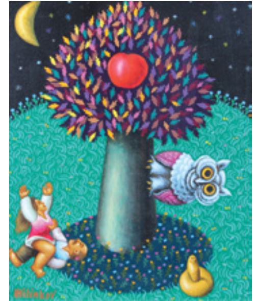
Ljubomir Milinkov • Le Grand Duc Tamoin • Oil on Canvas • 10 5/8 x 8 11/16 Inches • FG©108300