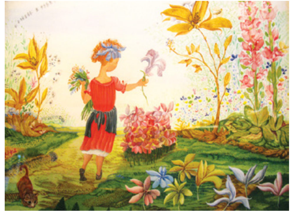
TOP Annette Ollivary La Cueillette des Fleurs, 1980 Gouache 9 7/8 x 11 3/4 Inches FG©134180