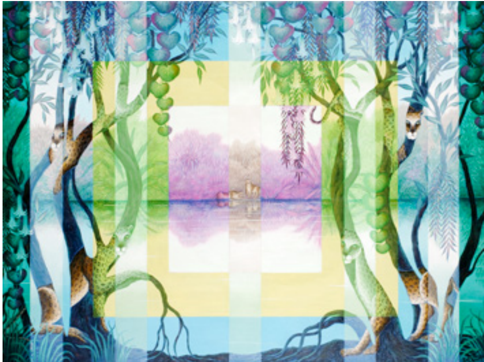
Gustavo Novoa • Virtual Forest • Acrylic on Canvas • 36 x 48 Inches • FG©129307