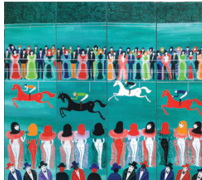
Poucette • Longchamps • Oil on Panel (4 panel screen) • 70 3/8 x 78 1/4 Inches • FG©47267