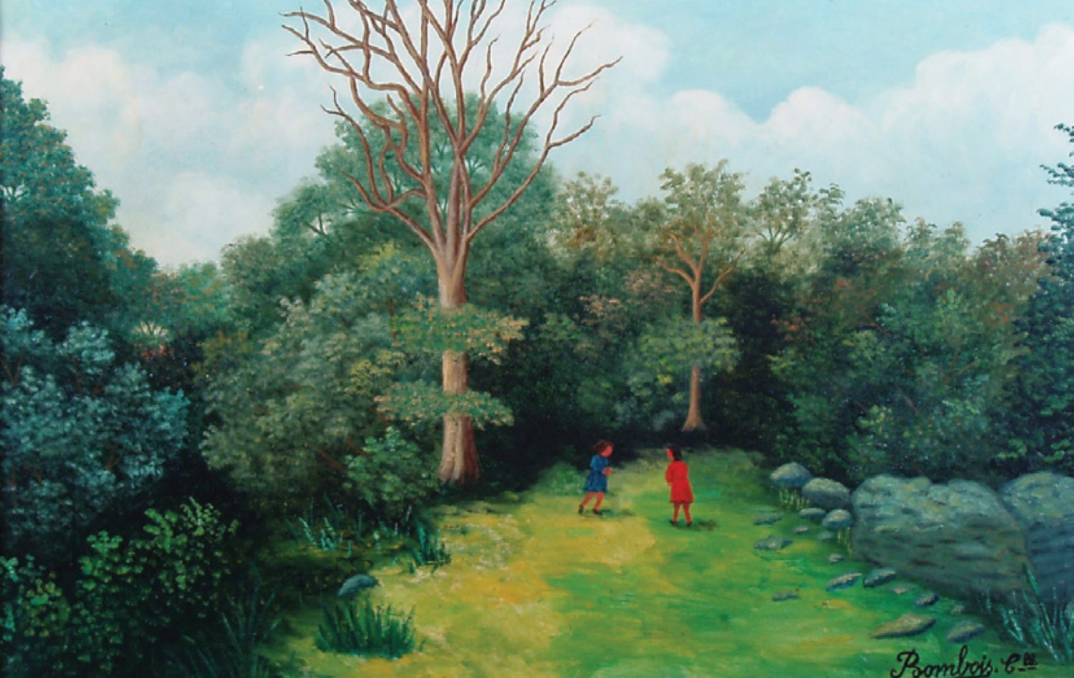
Camille Bombois • Fillettes dans la Clairière • Oil on Masonite • 10 5/8 x 16 1/8 Inches • FG©131365