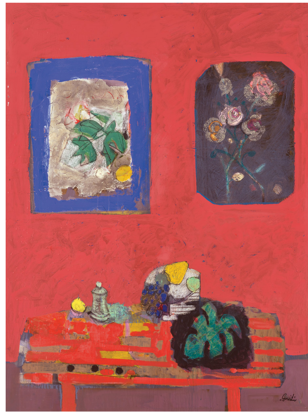
FOND ROUGE Mixed Media on Canvas • 51 3 / 16 x 38 3 / 16 Inches • FG136531