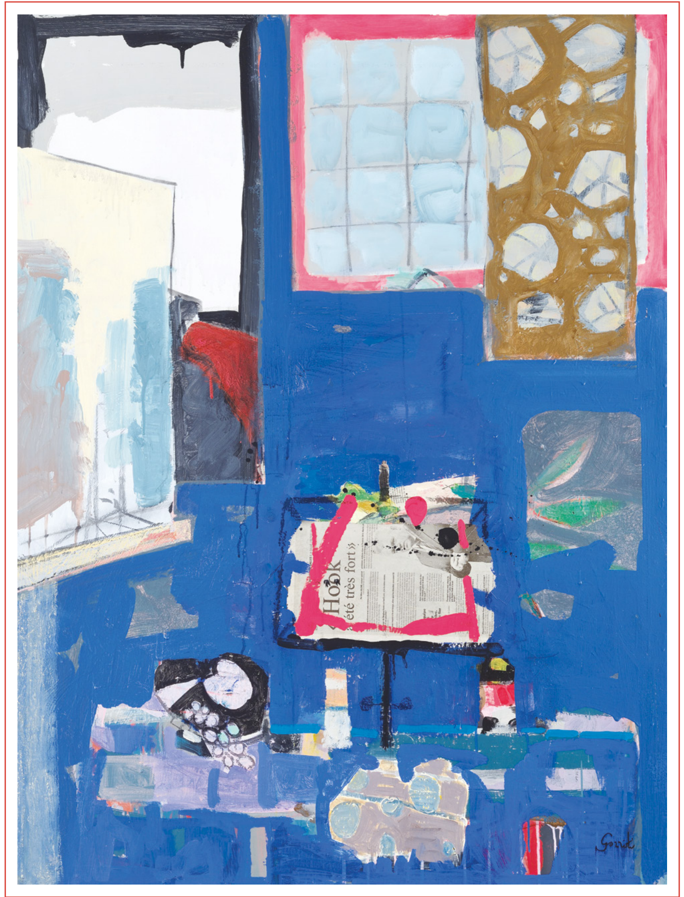
LUTRIN Mixed Media on Canvas • 51 3/16 x 38 3/16 Inches • FG136530