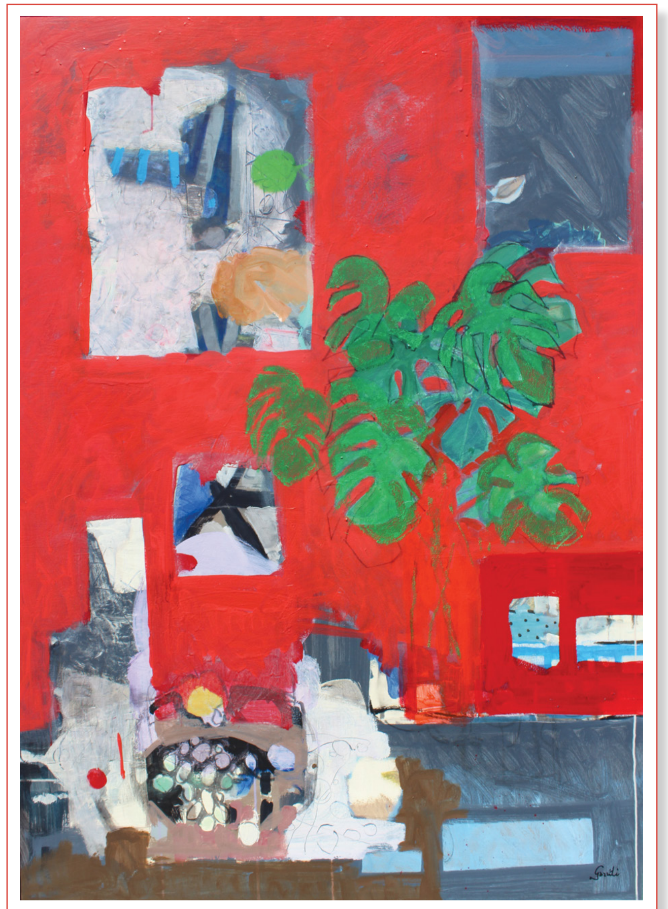
LA PLANTE VERTE Mixed Media on Canvas • 63 3 / 4 x 51 3 / 16 • FG136267