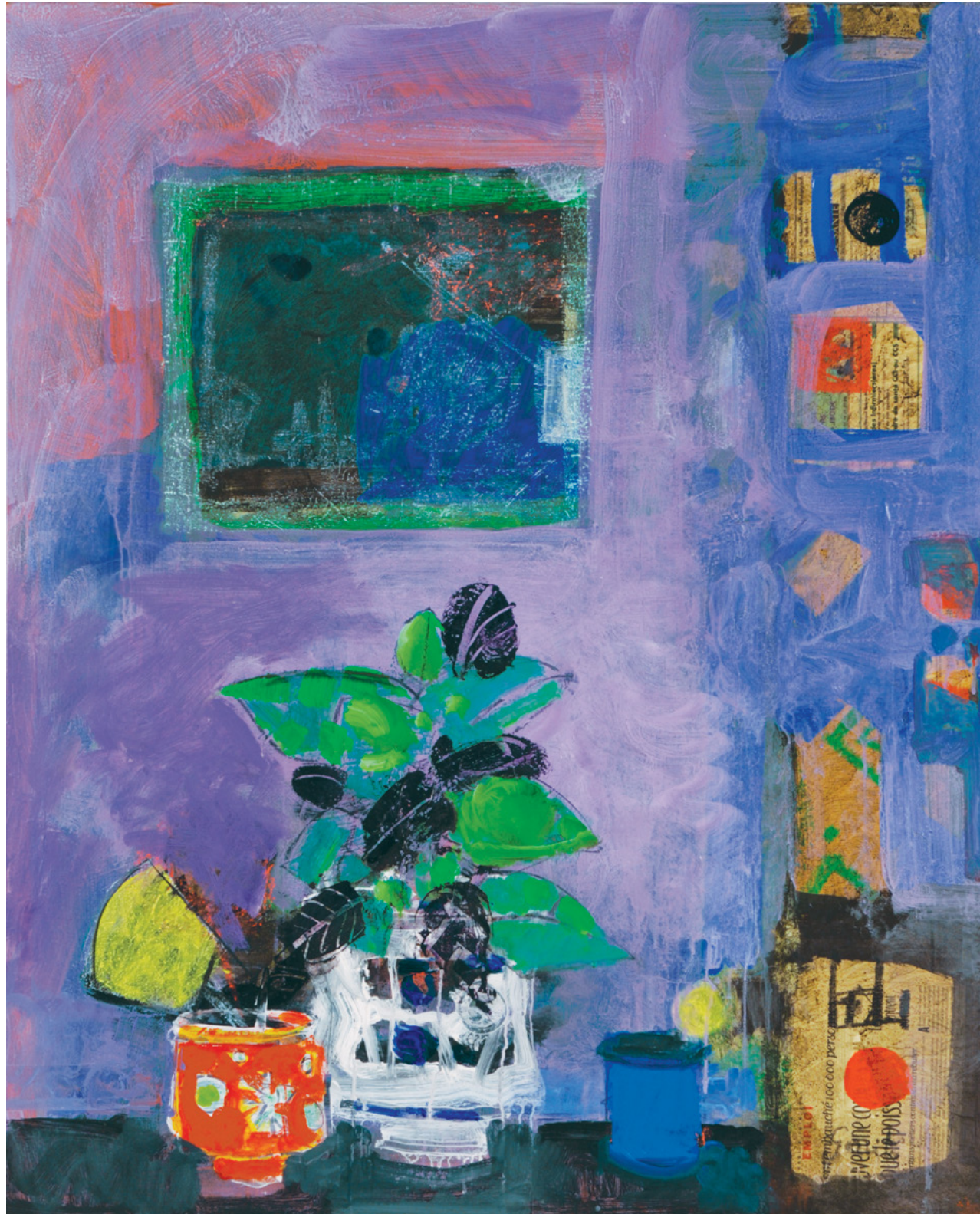
LA PLANTE VERTE Mixed Media on Canvas • 39 3 / 8 x 31 7 / 8 Inches • FG132202