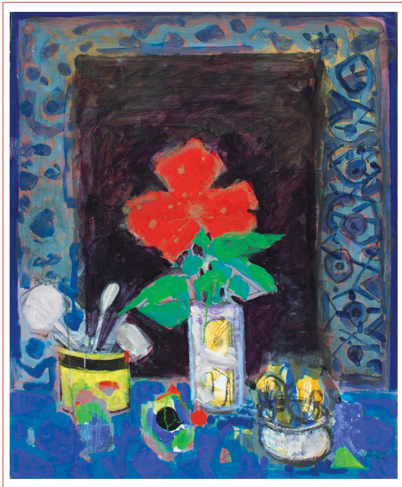
LA FLEUR ROUGE Oil on Canvas • 39 3 / 8 x 31 7 / 8 Inches • FG132198