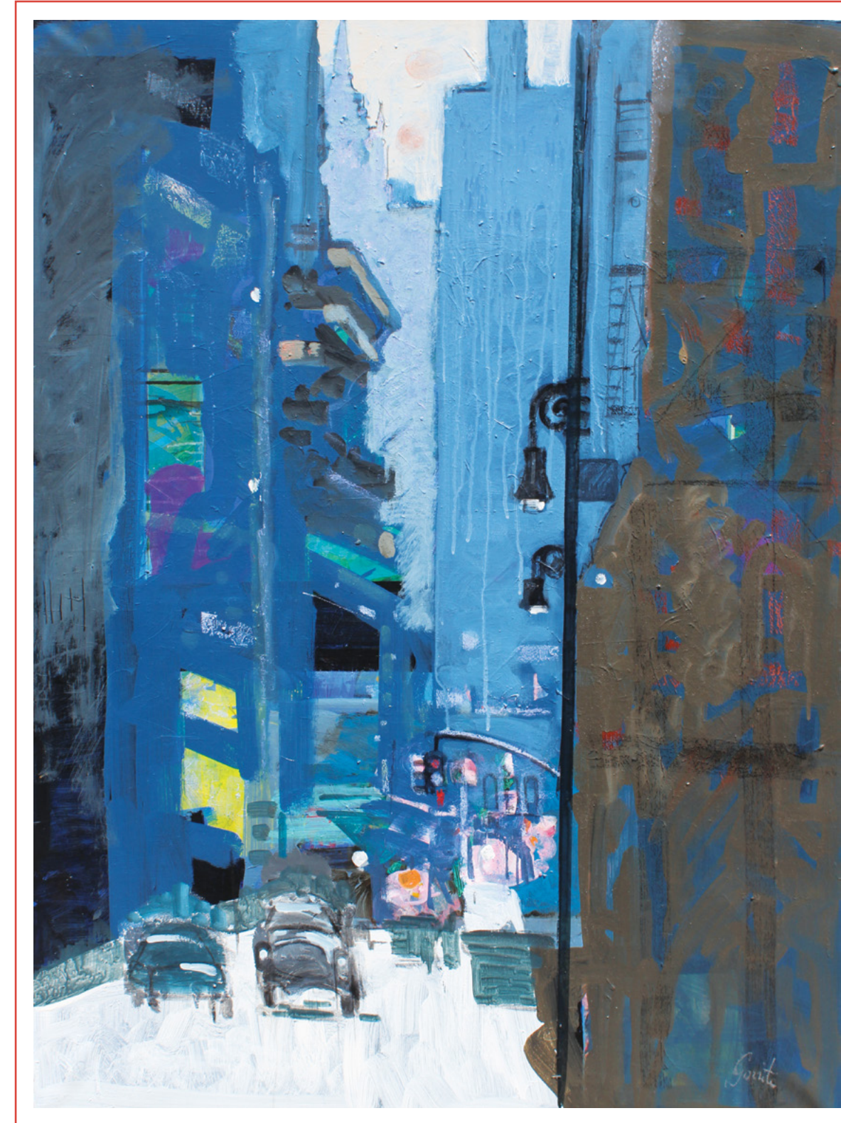
NEW YORK Mixed Media on Canvas • 51 3 / 16 x 38 3 / 16 Inches • FG134860