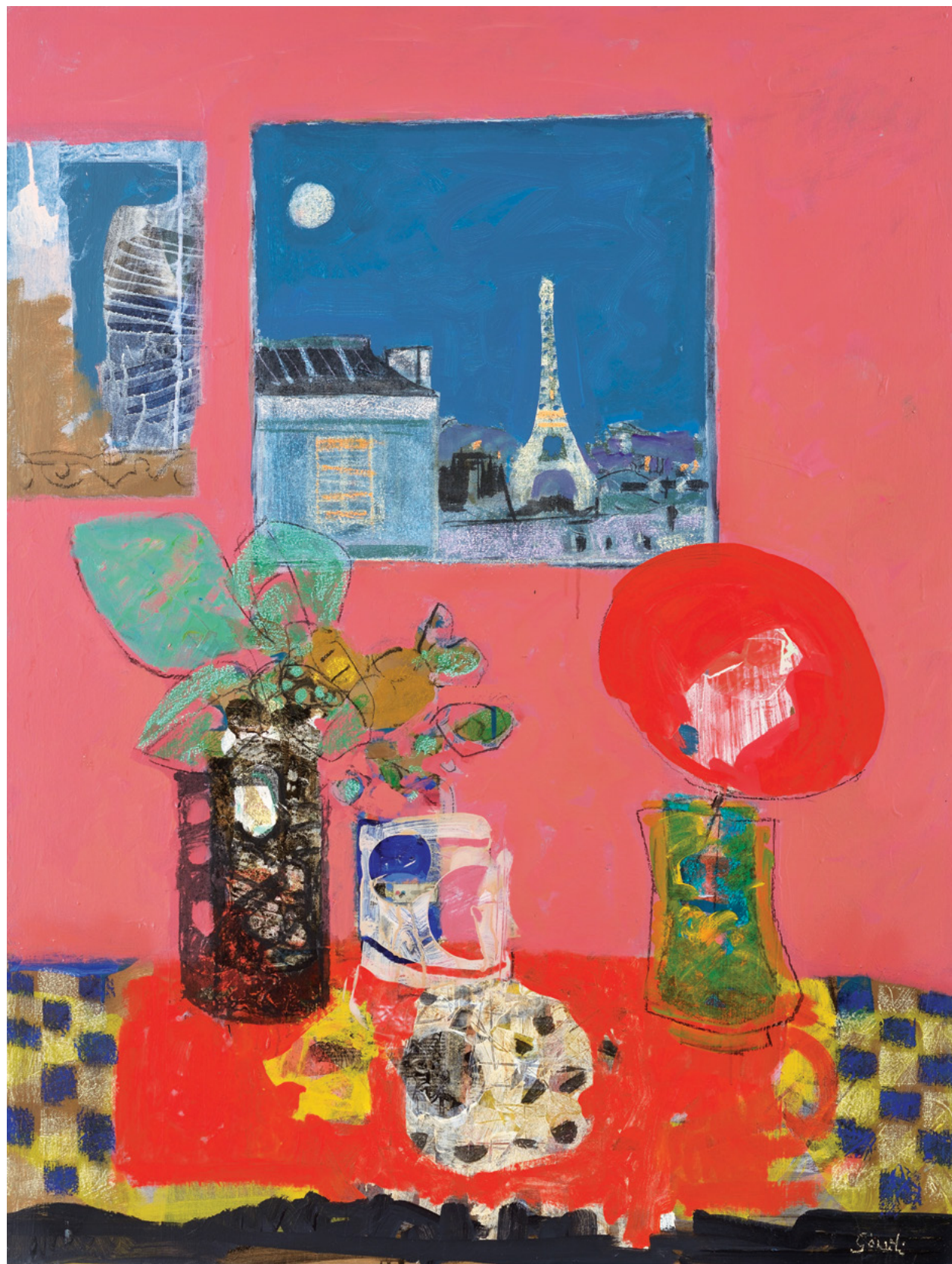
L'ÉVENTAIL Mixed Media on Canvas • 45 11 / 16 x 35 1 / 16 Inches • FG136536