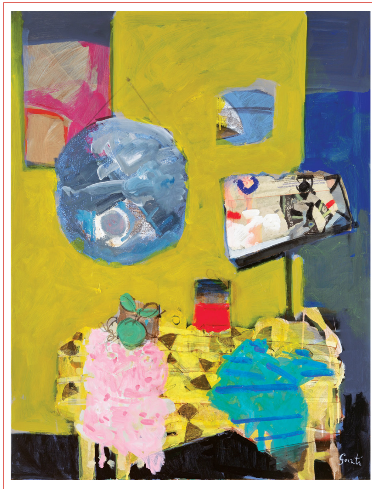
FOND JAUNE Mixed Media on Canvas • 45 11 / 16 x 35 1 / 16 Inches • FG135509