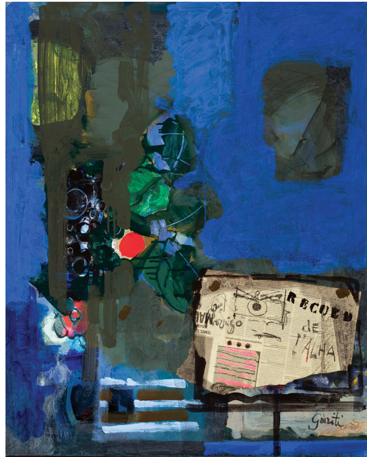
LA PARTITION Mixed Media on Canvas • 39 3 / 8 x 31 7 / 8 Inches • FG133325