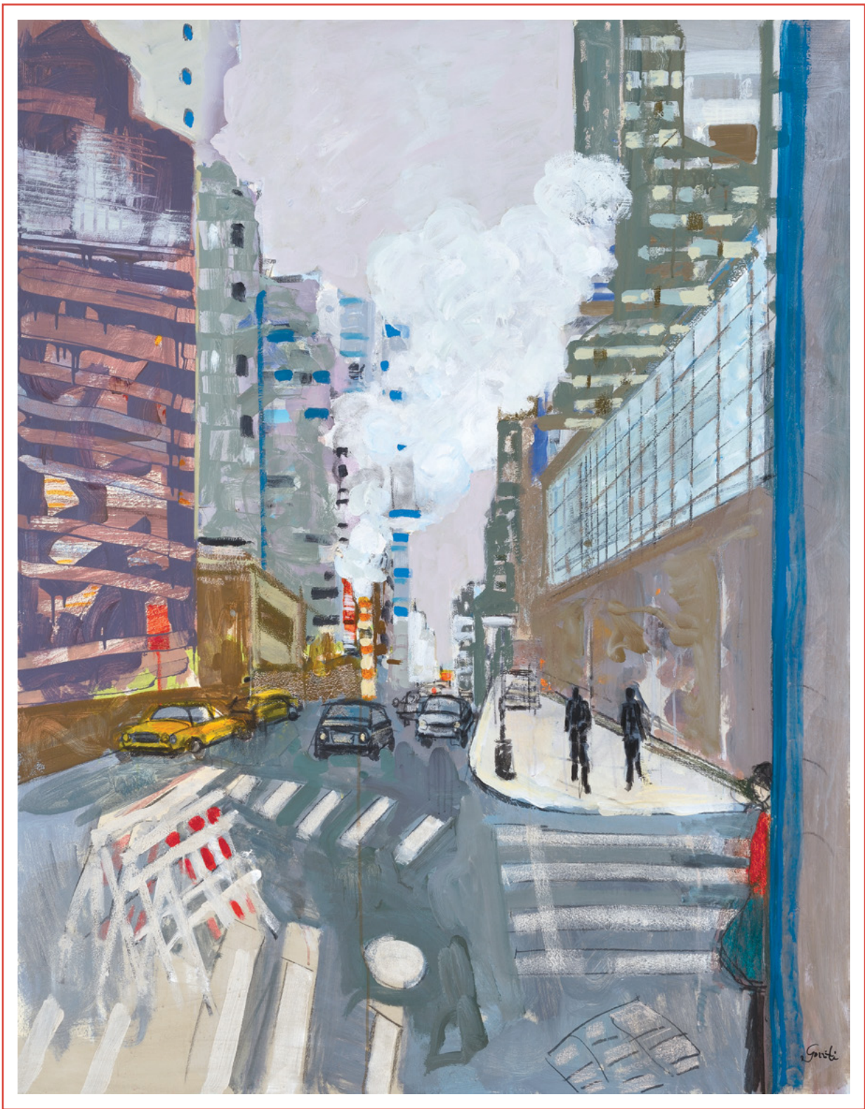
MANHATTAN III Mixed Media on Canvas • 57 1 / 2 x 44 7 / 8 Inches • FG136527