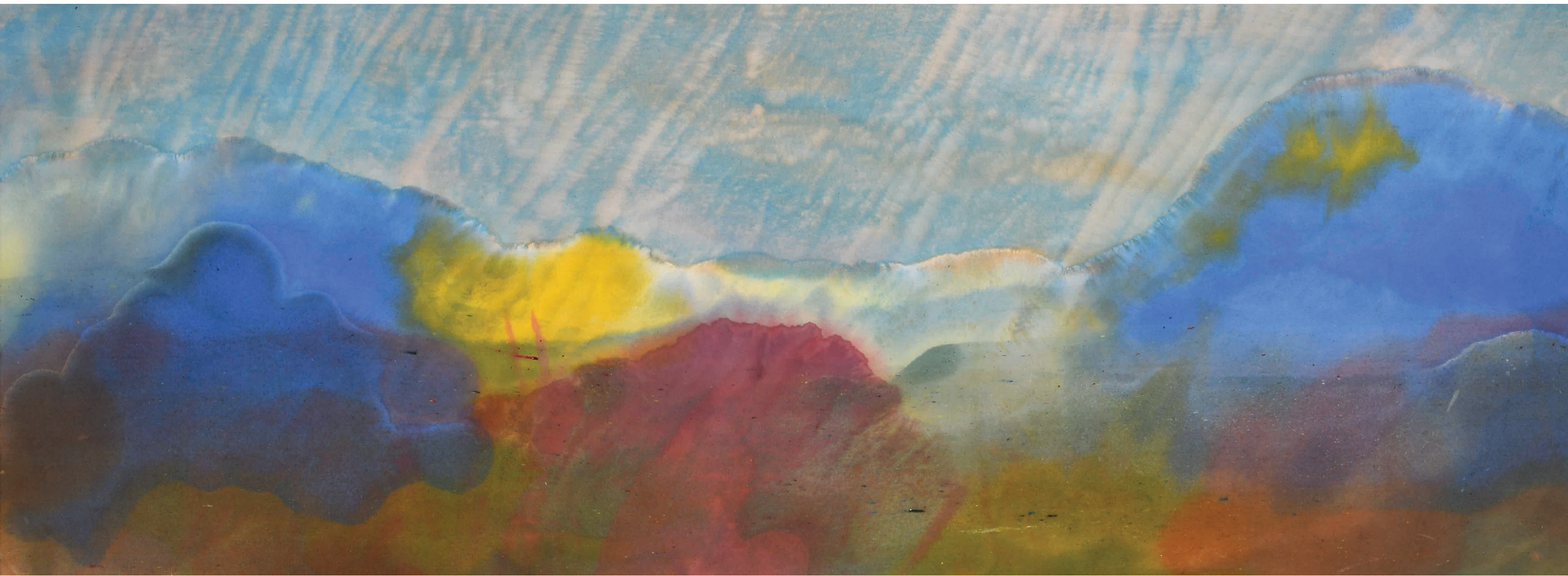
NEW DAY, 2017 | ACRYLIC/CANVAS | 25 X 68 INCHES | FG© 138368