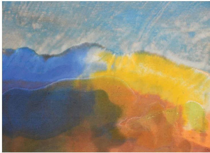
SUMMER'S END, 2017 ACRYLIC/CANVAS 25 X 39 INCHES FG© 138363