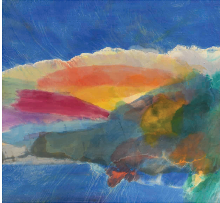
ALL ACROSS THE WORLD, 2017 ACRYLIC/CANVAS 91 X 99 INCHES FG© 138364