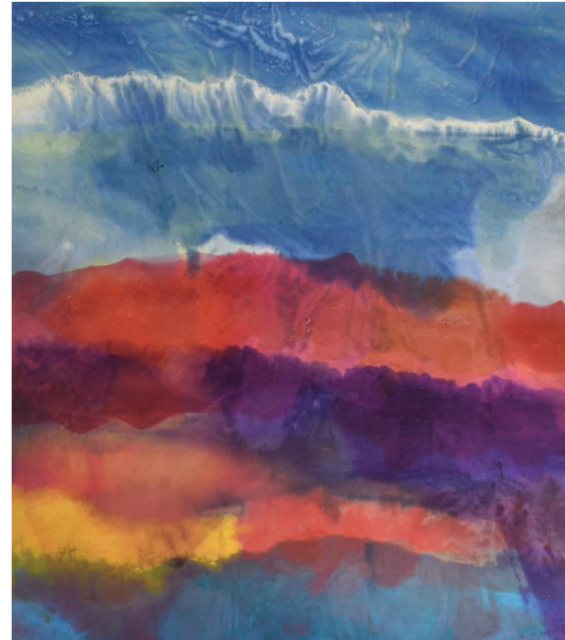
RISING TIDE, 2017 ACRYLIC/CANVAS 91 X 79 1/2 INCHES FG© 138367