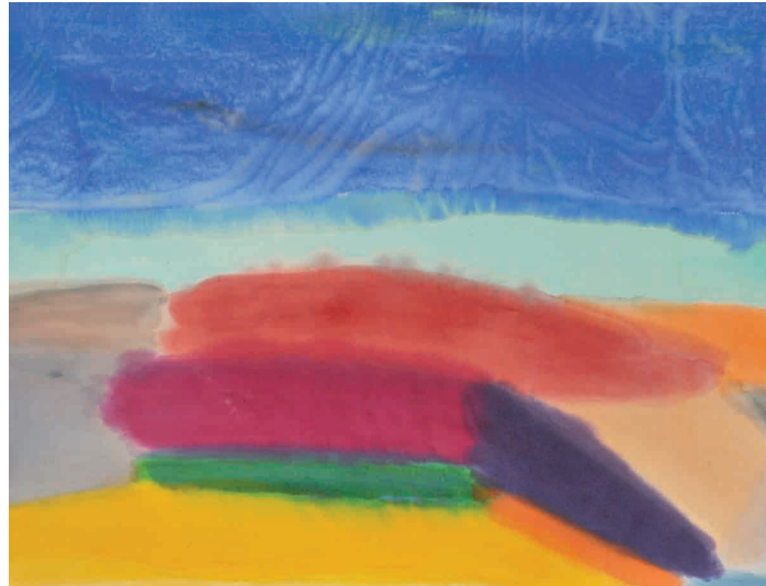
ONE OF THESE DAYS, 2017 ACRYLIC/CANVAS 48 X 62 INCHES FG© 138344