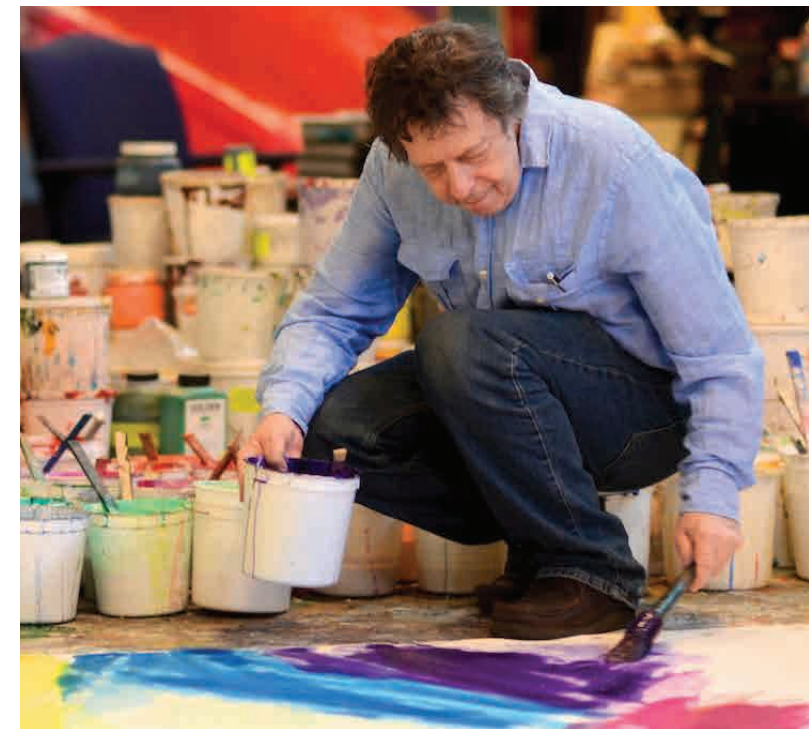
New York, 2012