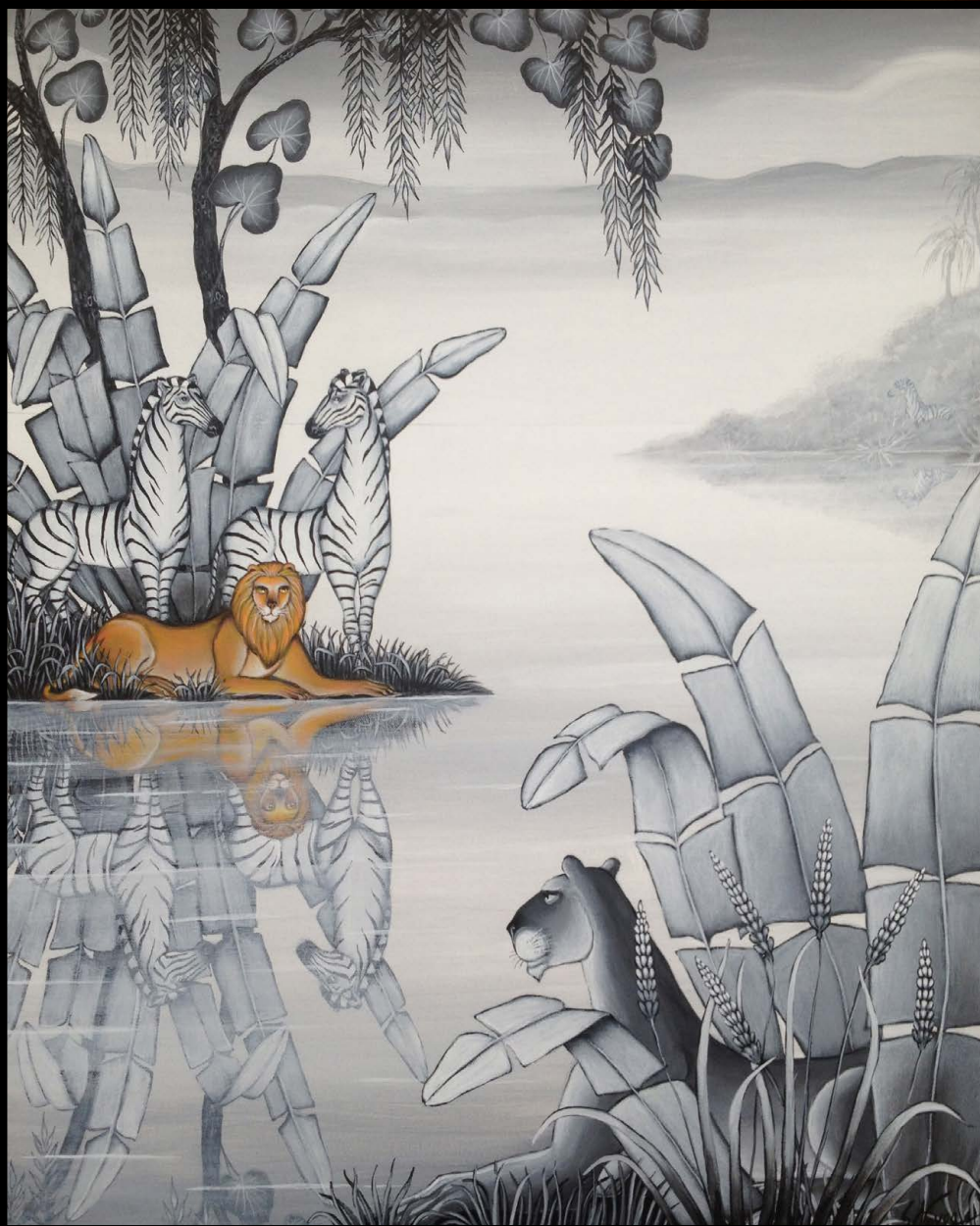
The Other Side I | acrylic on canvas | 30 x 24 inches