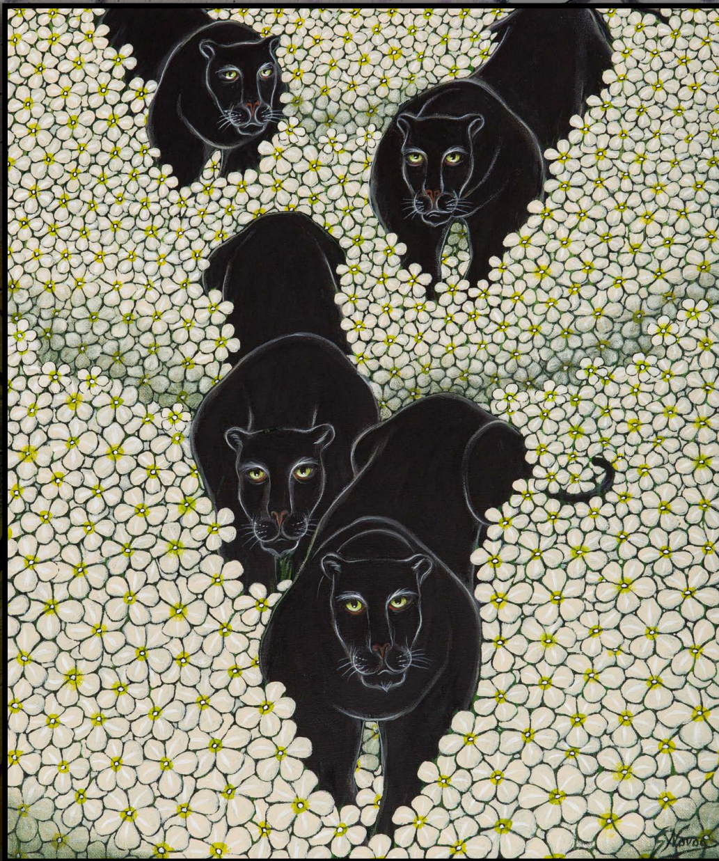
The Formation | acrylic on canvas | 24 x 20 inches