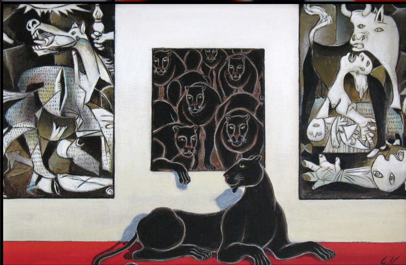
Black & White Drama | acrylic on canvas | 8 x 12 inches