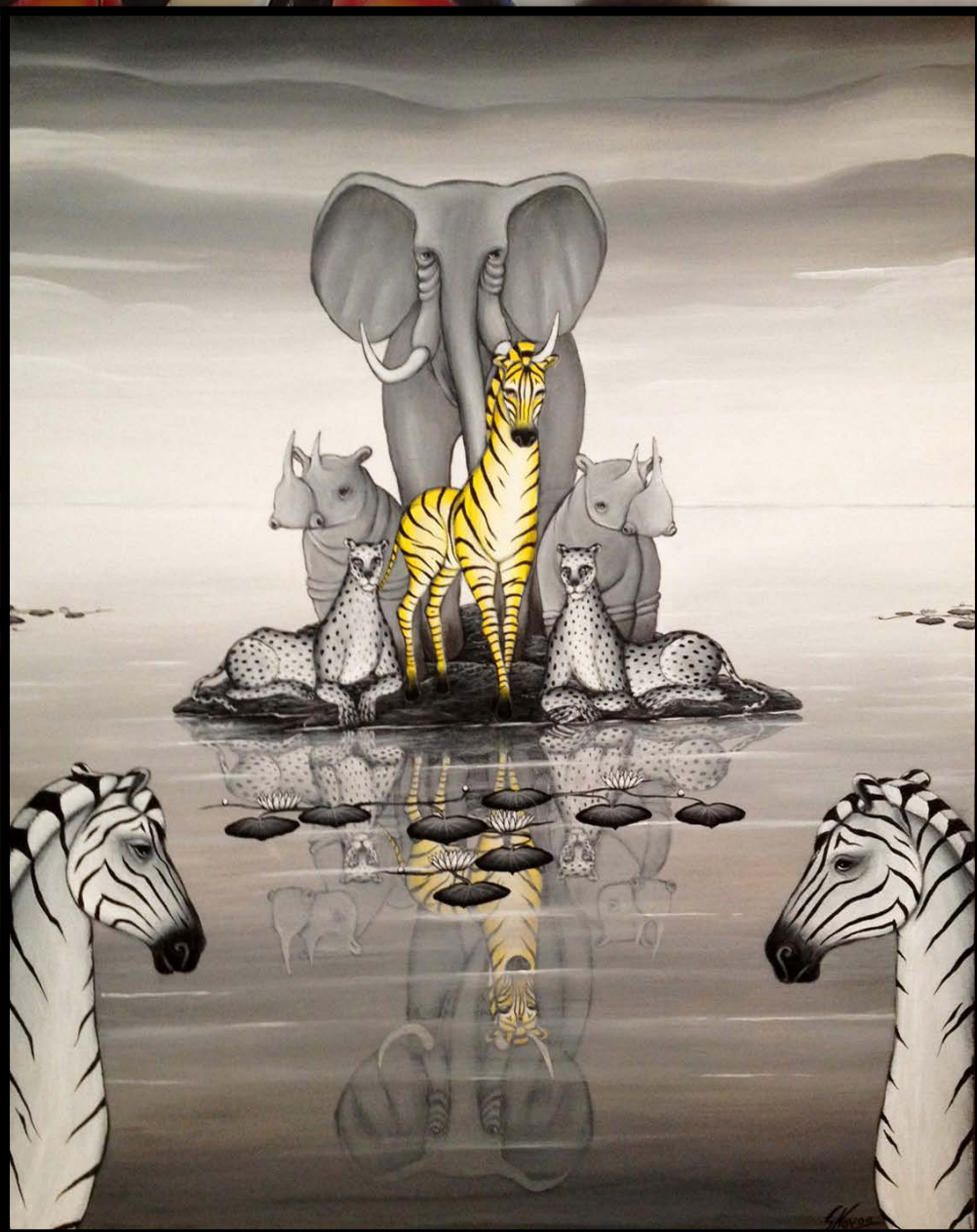
Yellow Mirage | acrylic on canvas | 30 x 24 inches