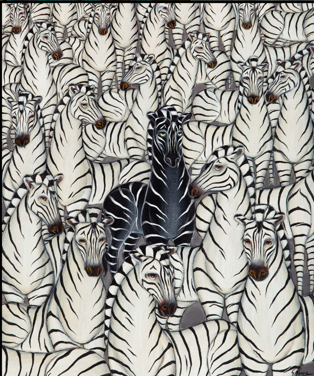
Why Me II | acrylic on canvas | 24 x 20 inches