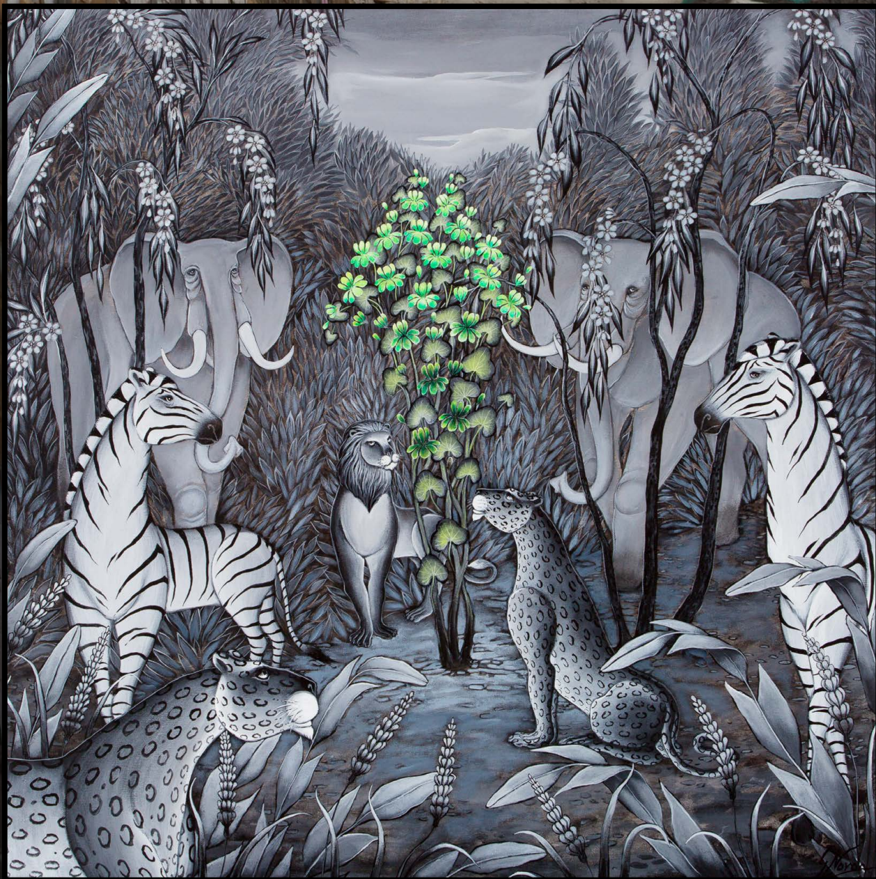
Full Bloom | acrylic on canvas | 36 x 36 inches