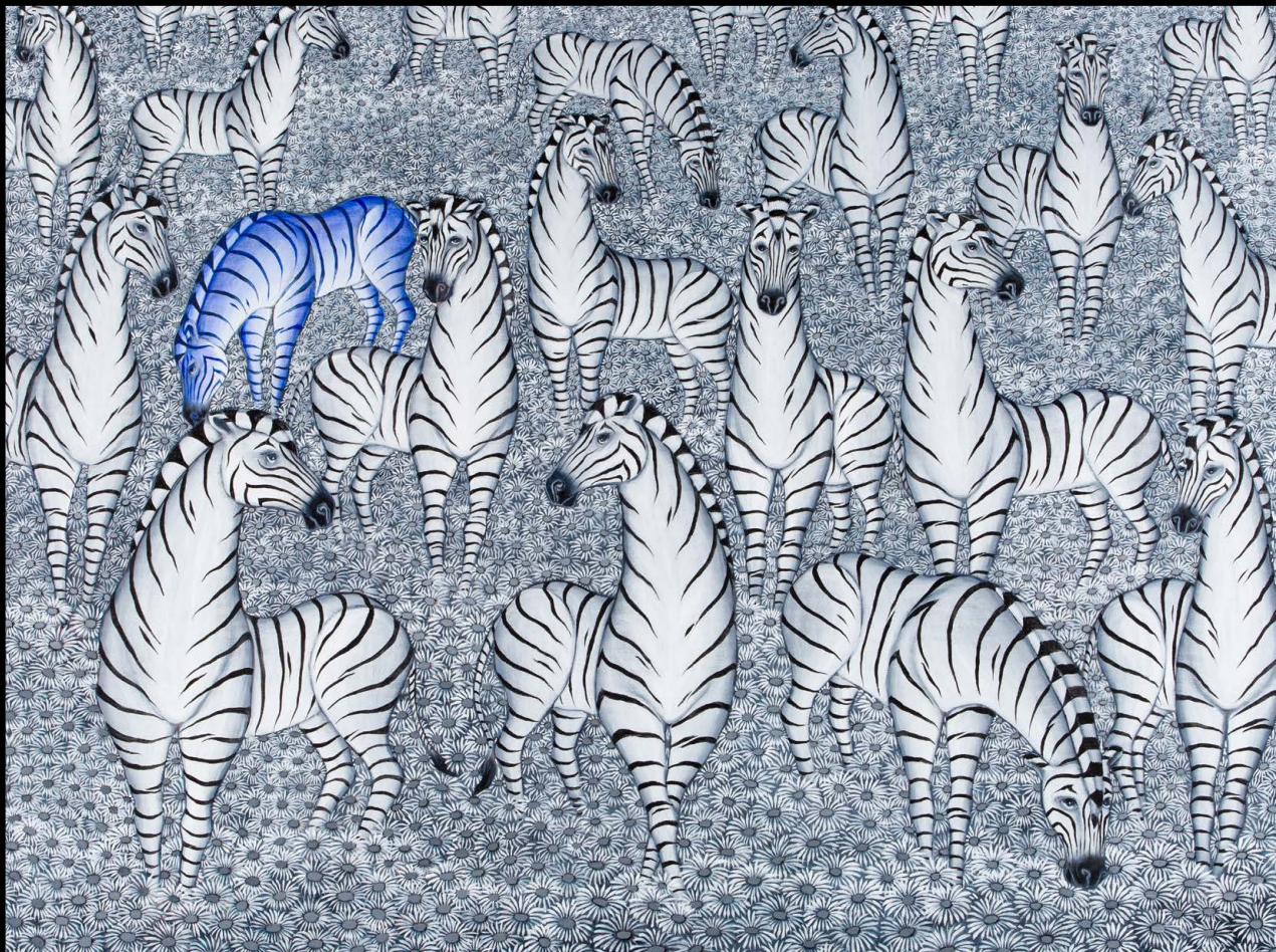
The One | acrylic on canvas | 36 x 48 inches