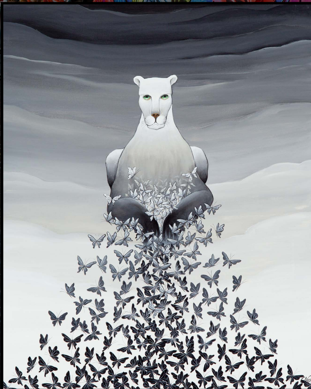
Transition | acrylic on canvas | 30 x 24 inches