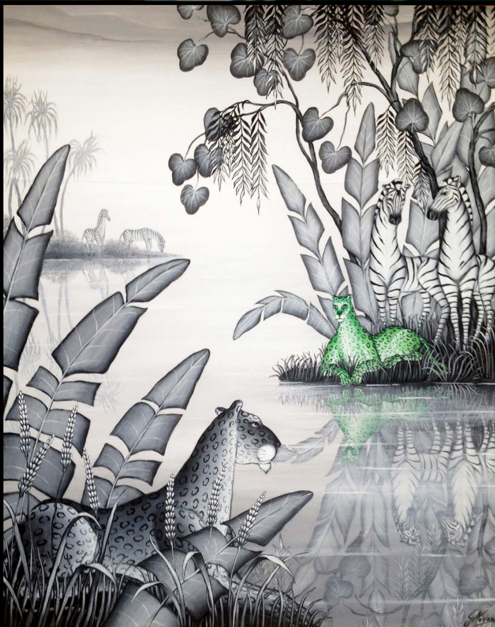
Green Leopard | acrylic on canvas | 30 x 24 inches