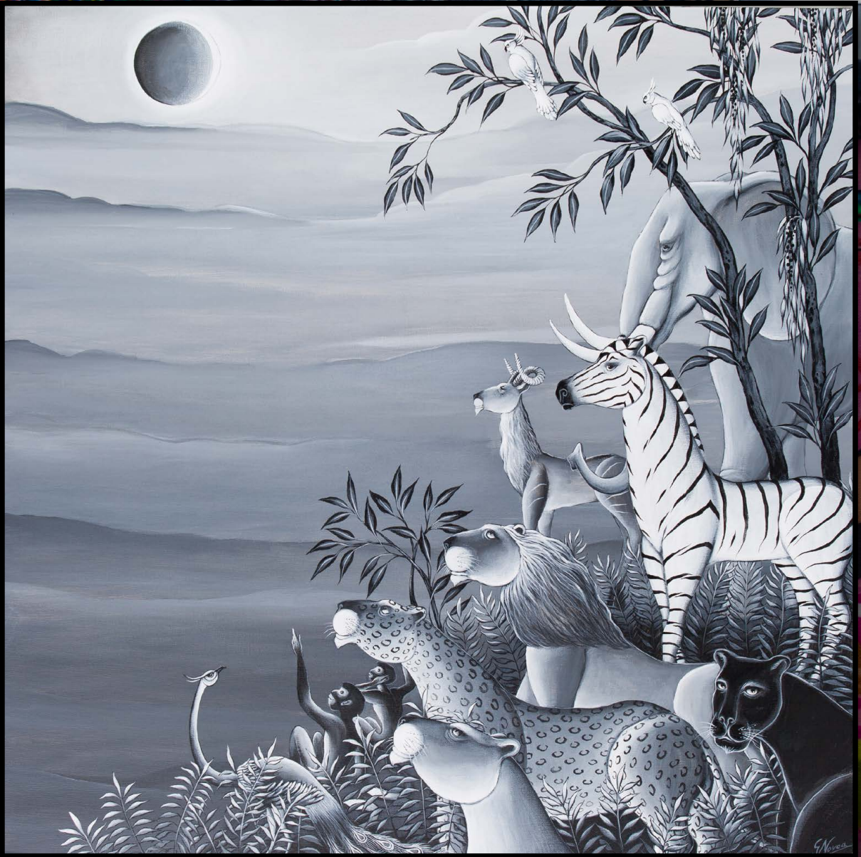
Eclipse | acrylic on canvas | 36 x 36 inches