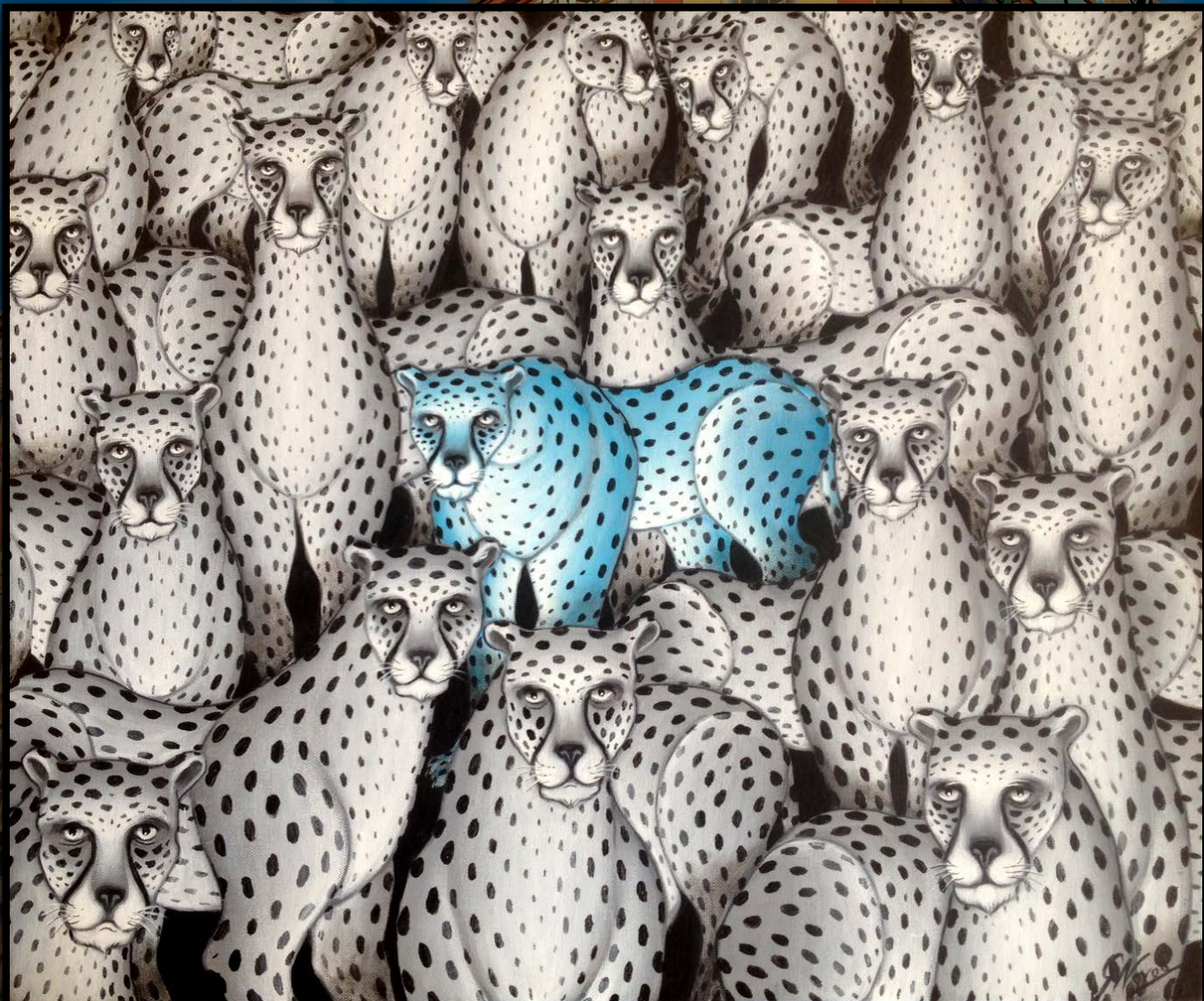
Blue Cheetah | acrylic on canvas | 20 x 24 inches