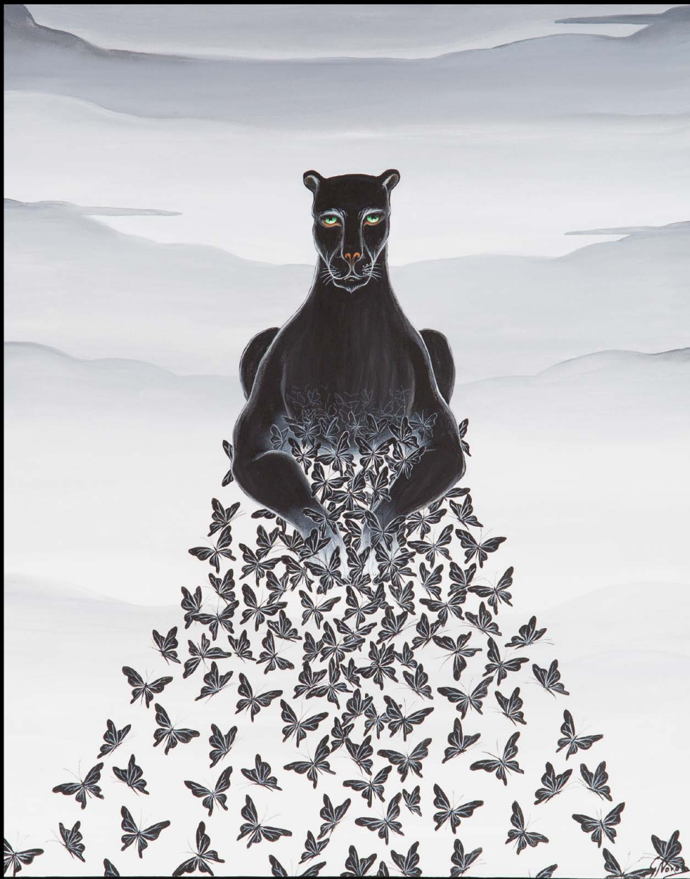
Rebirth I | acrylic on canvas | 30 x 24 inches