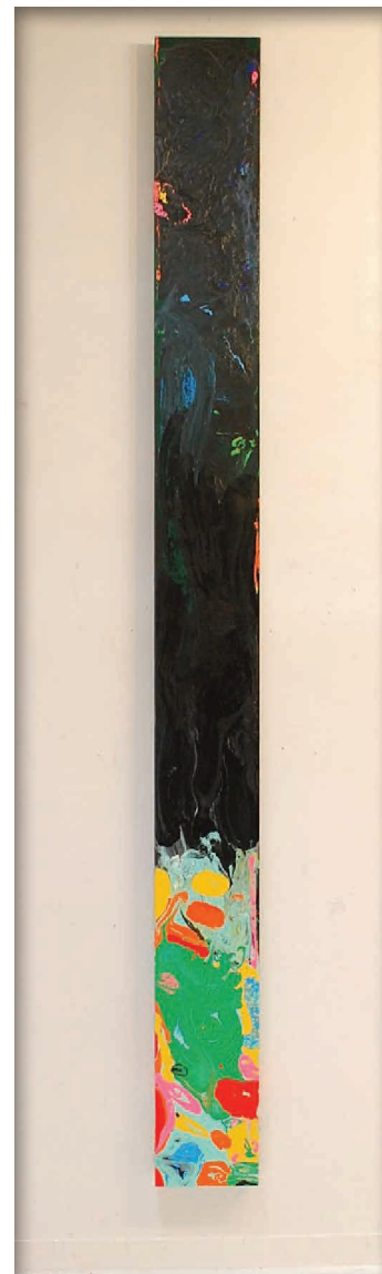
THREE QUARTER BLACK ENAMEL ON WOOD PANEL 120 X 11 INCHES FG 138265