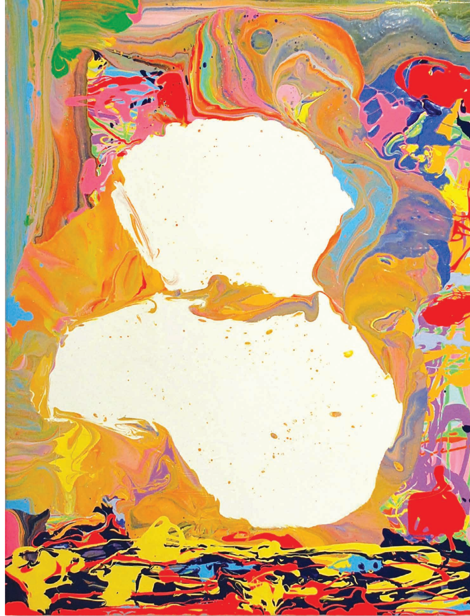
PORTRAIT OF RONNIE ENAMEL ON CANVAS 34 X 28 INCHES FG 138266