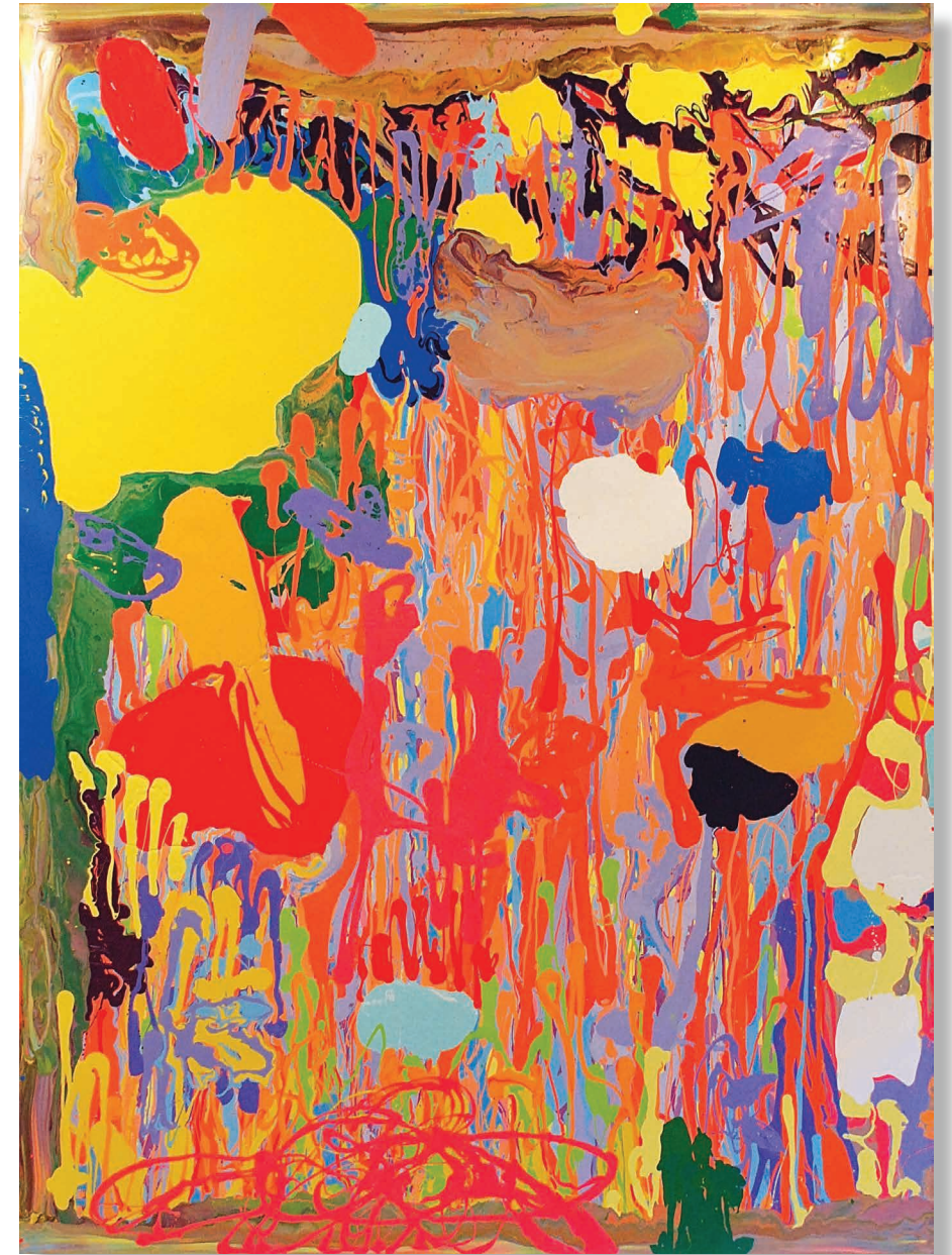
RED FORREST ENAMEL ON CANVAS 96 X 70 INCHES FG 138255