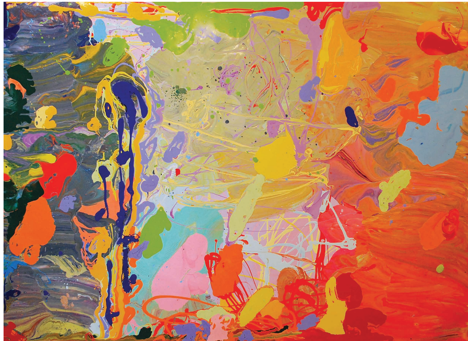
WORLD SOLUTION ENAMEL ON CANVAS 70 X 96 INCHES FG 138251