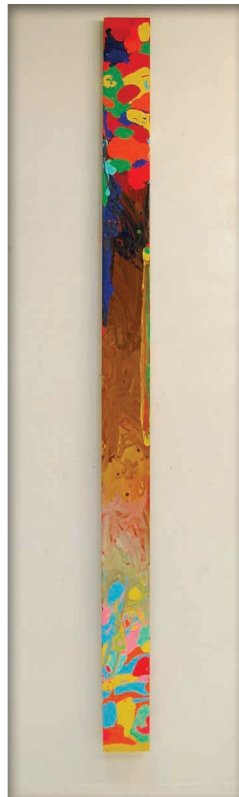
THE TRIP ENAMEL ON WOOD PANEL 120 X 11 INCHES FG 138315