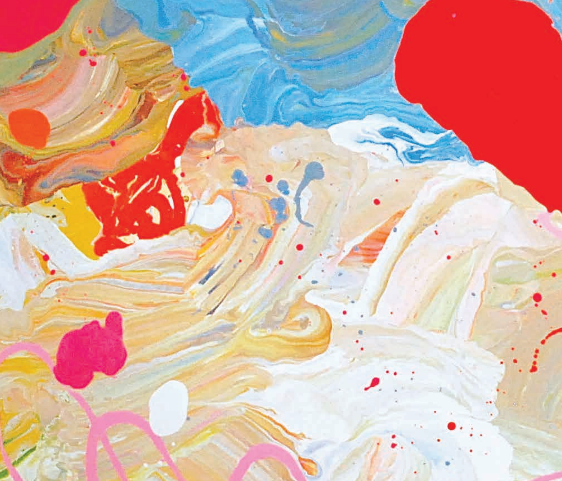
DOWN THE MIDDLE ENAMEL ON CANVAS 70 X 96 INCHES FG 138248