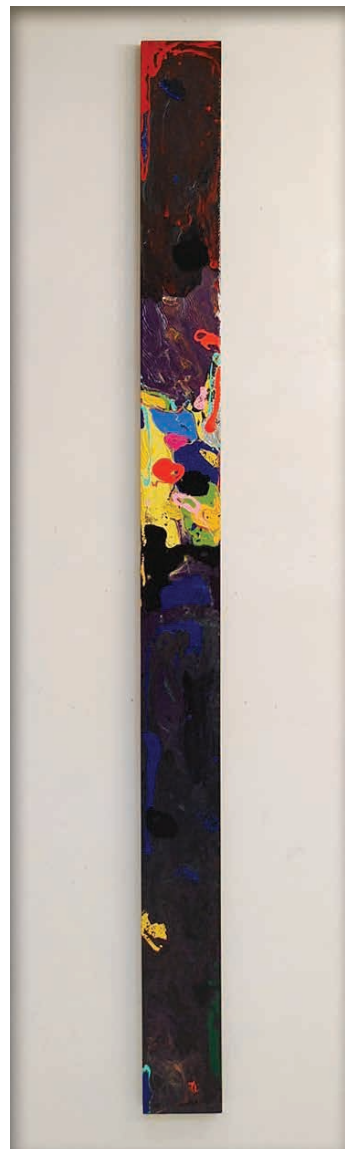
GARDEN OF EARTHLY DELIGHT ENAMEL ON WOOD PANEL 120 X 8 INCHES FG 138264