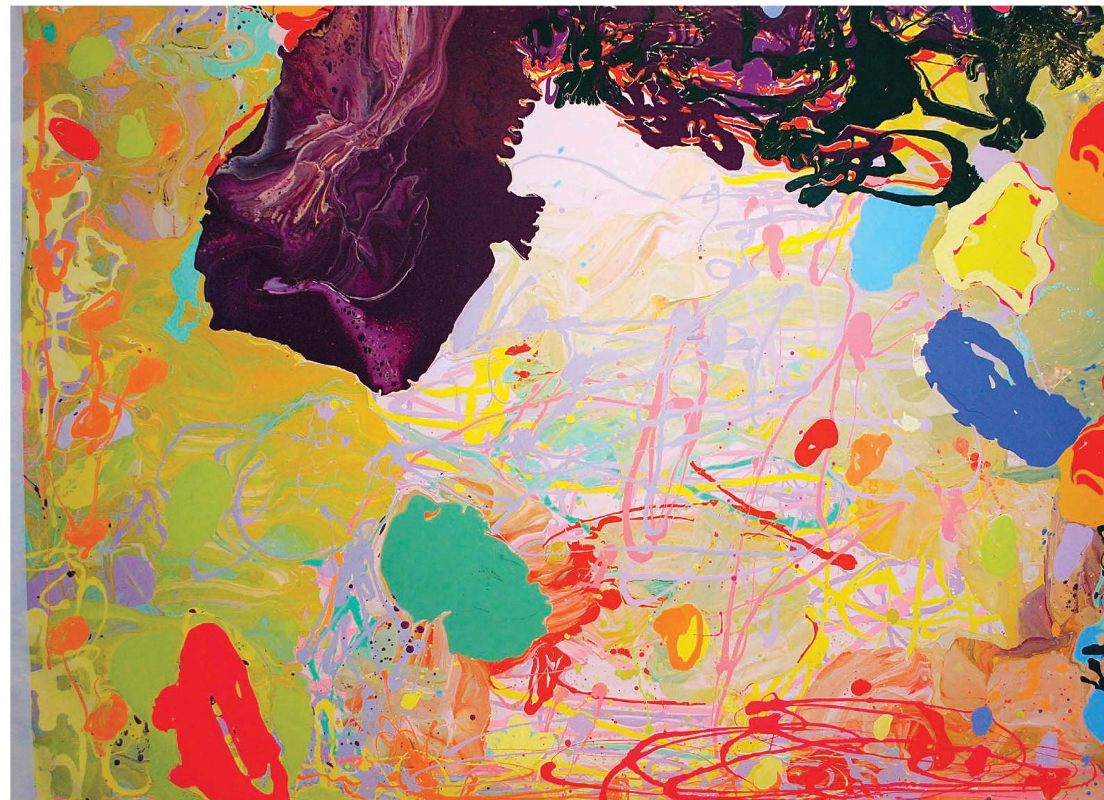
PURPLE TOP ENAMEL ON CANVAS 96 X 70 INCHES FG 138258