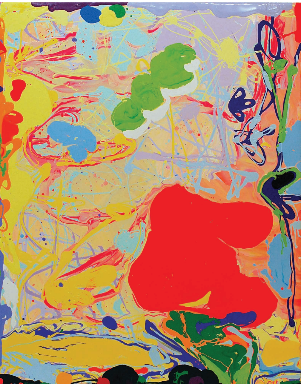
BRIGHT MISSISSIPPI ENAMEL ON CANVAS 72 X 58 INCHES FG 138257