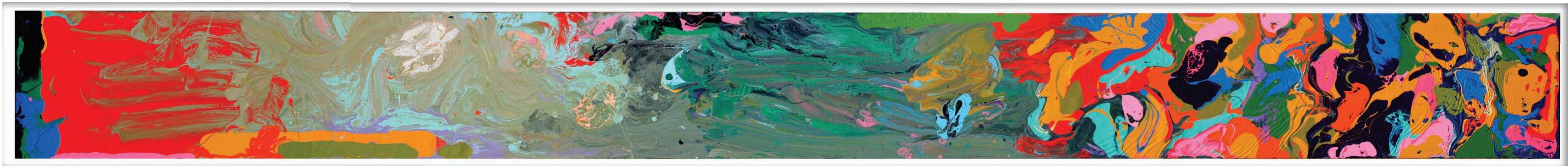
FLOWERS IN THE GARDEN | Enamel on wood panel | 120 x 11 inches | FG 138314