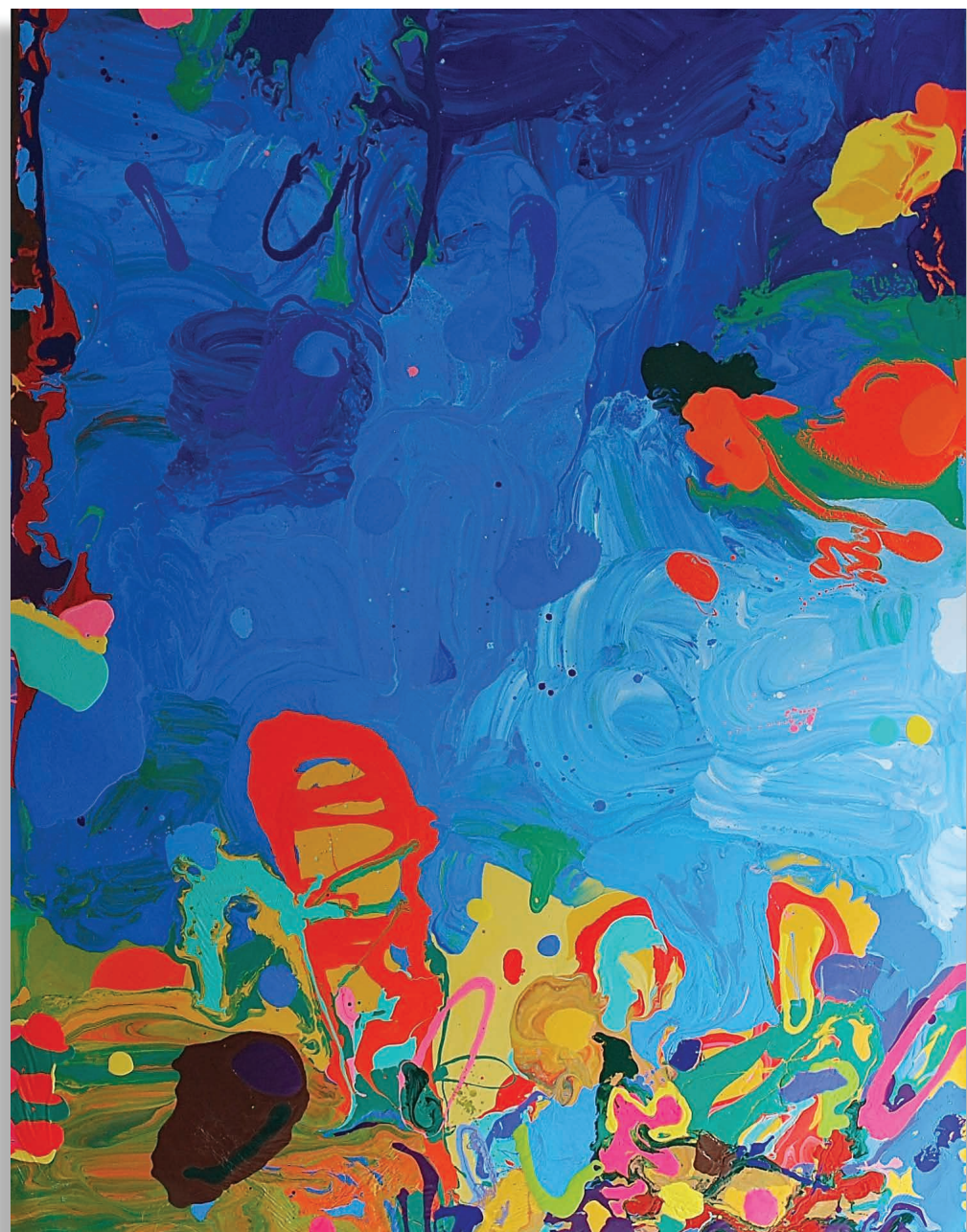
BAY CITY BLUE ENAMEL ON CANVAS 96 X 70 INCHES FG 138260